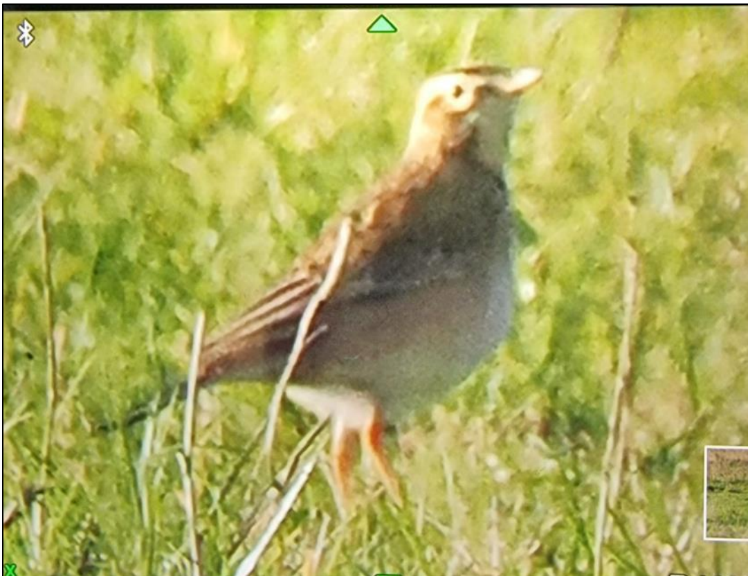
Richards Pipit photographed today at Paradise Pools - Saltfleet © Chris Atkin - for more images see BlueSky https://bsky.app/profile/nighthawk013.bsky.social/post/3m6hrfhazyc2g