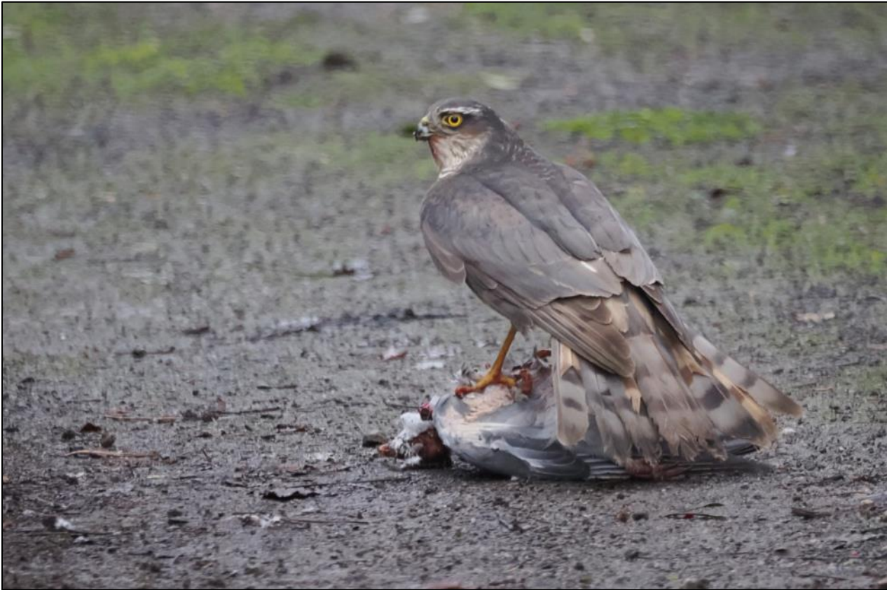
Sparrowhawk with Woodpigeon in a Fulbeck garden 19/11/2025