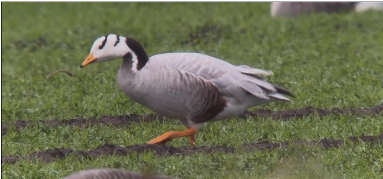
The Bar-headed Goose of 'unknown origin' seen at Boultham Mere today © Oliver Simpson

Black-Throated Diver (Juvenile ) - Still present on Site