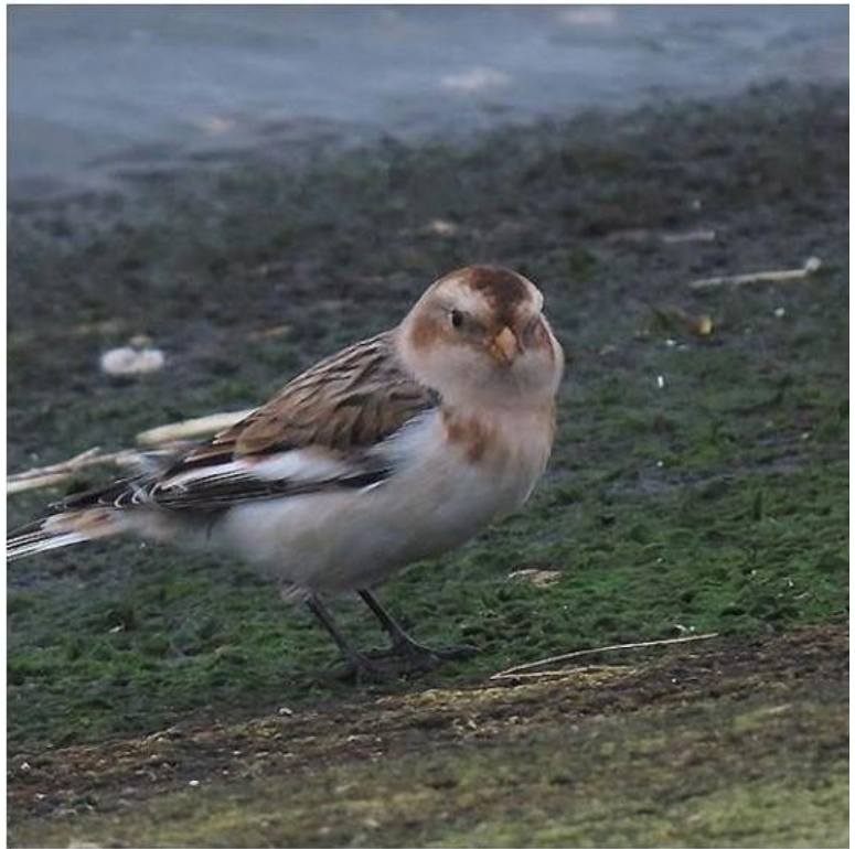
Snow Bunting, Red-Throated Diver, Black-Throated Diver and Great Northern Diver seen today at Covenham Reservoir