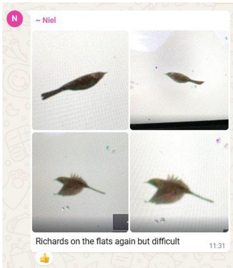
Screen grab images of the Richard's Pipit at Alkborough from the LBC WhatsApp Group