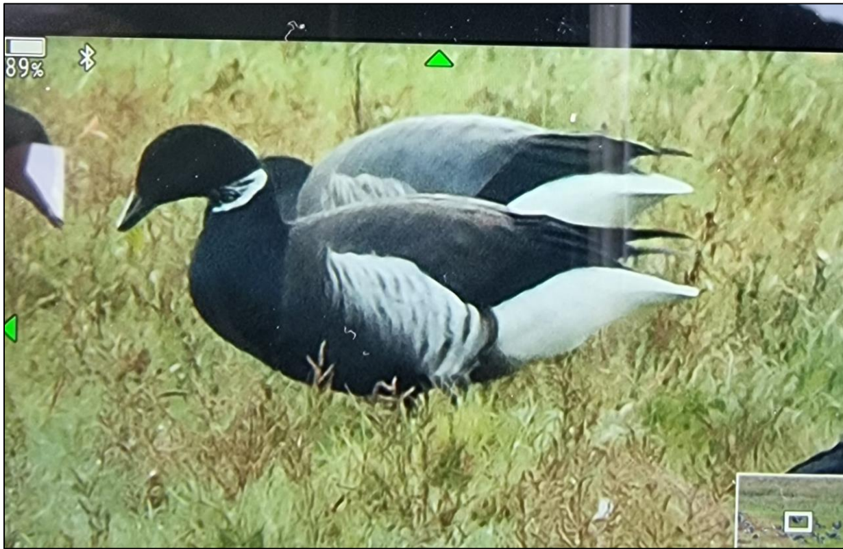
Black Brant photographed today at Saltfleet