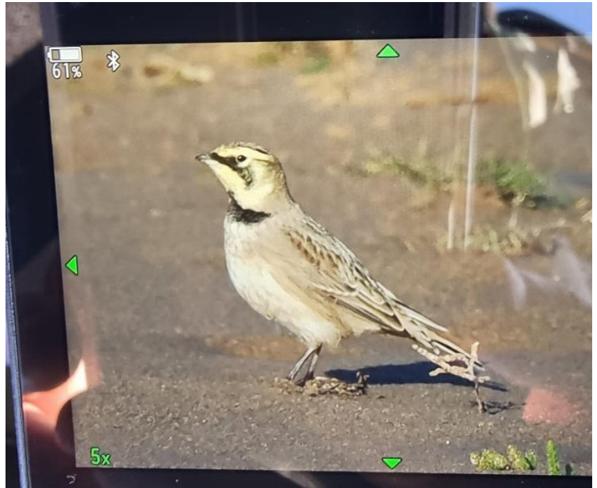
One of the Three Shore Larks photographed Today

Long-Eared Owl (1), Black Headed Gull, Coot, Cormorant, Dunnock, Fieldfare, Gadwall, Greenfinch, Mallard, Mute Swan, Redwing, Rook, Shoveler, Song Thrush, Woodpigeon