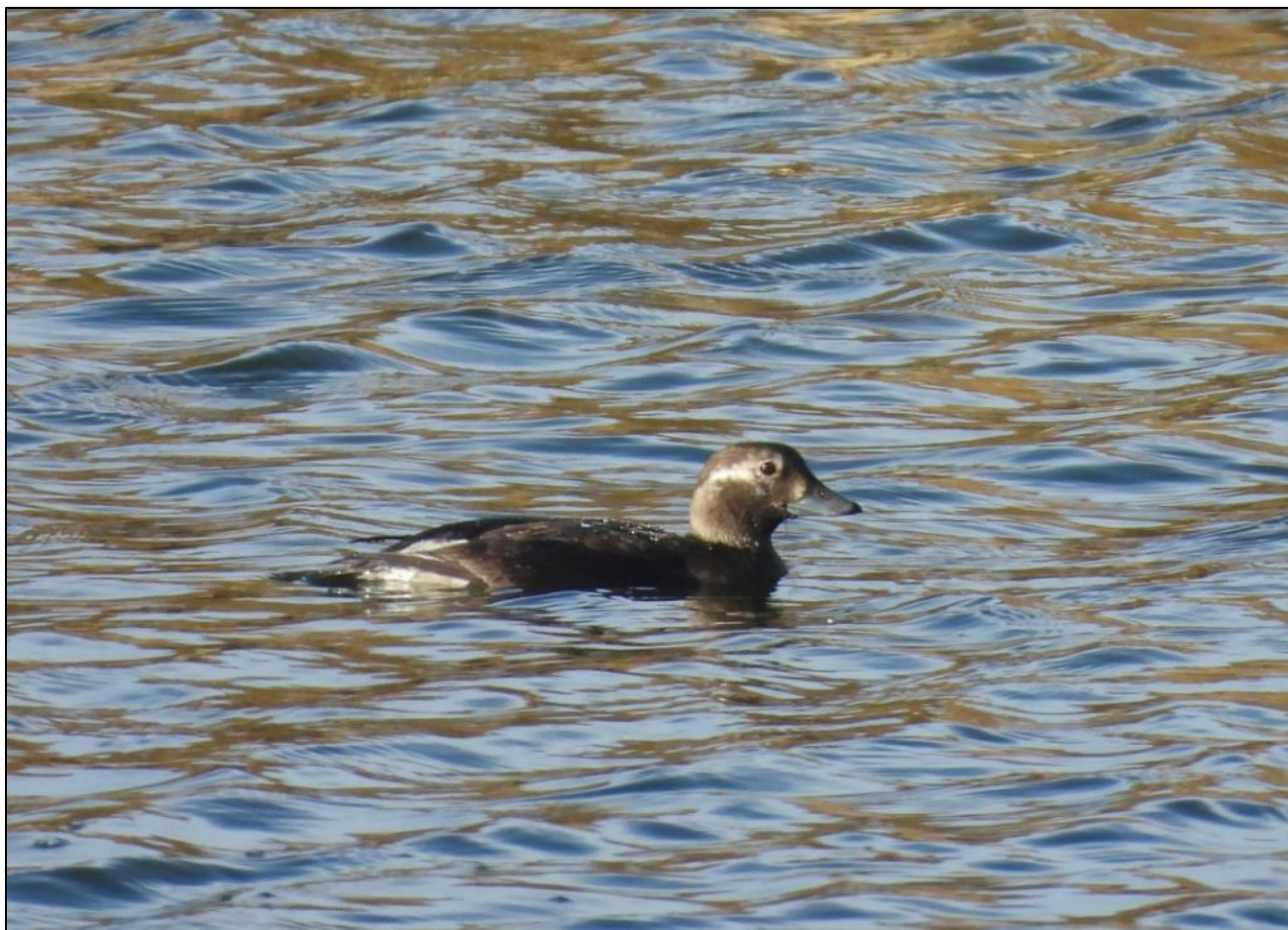
Long-tailed Duck at Goxhill Marshes on 9th November 2025