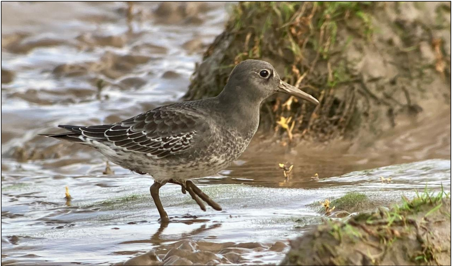
Purple Sandpiper Spotted today at Alkborough Flats

Blackbird, Blue Tit, Buzzard, Great Spotted Woodpecker, Green Woodpecker, Jackdaw, Pheasant, Robin, Skylark, Wren