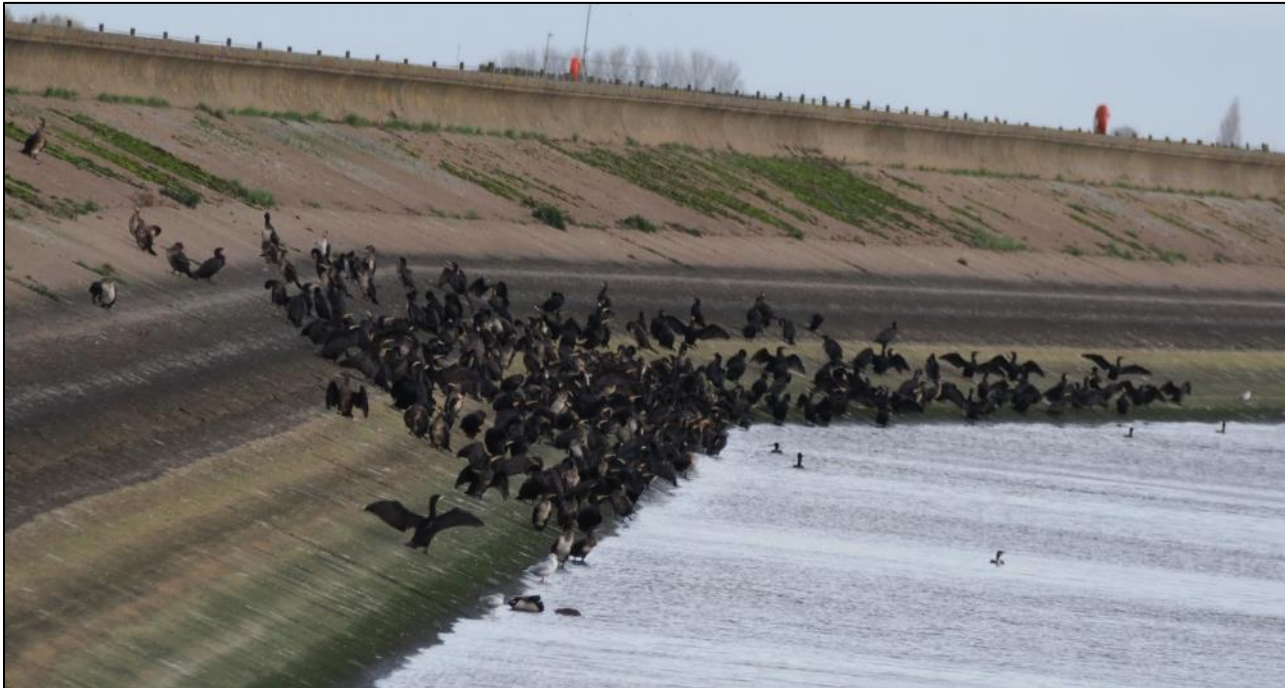
390 Cormorants at Covenham Res on 20th Nov 2025