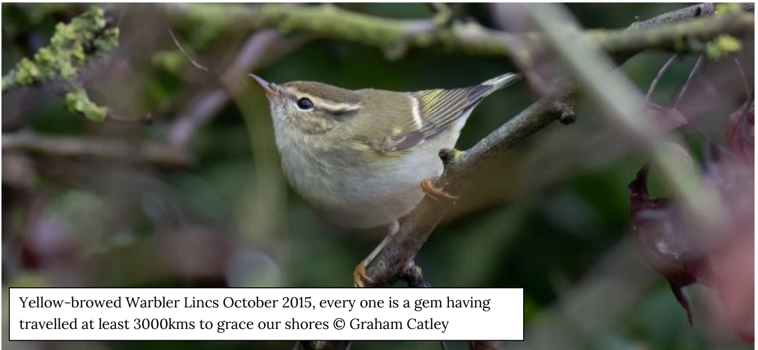
Yellow-browed Warbler Lincs October 2015, every one is a gem having travelled at least 3000kms to grace our shores

Read the FULL article at https://www.grahamcatley.com/blog-1/eastern-phylloscopus-warblers-some-ramblings-and-images