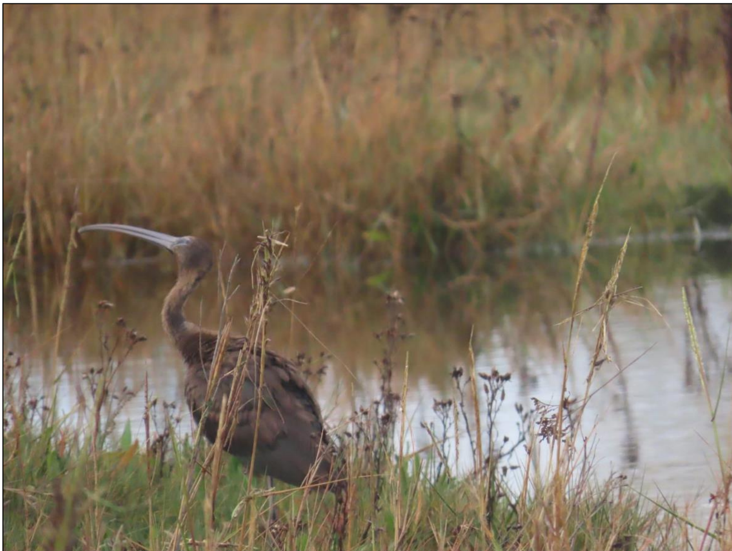
Glossy Ibis captured today at Cleethorpes Saltmarsh © Jim Wright