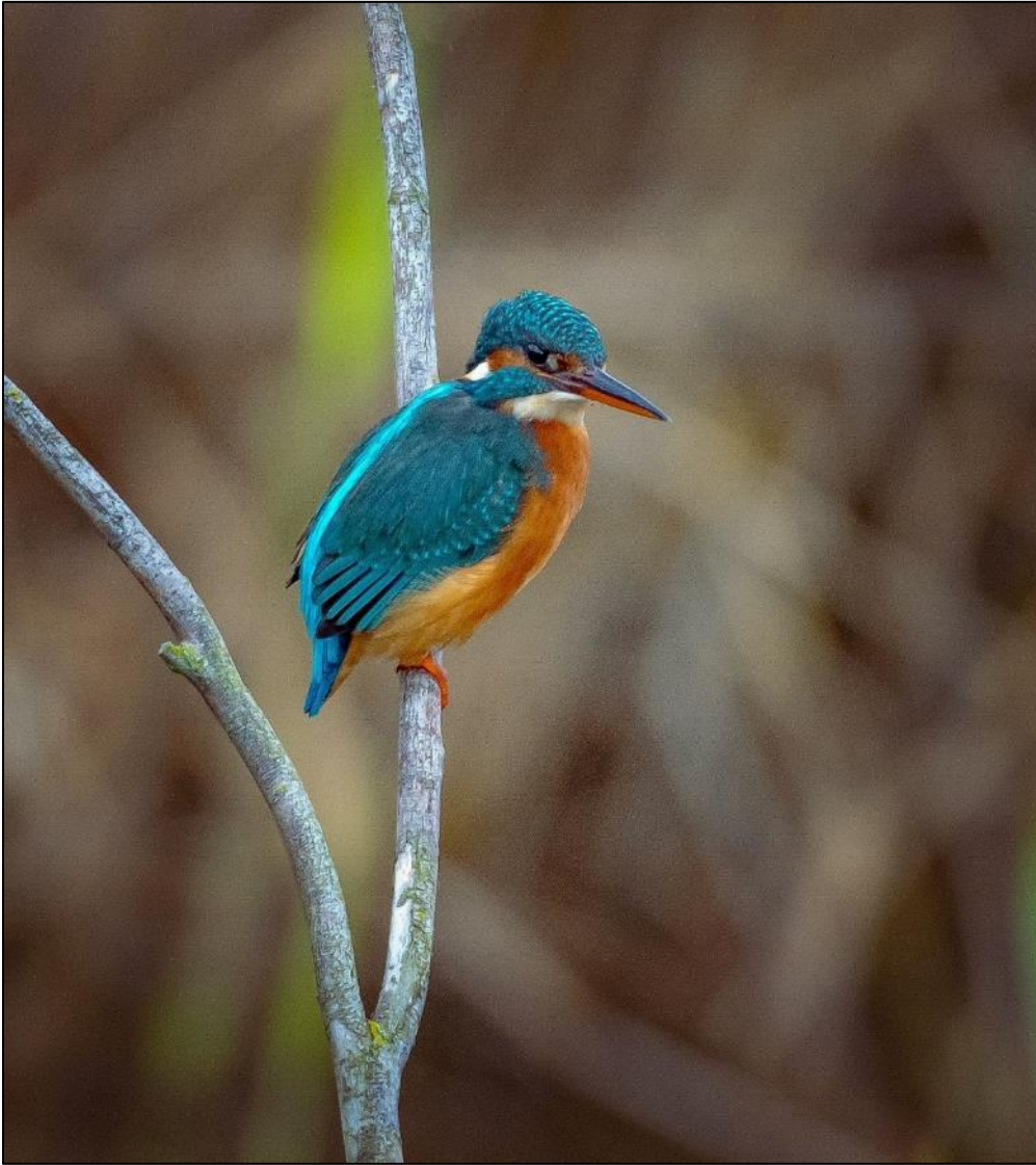
Kingfisher (female) Far Ings © Stuart Mackman