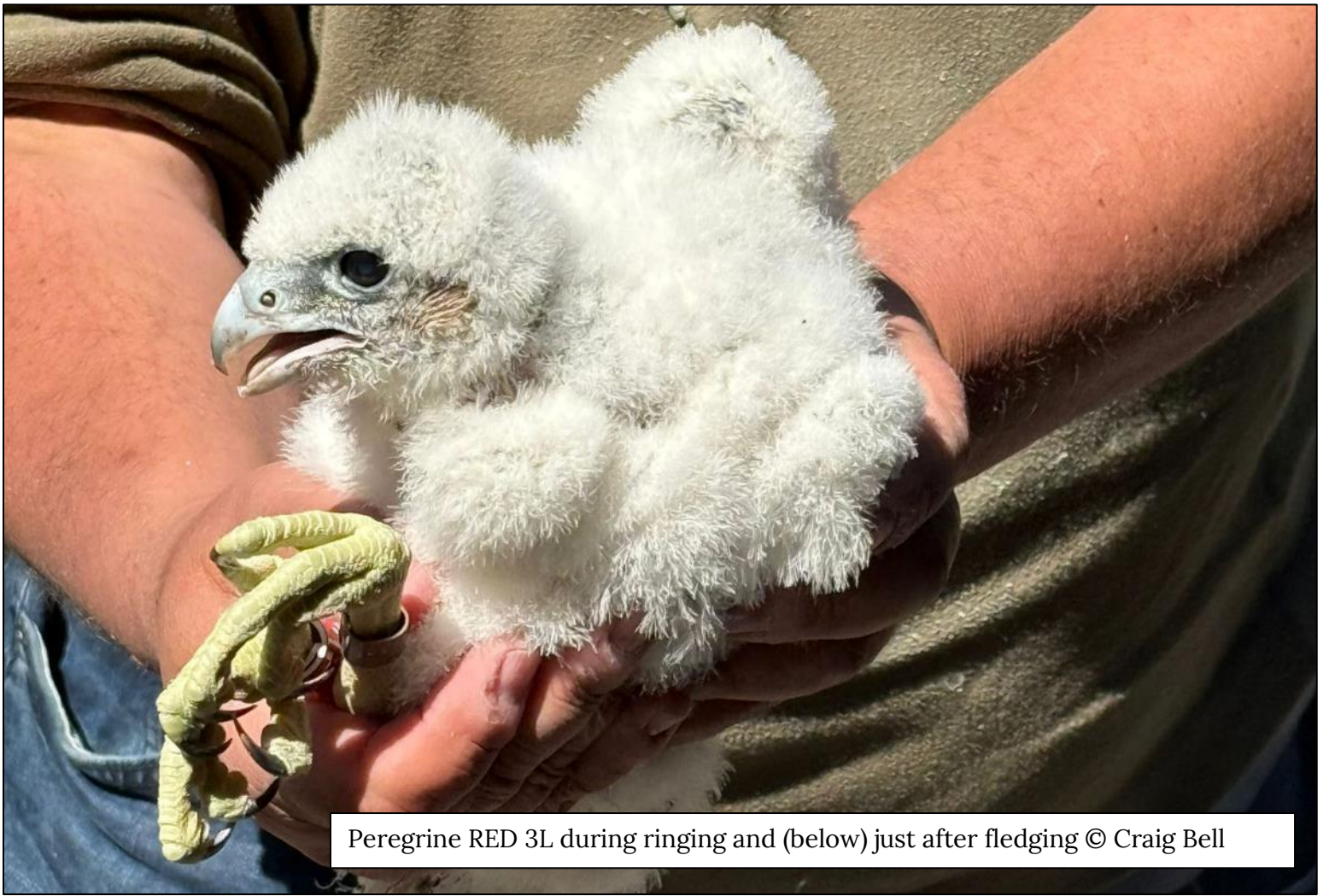
Peregrine RED 3L during ringing and (below) just after fledging