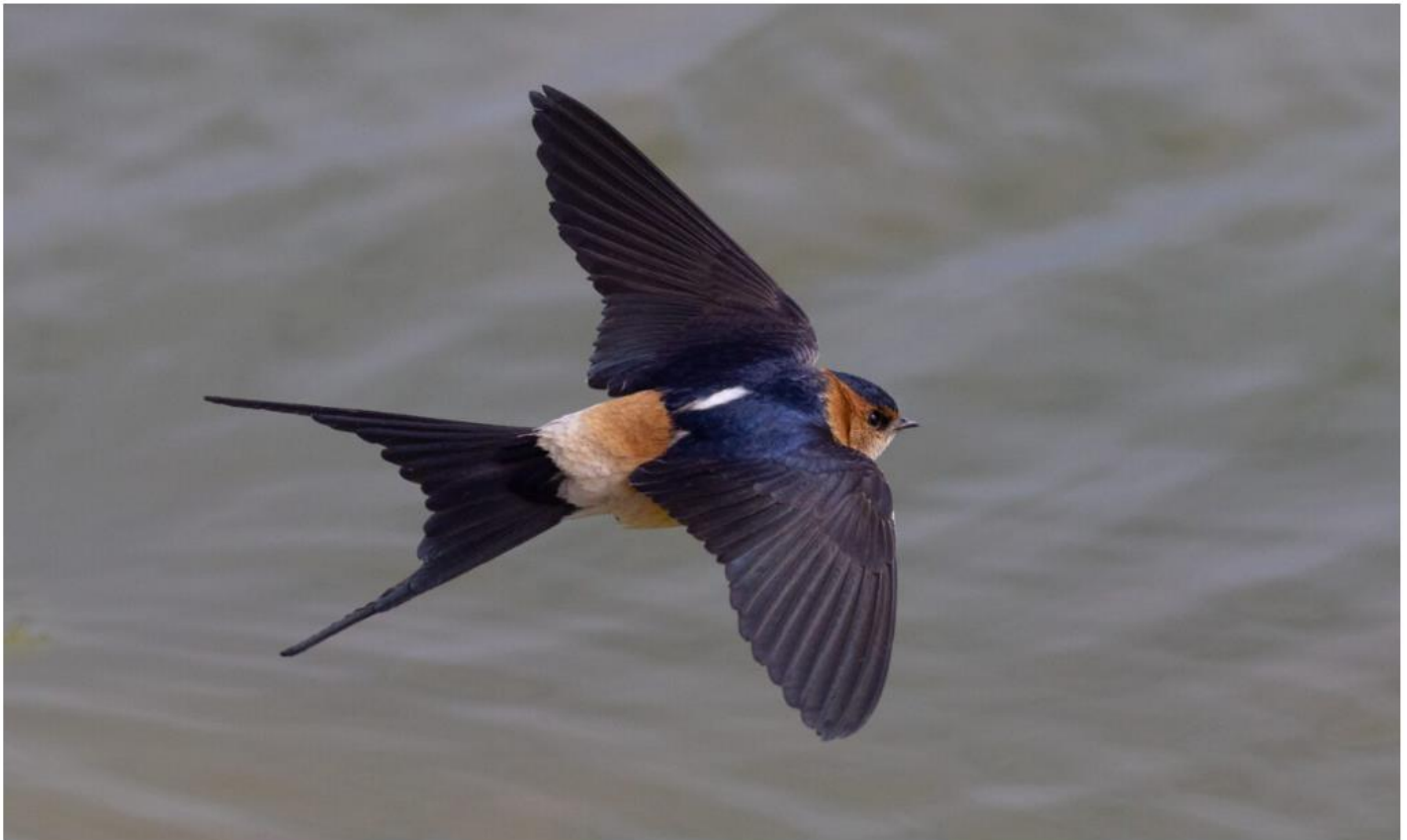
While most taxonomic arrangements that the TaxCom considered had precedent on at least one of the three global lists, sometimes investigation of a discrepancy led to novel insights. Recent work by the Taxonomic Committee resulted in a complete reshuffling of Cecropis swallows in the C. daurica - C. striata complex: a lump of Striated Swallow Cecropis striolata with C. daurica reduced the number of species in South and Southeast Asia, two new species were split: C. melanocrissus of Africa (African Red-rumped Swallow) and C. rufula (European Red-rumped Swallow; shown here).