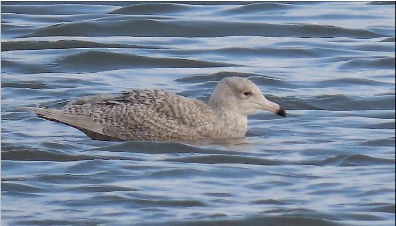
Glaucous Gull found by Mike Pilsworth on 23rd November 2025, the first record for Novartis

Black-Throated Diver (Juvenile) , Red-Throated Diver , Great Northern Diver , Red-Breasted Merganser , Common Scoter - All still present on Site