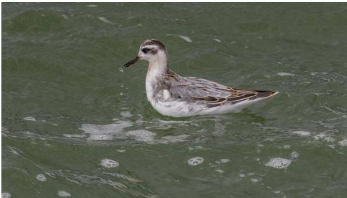
One of the Two Grey Phalarope Spotted today at Covenham Reservoir

Shelduck (2), Eider (2), Wigeon (1), Common Scoter (1), Bar-Tailed Godwit (1), Black-Tailed Godwit (2), Sanderling (1), Dunlin (8), Arctic Skua (3), Guillemot (4), Black Headed Gull (40), Common Gull (30), Caspian Gull (1), Sandwich Tern (67), Cormorant (47), Gannet (241), Manx Shearwater (1), Red-Throated Diver (19), Marsh Harrier (2), Meadow Pipit, Herring Gull (104)