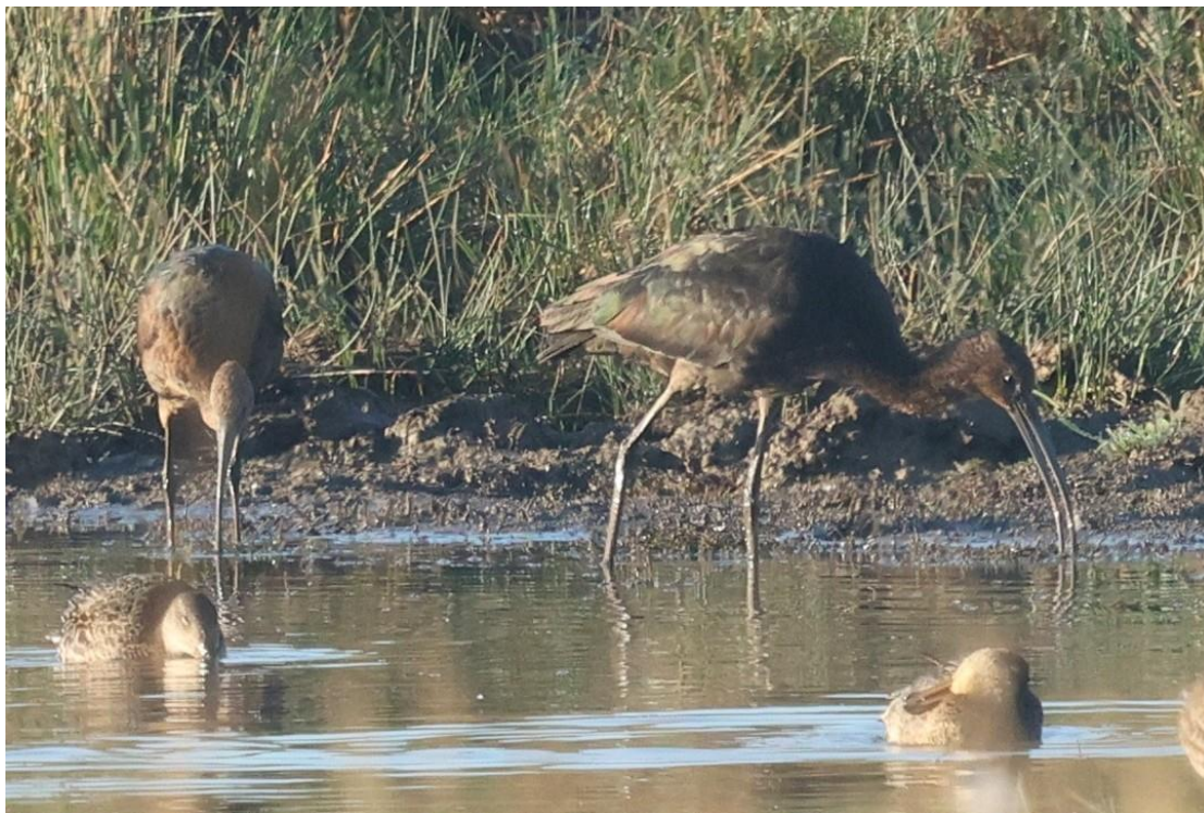
X2 Glossy Ibis, 29th September 2025

Marsh Harrier, Great Egret, Bearded Tit, Pintail (40), Peregrine Falcon, Green Woodpecker, Cettis Warbler, Brent Goose, Whooper Swan, Shelduck, Canada Goose, Teal, Tufted Duck, Collared Dove, Stock Dove, Avocet, Lapwing, Bar-Tailed Godwit, Black-Tailed Godwit, Barn Owl, Linnet, Meadow Pipit