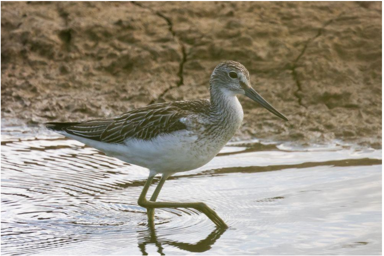
Greenshank at Frampton Marsh