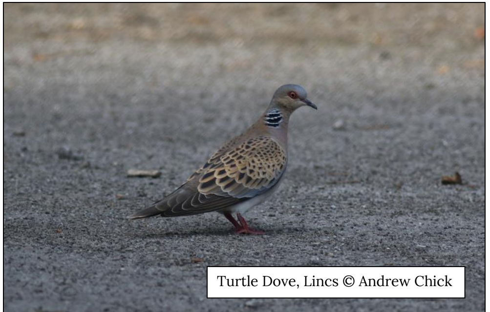
Turtle Dove, Lincs

The statement confirms that Operation Turtle Dove does not currently support captive releases , even though such efforts may be “well-intentioned.”