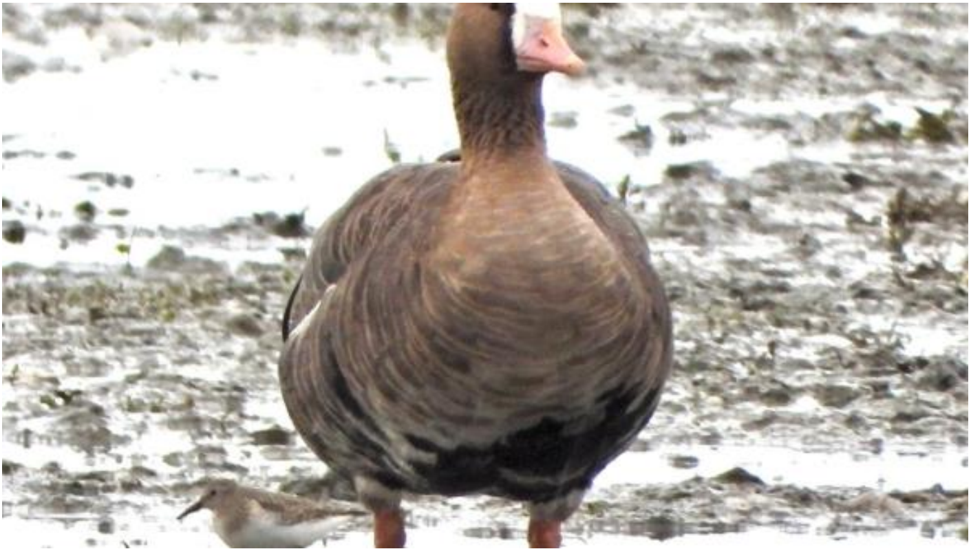
Russian White-Fronted Goose with Temmincks Stint seen today at Manby Flashes