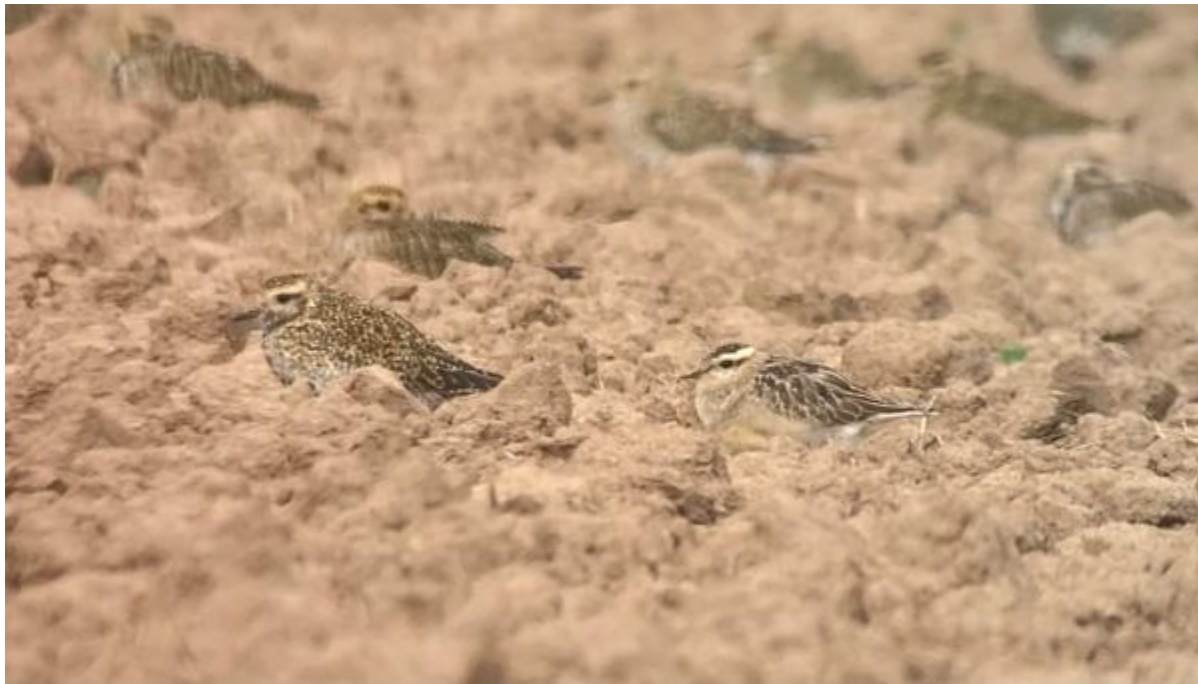
Dotterel Spotted Today At Horse Shoe Point