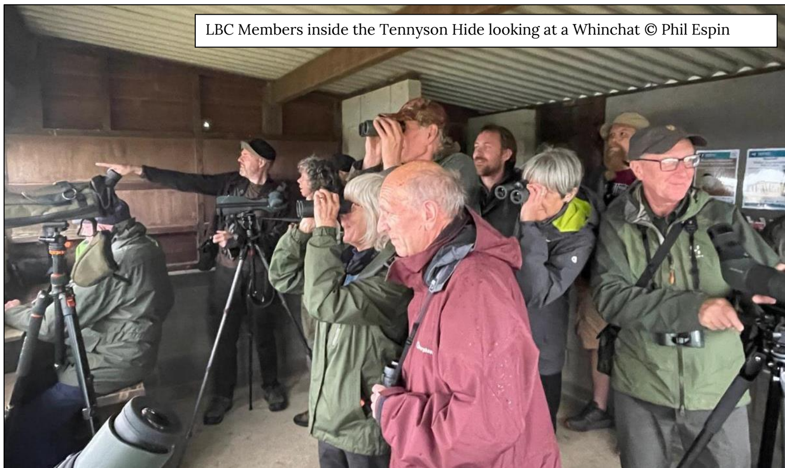
LBC Members inside the Tennyson Hide looking at a Whinchat

The sea stretches to the horizon Separated from us by creeks and marsh. Far away shapes; gannets, fulmars, shearwaters Swiftly moving dots over grey dawn sea. From the marsh the lonely call of the redshank Piercing the laughing chatter of jackdaws. Beautiful place not seen by me for 30 years; The same yet also unfamiliar. People I knew there no longer remembered; The old field station swept away in a high tide. Yet it is still here, still remembered, like a homecoming I immerse myself in its dawn to dusk, Happy among the flocks of waders, the solitary water rail, Happy among the green-clad birdwatchers sharing their sightings A camaraderie of expertise and free spirit Through their shared love of the wild.