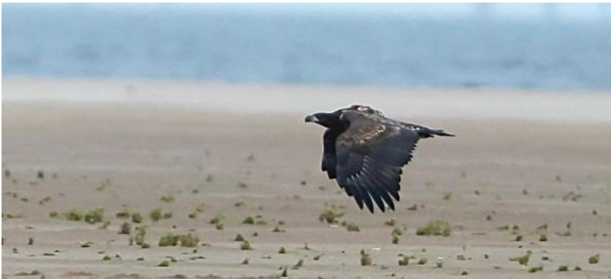
White-Tailed Eagle spotted today at Donna Nook © Mark

Avocet (1), Black-tailed Godwit (5) , Curlew (3) , Greenshank (2) , Marsh Harrier (3), Lapwing (80), Snipe (2), Spoonbill (17) , Swallow (66), Whooper Swan (1), Yellow Wagtail