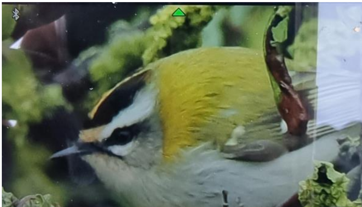
Firecrest captured today at Donna Nook NR

Spotted Redshank, Glossy Ibis (1), Black Redstart, Pink-Footed Goose, Brant Goose, Canada Goose, Shelduck, Shoveler, Wigeon, Mallard, Pintail, Teal, Common Scoter, Stock dove, Collared Dove, Oystercatcher, Curlew, Bar-Tailed Godwit, Black-Tailed Godwit, Redshank, Greenshank, Turnstone, Knot, Dunlin, Gannet, Skylark, Herring Gull, Cormorant, Little Egret, Marsh Harrier, Buzzard, Great Spotted Woodpecker, Lesser Whitethroat, Goldcrest, Redstart, Dunnock, Grey Wagtail, White Wagtail, Linnet, Siskin, Reed Bunting