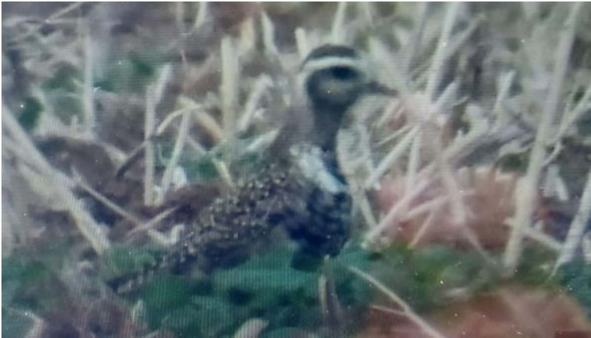
American Plover spotted today at Theddlethorpe

Black Headed Gull (6), Blackcap (1), Blue Tit (2), Buzzard (1), Carrion Crow (21), Cettis Warbler (1) , Collared Dove (1), Cormorant (2), Curlew (1) , Dunnock (2), Great Tit (4), Greenfinch (6), Grey Heron (1), Grey Wagtail (1) , Herring Gull (1), Little Egret (10), Long-Tailed Tit (8), Magpie (8), Meadow Pipit (2), Pheasant (3), Pied Wagtail (2), Reed Bunting (1), Robin (4), Starling (36), Woodpigeon (6), Wren (1)