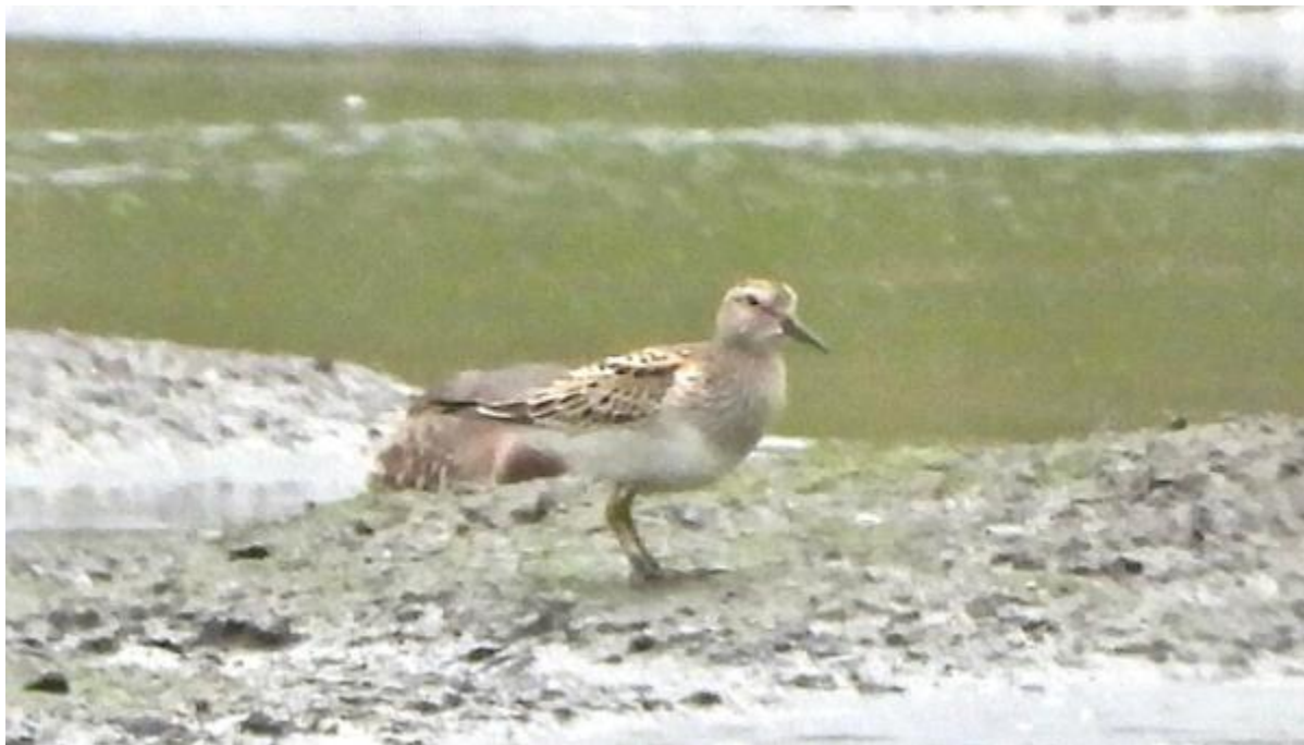
Pectoral Sandpiper spotted today at Boultham Mere © Andy Sims

Bar-Tailed Godwit, Black-Tailed Godwit , Buzzard (10), Canada Goose (20), Common Sandpiper (1), Coot (1), Cormorant (1), Curlew , Goldfinch (1), House Martin (10), Knot (18), Lesser Black-Backed Gull , Little Grebe (9), Mute Swan (13), Pied Wagtail (9), Robin (1), Ruff (1), Sand Martin (3), Shelduck, Shoveler (4), Starling (100), Stock Dove (1), Swallow (20), Teal (4)