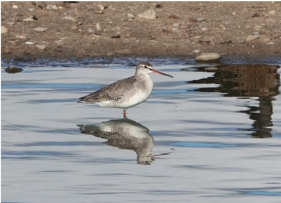
Spotted Redshank, 25th September 2025

Black Headed Gull, Black-Tailed Godwit , Buzzard (2), Canada Goose (7), Cormorant (3), Curlew , Gadwall (10), Golden Plover (200), Great Black-Backed Gull, Herring Gull, Linnet (5), Little Egret (1), Little Grebe (11), Mallard, Mute Swan (14), Pied Wagtail (3), Redshank, Ruff (1), Shelduck, Shoveler (30), Sparrowhawk (1), Stock Dove (4), Tufted Duck (1), Wigeon (3)