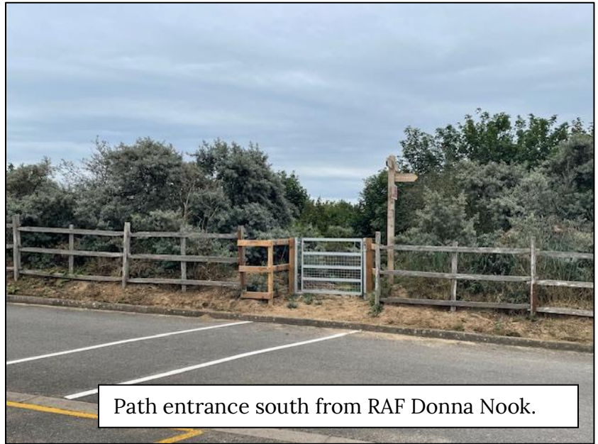
Path entrance south from RAF Donna Nook.

The new path cuts through the dunes from the south end of the LWT seal track and is fenced on both sides through to the RAF watch tower and base. It is rough cut and unsurfaced along the entire length and the vegetation is already growing back rapidly. It looks perfect for viewing migrants! It crosses the public footpath at RAF Donna Nook and delves through parts of the dunes; cut through impenetrable buckthorn I have never been through before. In this section the path is fenced on the sea