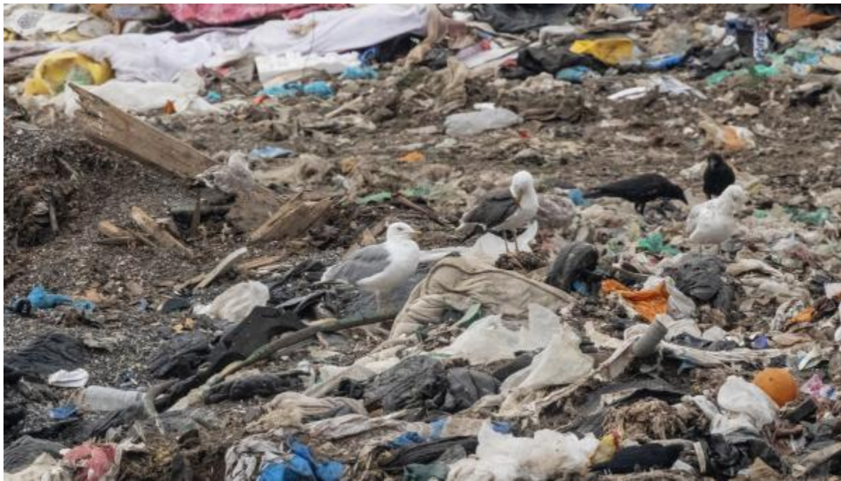
Yellow-legged Gull at Leadenham Tip