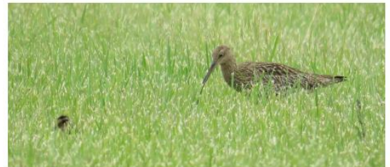
Curlew with 'just visible' chick at Cranwell June 2024 – Brian Lyon