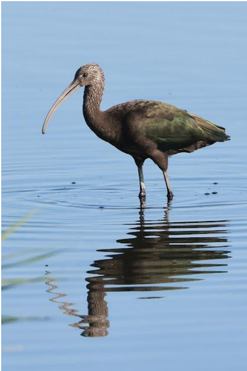
Glossy Ibis at Gibraltar Point