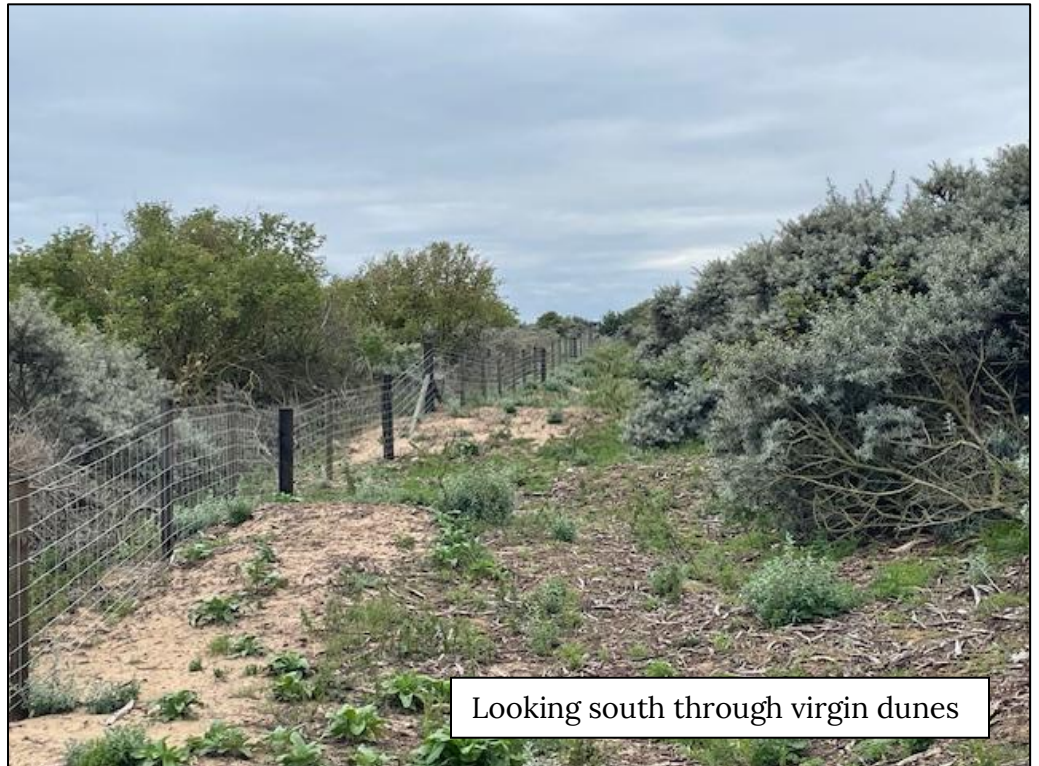
Looking south through virgin dunes