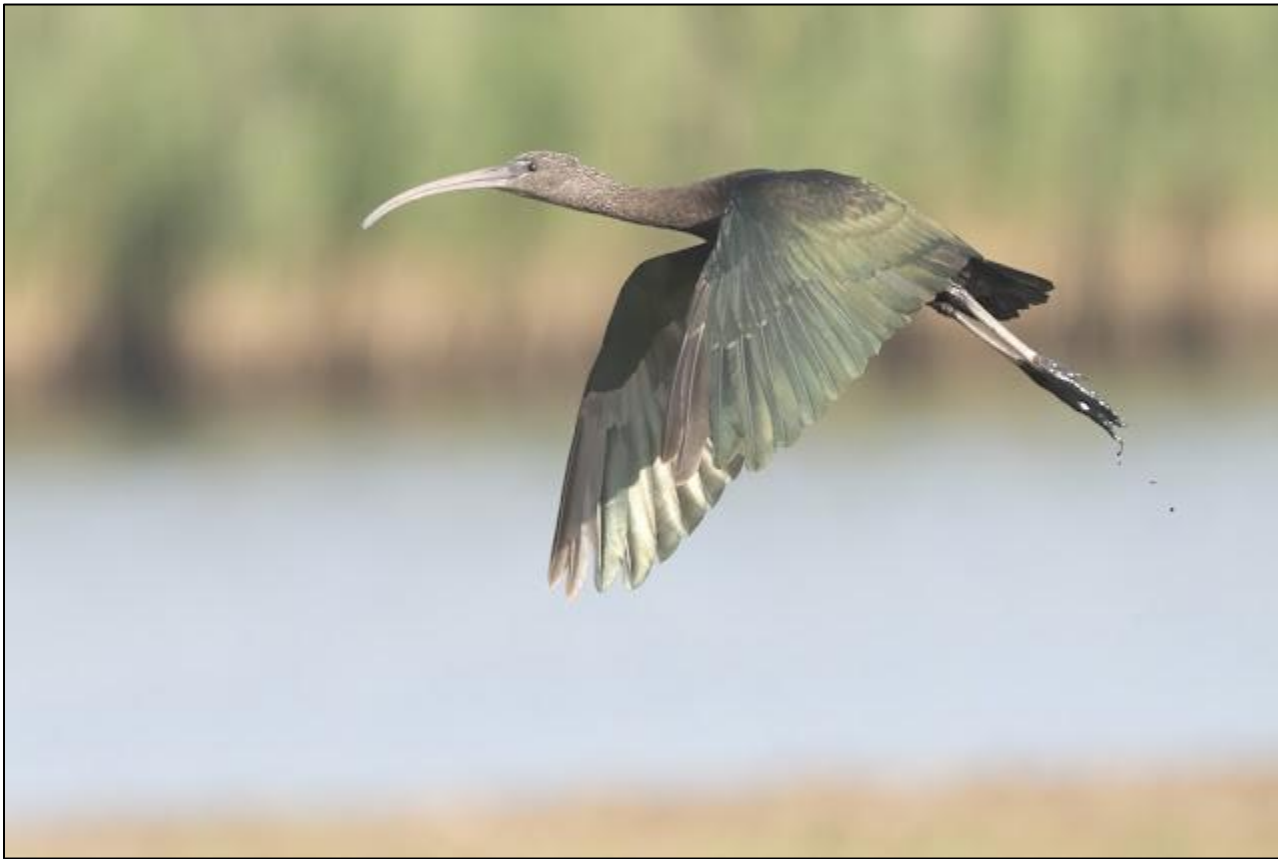
Glossy Ibis at Gib Point by Tom Baker on 11th August 2025

Glossy Ibis, Spoonbill (40), White rumped Sandpiper, Wood Sandpiper