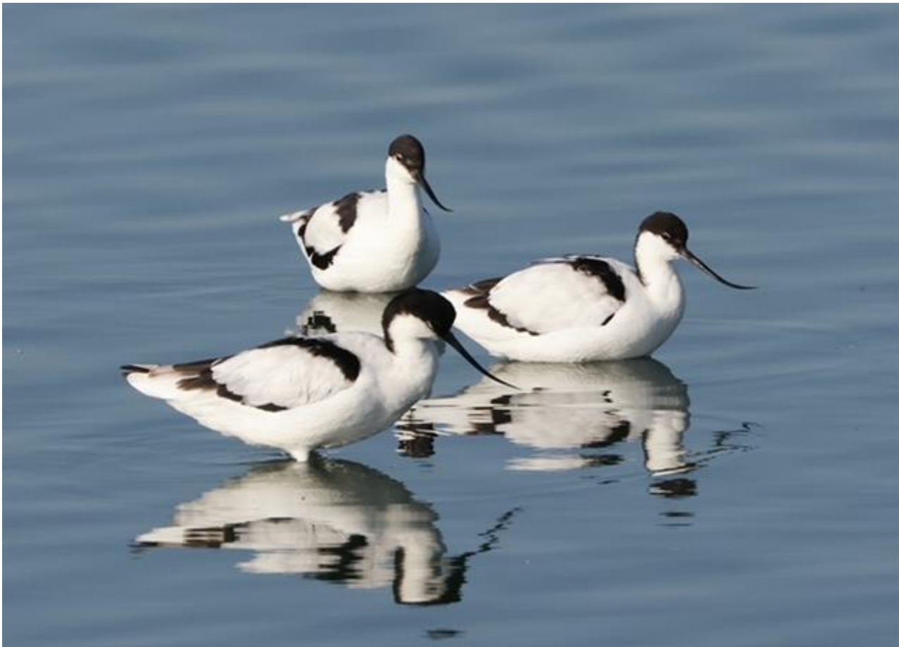
Avocets at Gibraltar Point 14 th August