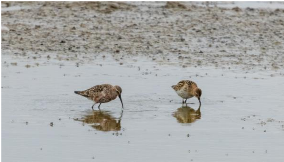
Curlew Sandpiper @ Frampton Marsh - Image © Chris Grimshaw

(27), Swallow (22), Wood Sandpiper (1) , Yellow Wagtail (1)