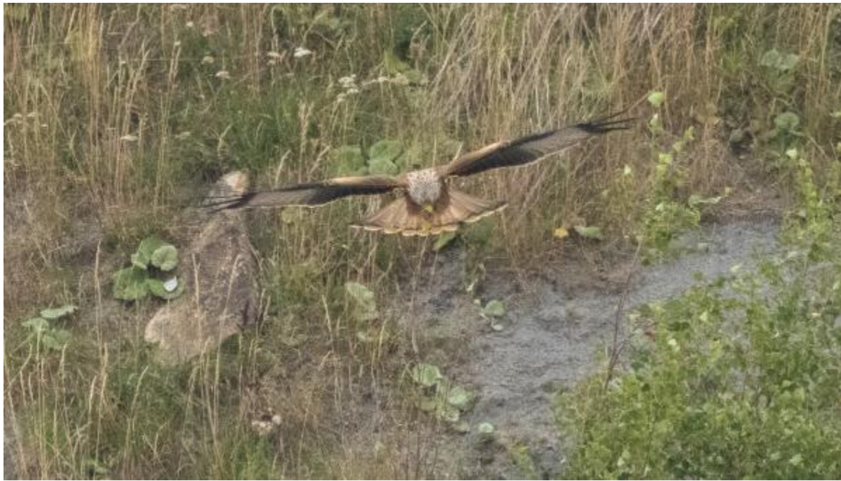
One of six Red Kite at Leadenham Tip