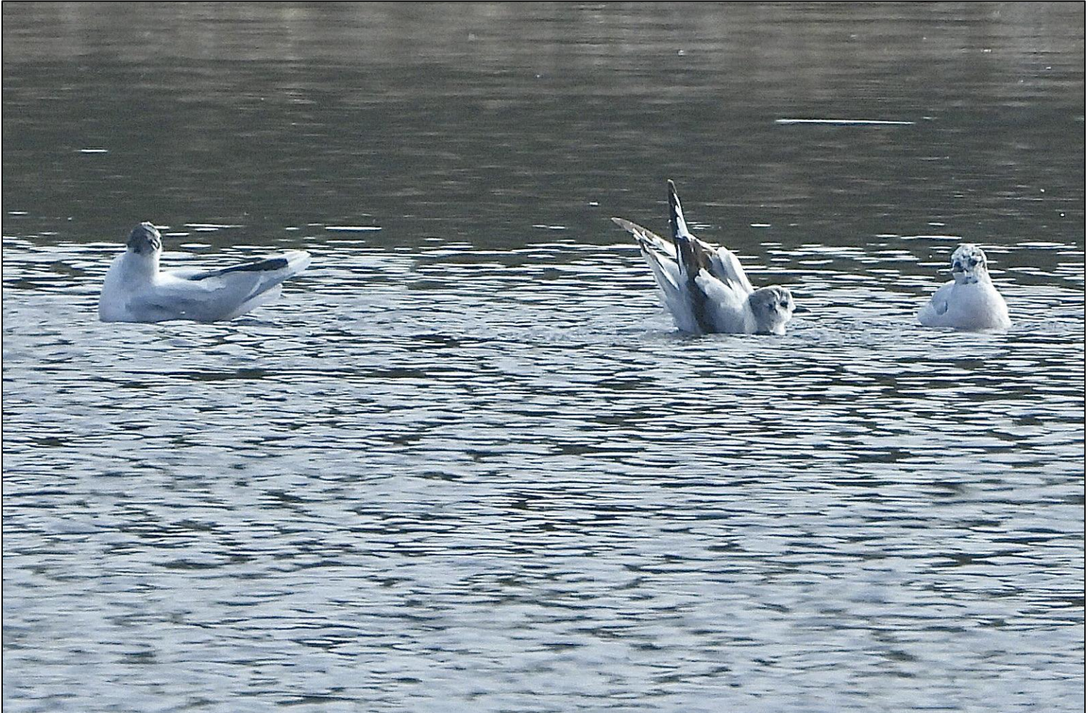
Three of the five Little Gulls that were at Boultham Mere