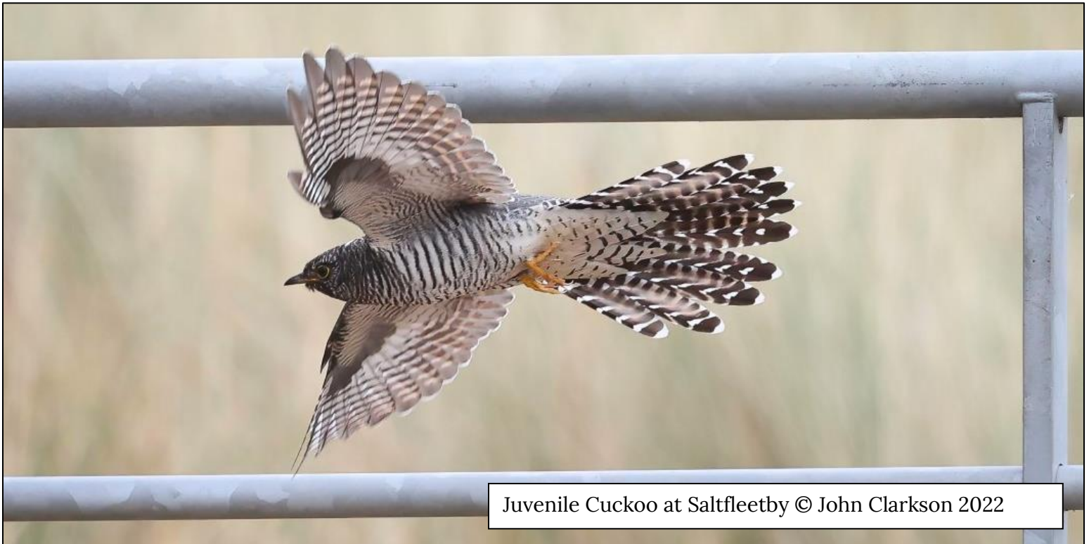
Juvenile Cuckoo at Saltfleetby

We have been able to share our expertise around tracking Cuckoos with other international studies, such as the Beijing Cuckoo Project ( https://www.bto.org/our-science/projects/cuckoo-tracking-project/about-project/international-projects ).