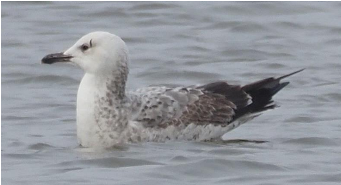
Caspian Gull at Cleethorpes Country Park