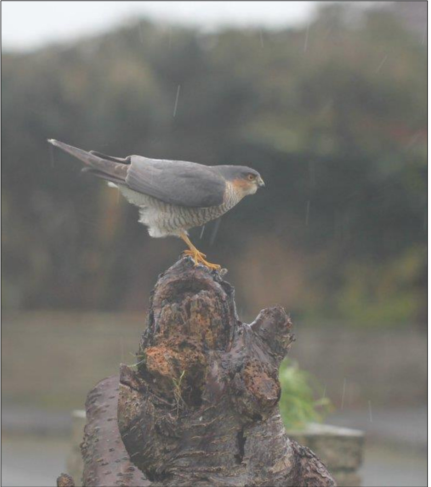
Sparrowhawk in Marton Garden - Image © Brian Hedley