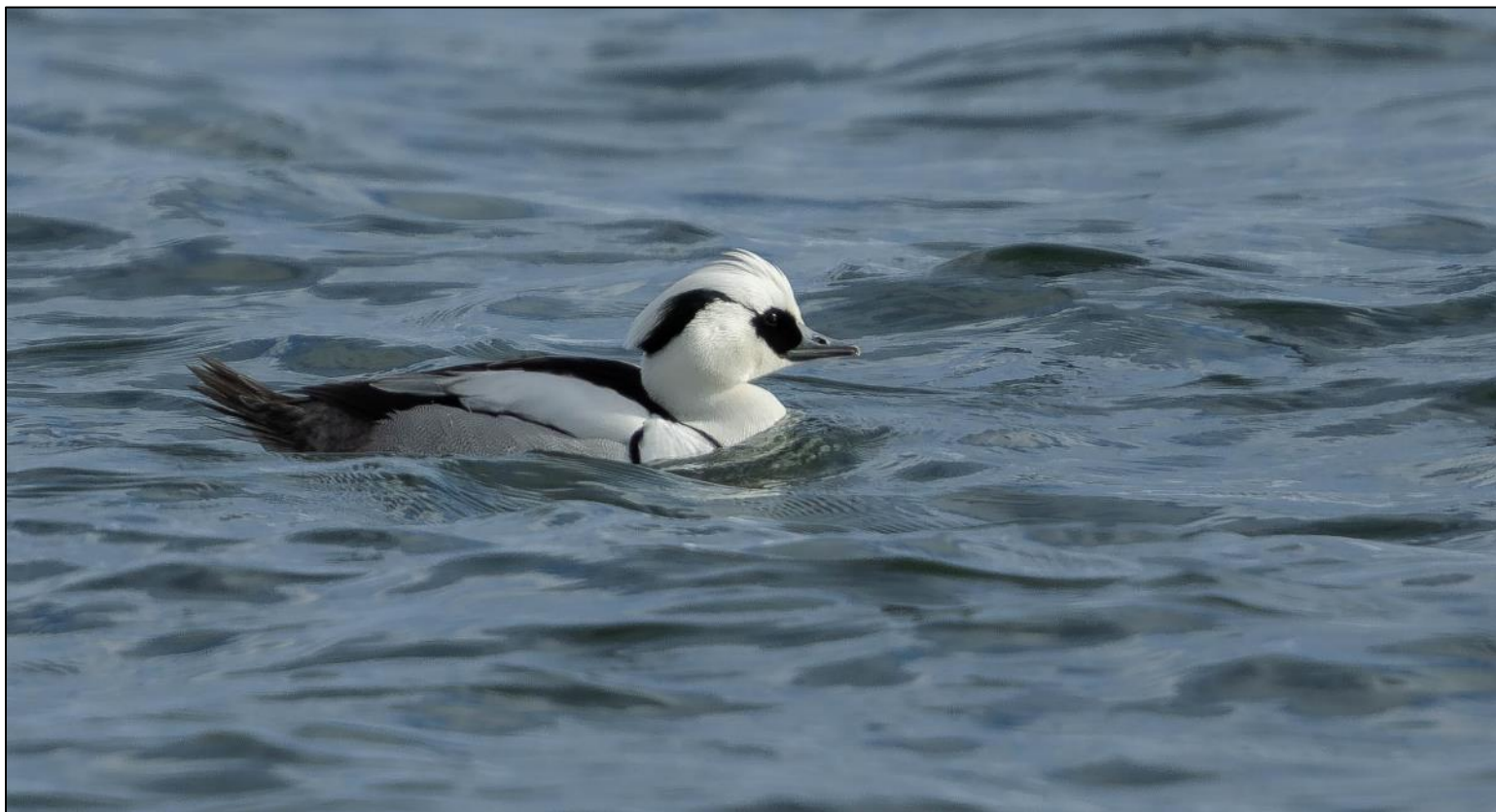
The Smew at Covenham Reservoir