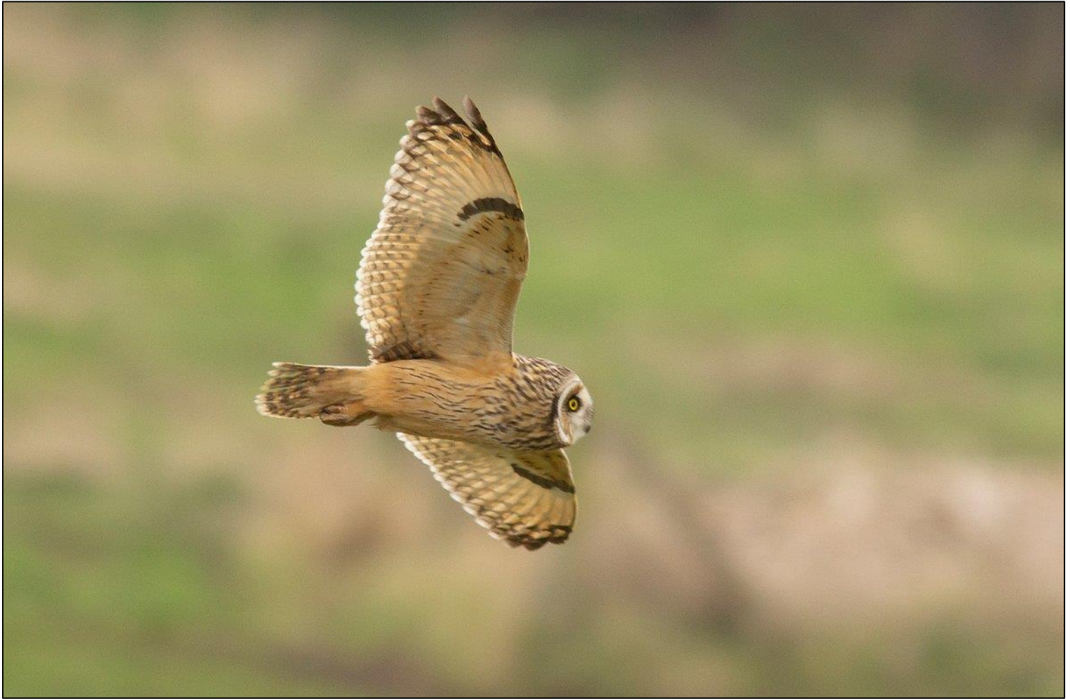
Short-eared Owl along Deeping High Bank - Image © Mike Weedon

Bar-tailed Godwit, Short-eared Owl , Golden Plover, Grey Plover