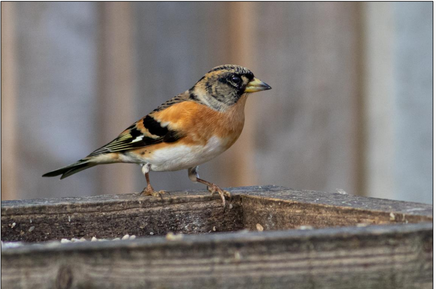
Brambling in Grantham

As with Waxwings, the numbers of Bramblings spending the winter in Britain and Ireland can vary, and their distribution is often related to the availability of their preferred food supply – in this case, beech mast and birch and spruce seeds. This winter, a ‘mega flock’ of some four million Brambling was seen in Switzerland ( https://www.birdguides.com/news/brambling-mega-flock-wows-crowds-in-switzerland/ ), which could be where some of the Brambling that would have wintered here ended up.