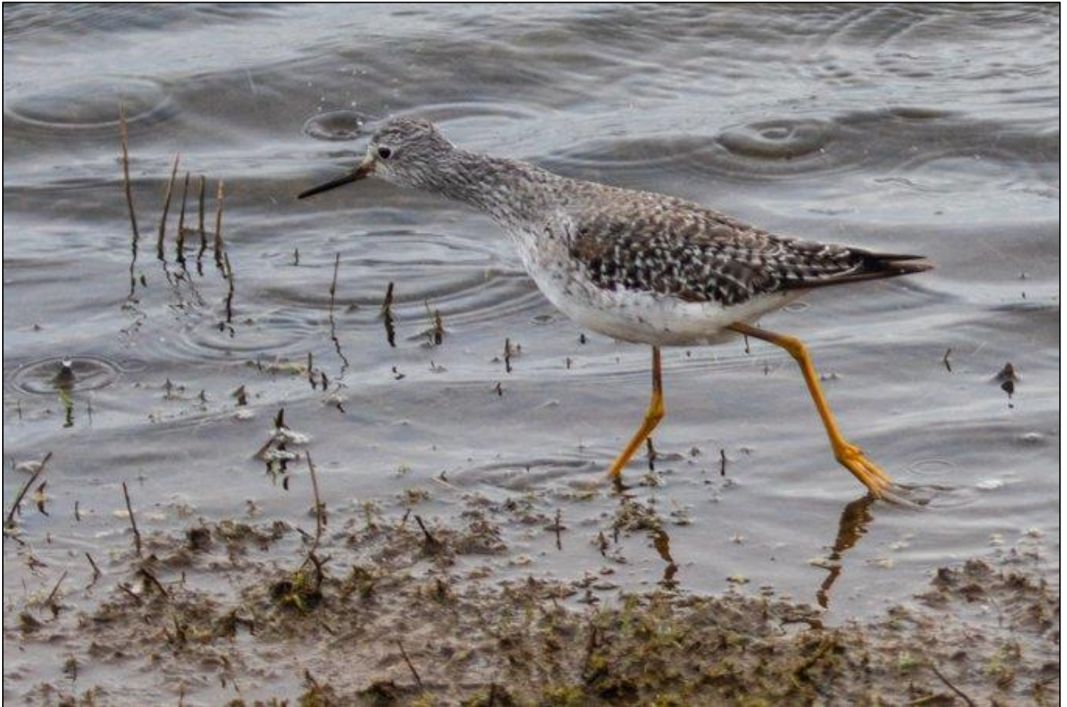
Present for its 178th day the Lesser Yellowlegs at Frampton Marsh

300 Avocet, 200 Dunlin, Peregrine Falcon, Pink-footed Goose, Red Knot, 2 Oystercatcher, 24+ Pintail, 2 Ringed Plover, 2 Cetti's Warbler, c 3500 Wigeon, Lesser Yellowlegs