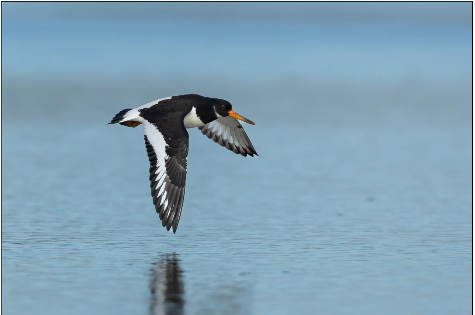
A splendid photo of a Oystercatcher at Donna Nook