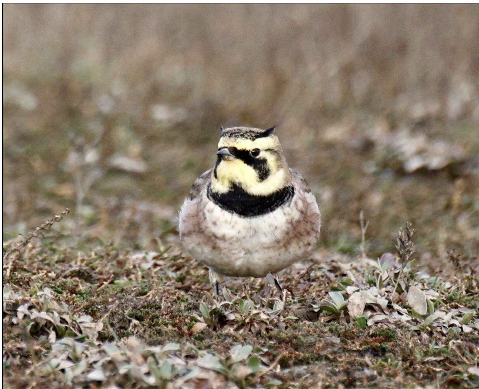
One of the three Shore Lark at Gibraltar Point

4 Corn Bunting, 6 Snow Bunting, Chiffchaff, 2 Long-tailed Duck, 500 Pink-footed Goose, 3 Shore Lark, Treecreeper, Grey Wagtail