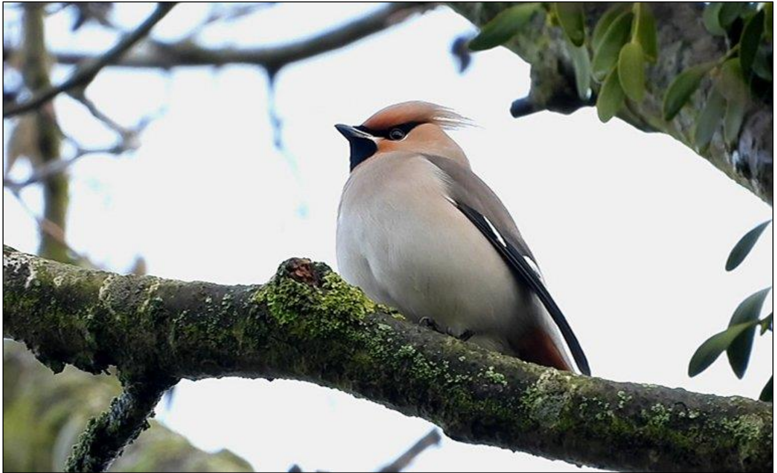
One of the Waxwing present i Barton upon Humber recently

Great White Egret, 164 Pink-footed Goose, Sparrowhawk, 5 Song Thrush