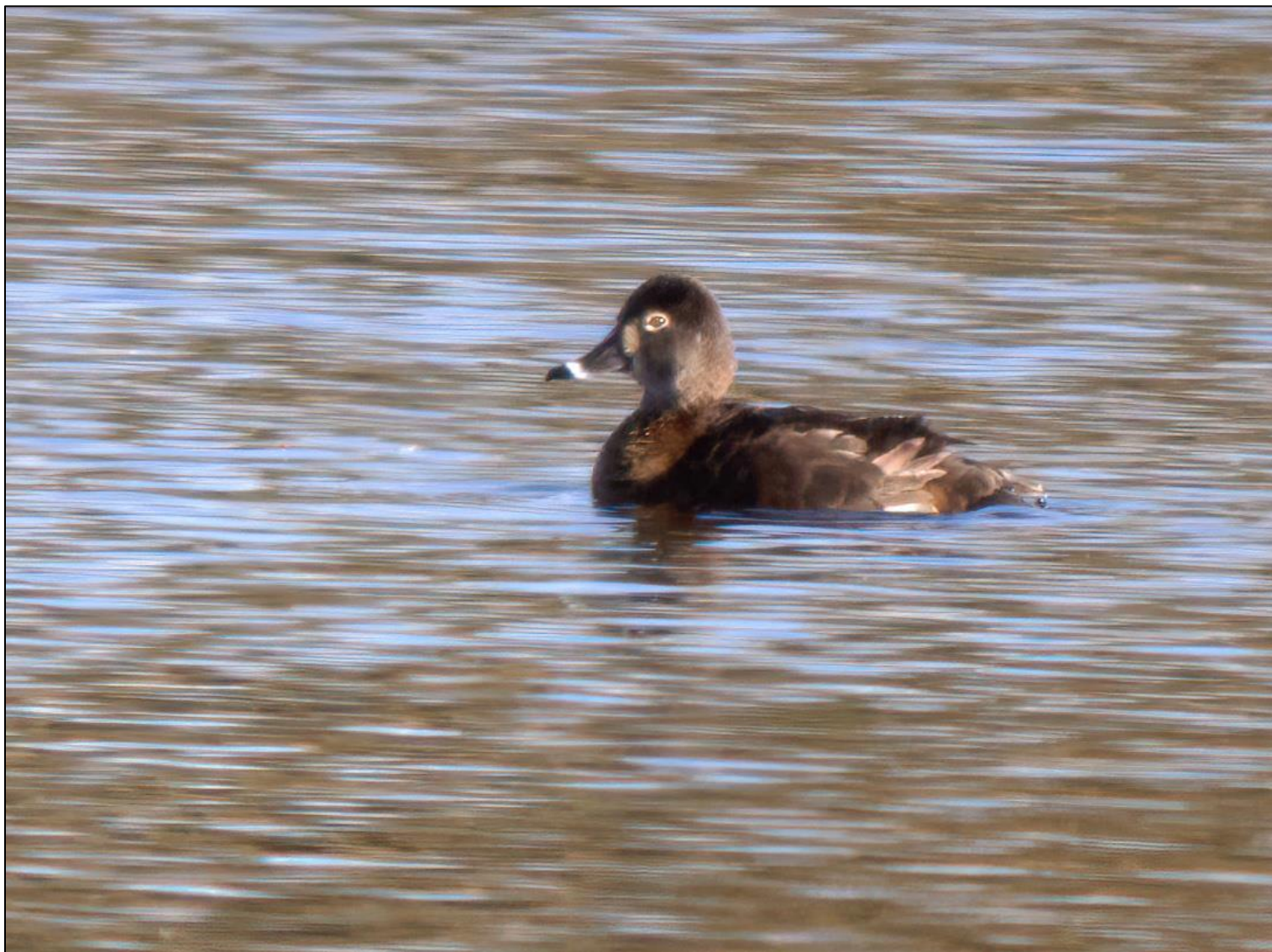
Ring-necked Duck at Messingham - Image © Wayne Gillat