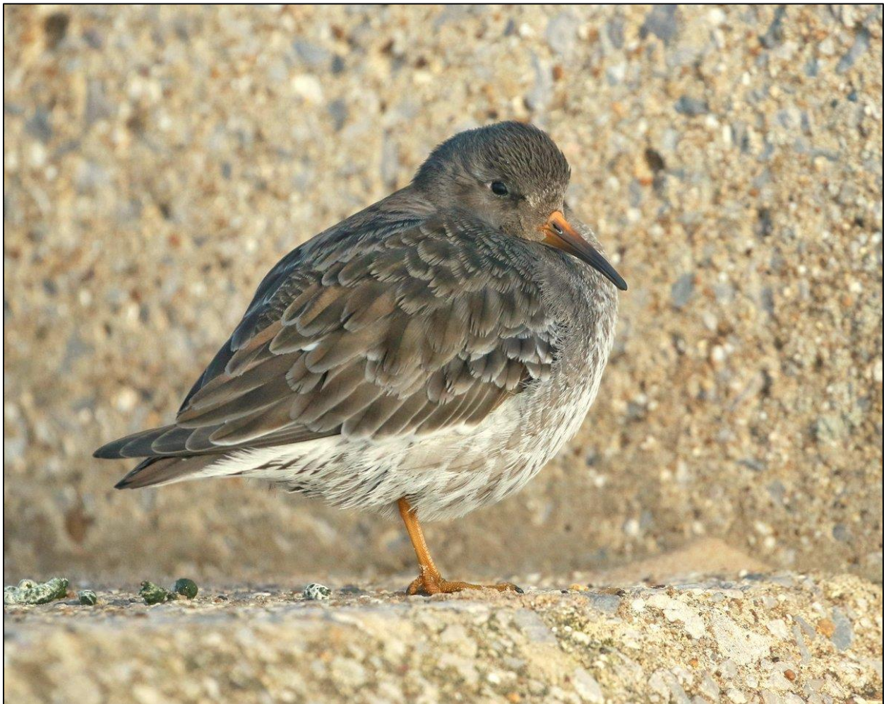
The long staying Purple Sandpiper on Mablethorpe Beach - Image © Owen Beaumont