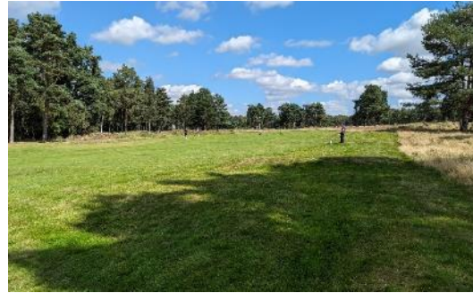
Woodhall Spa Hotchkin Course

Being outside most of the time you start to notice more and you become aware of just how valuable a Golf Course is in terms of adding to the local biodiversity. I was involved in various projects such as putting up Nestboxes and creating wildflower areas. At John o' Gaunt I recorded: