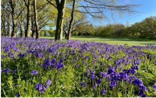
John o' Gaunt G C Bluebells in full bloom