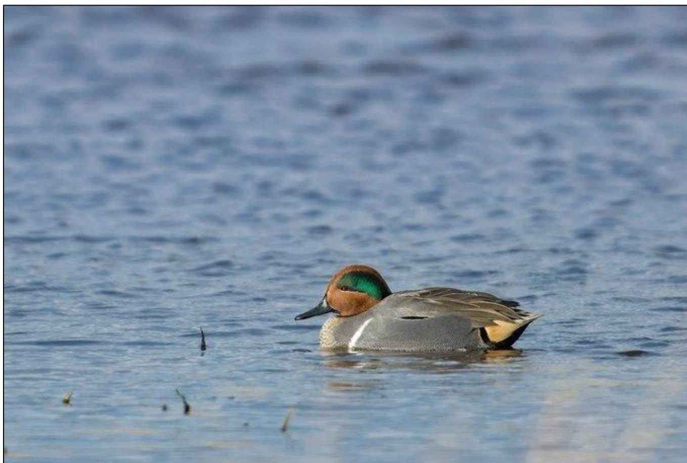
A beautiful shot of the Green-winged Teal at Paradise