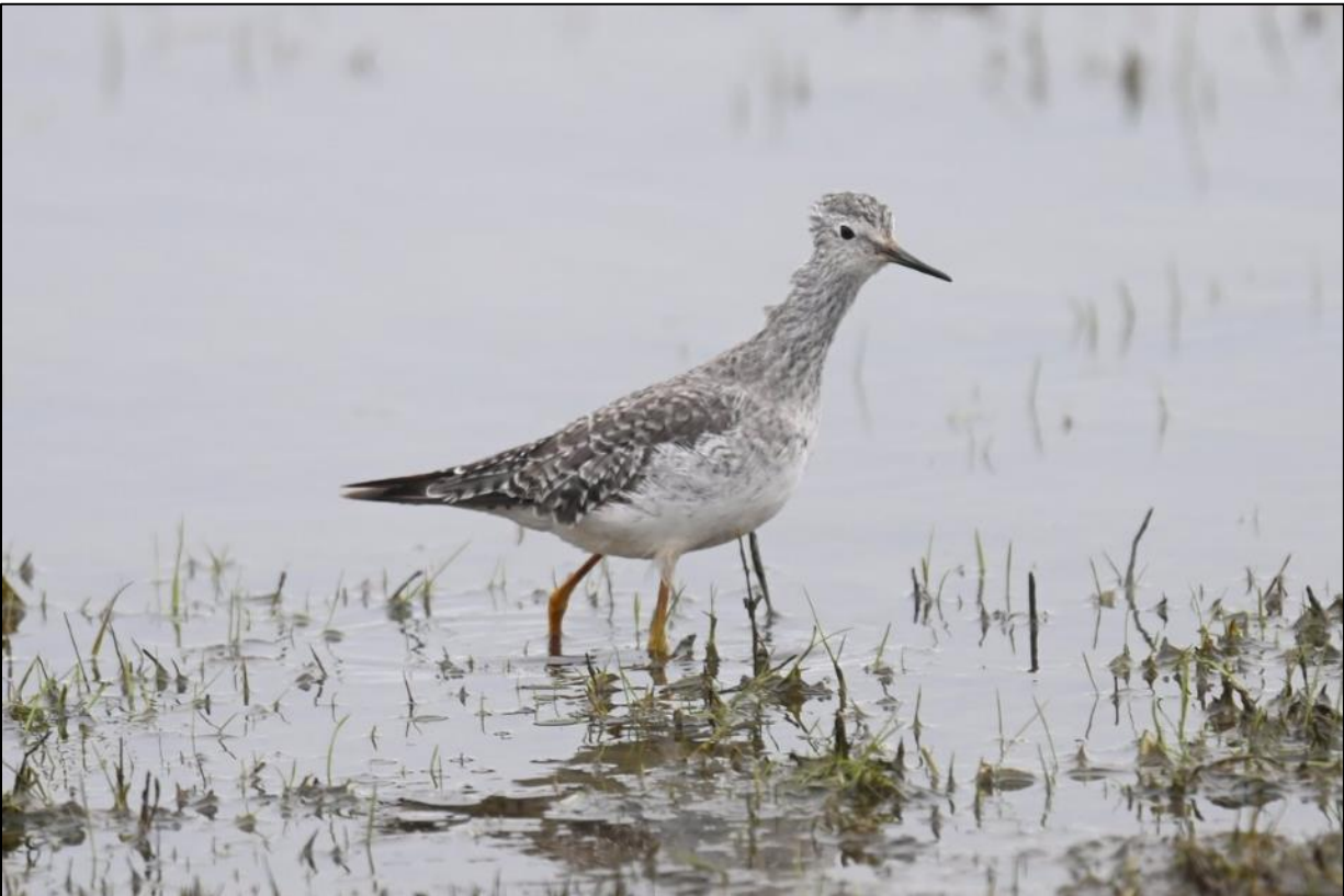
The long staying Lesser Yellowlegs in the car-park at Frampton Marsh

Hen Harrier, Green-winged Teal, Lesser Yellowlegs