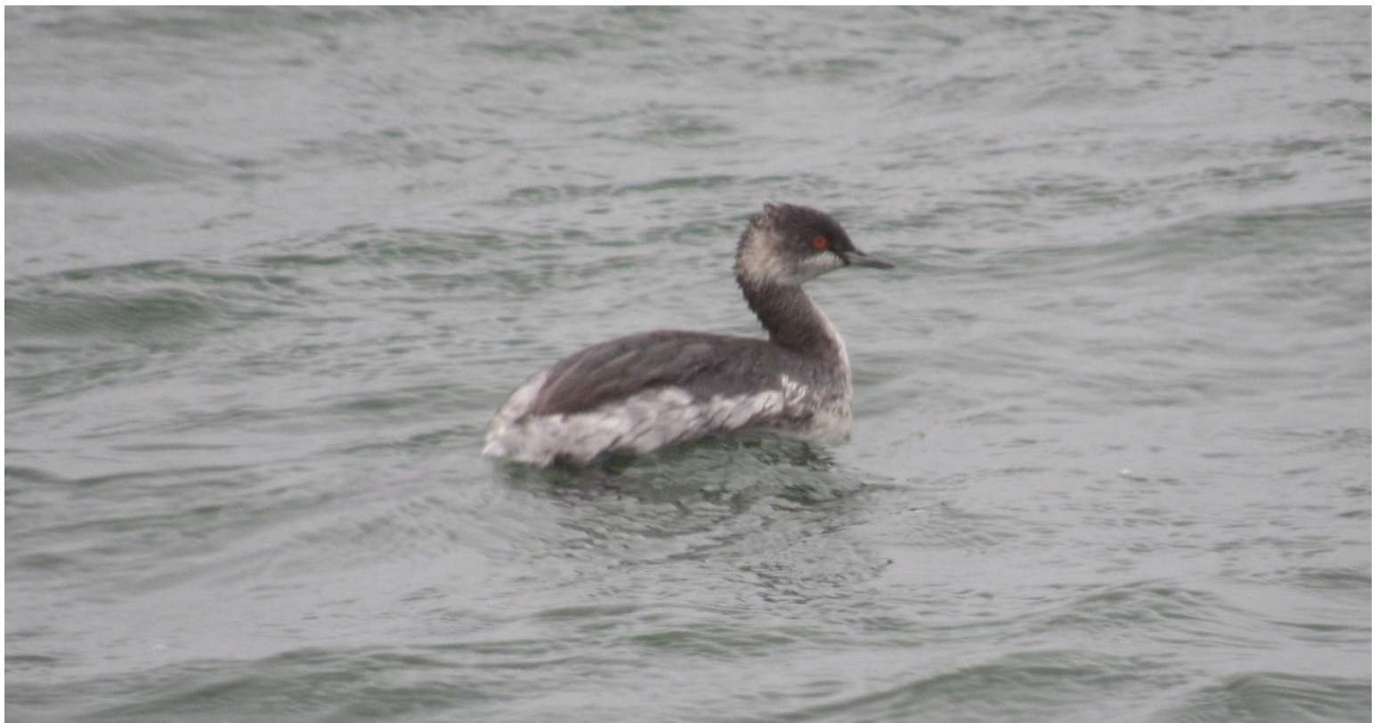
Black-necked Grebe at Covenham Reservoir