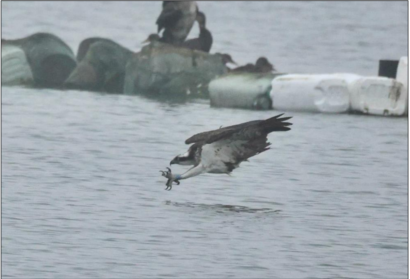
An Osprey at a misty Toft Newton - Image © Russell Hayes

Common Crane, Cattle Egret, Great White Egret