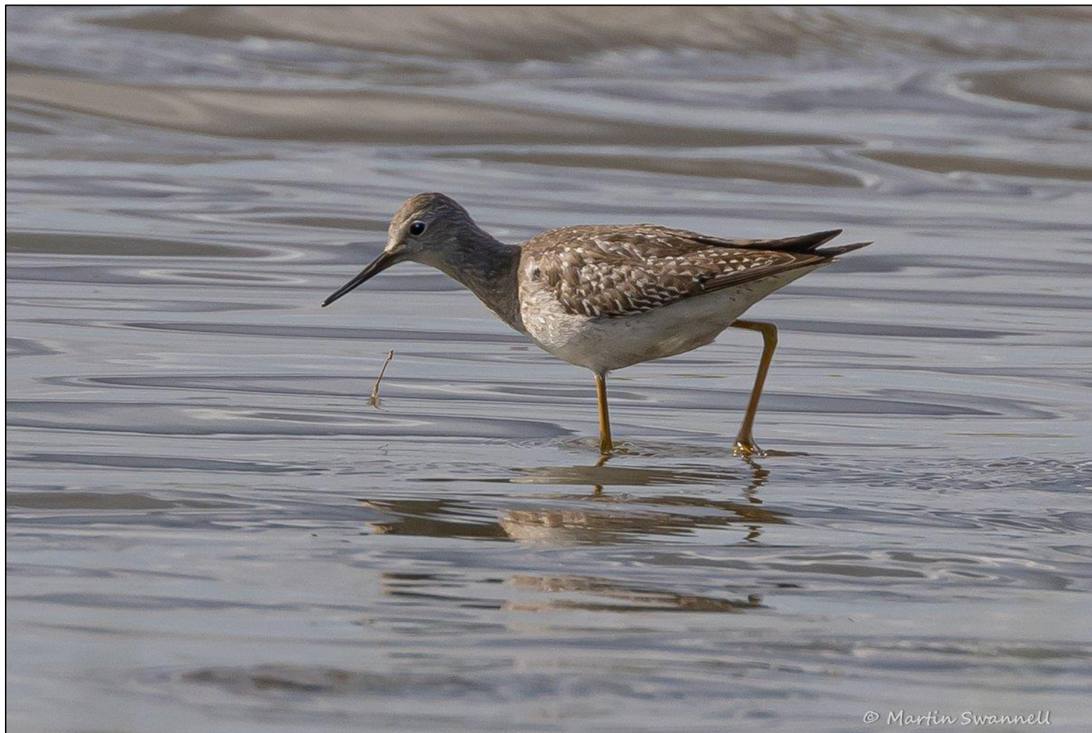
The Lesser Yellowlegs that has been seen at Frampton Marsh