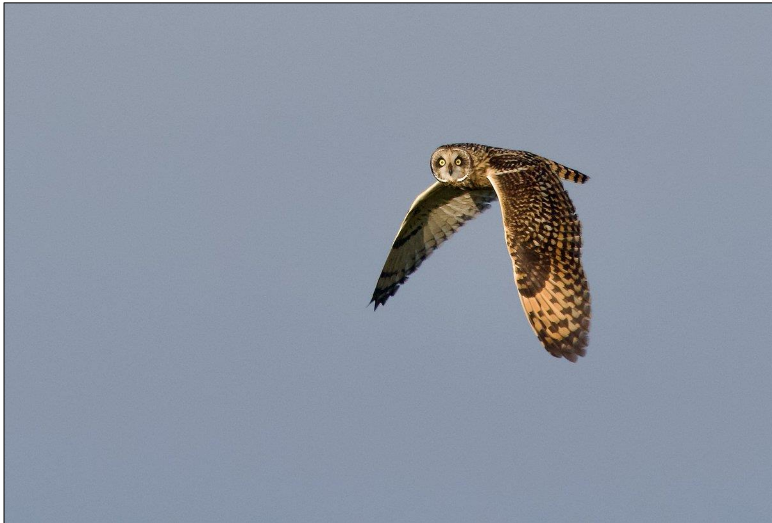
Short-eared Owl at Freiston Shore this morning - Image © Paul Sullivan

Great White Egret, Kingfisher, Short-eared Owl, Arctic Skua