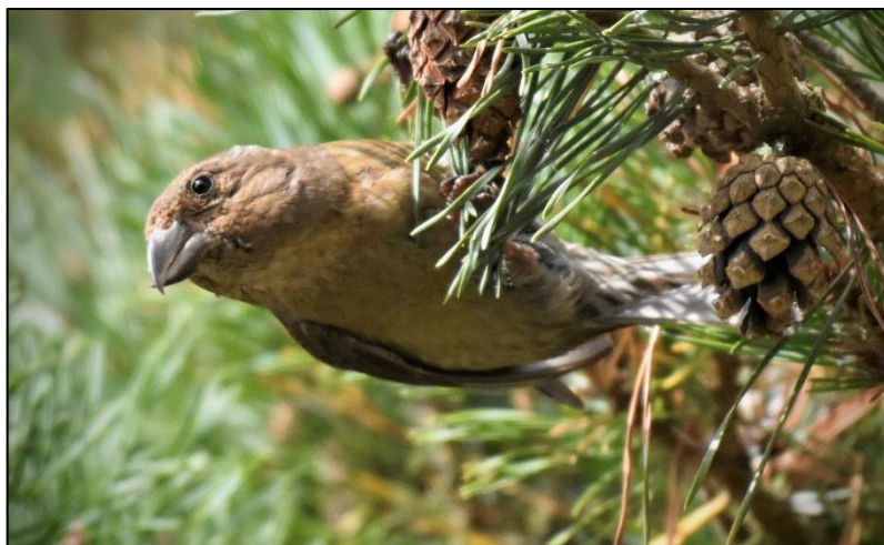
Crossbill at Gibraltar Point - Image © Paul Johnson