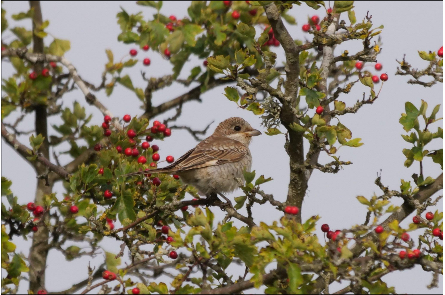
Woodchat Shrike at Gibraltar Point

Great Northern Diver, 4 Little Gull, Woodchat Shrike. Black Tern