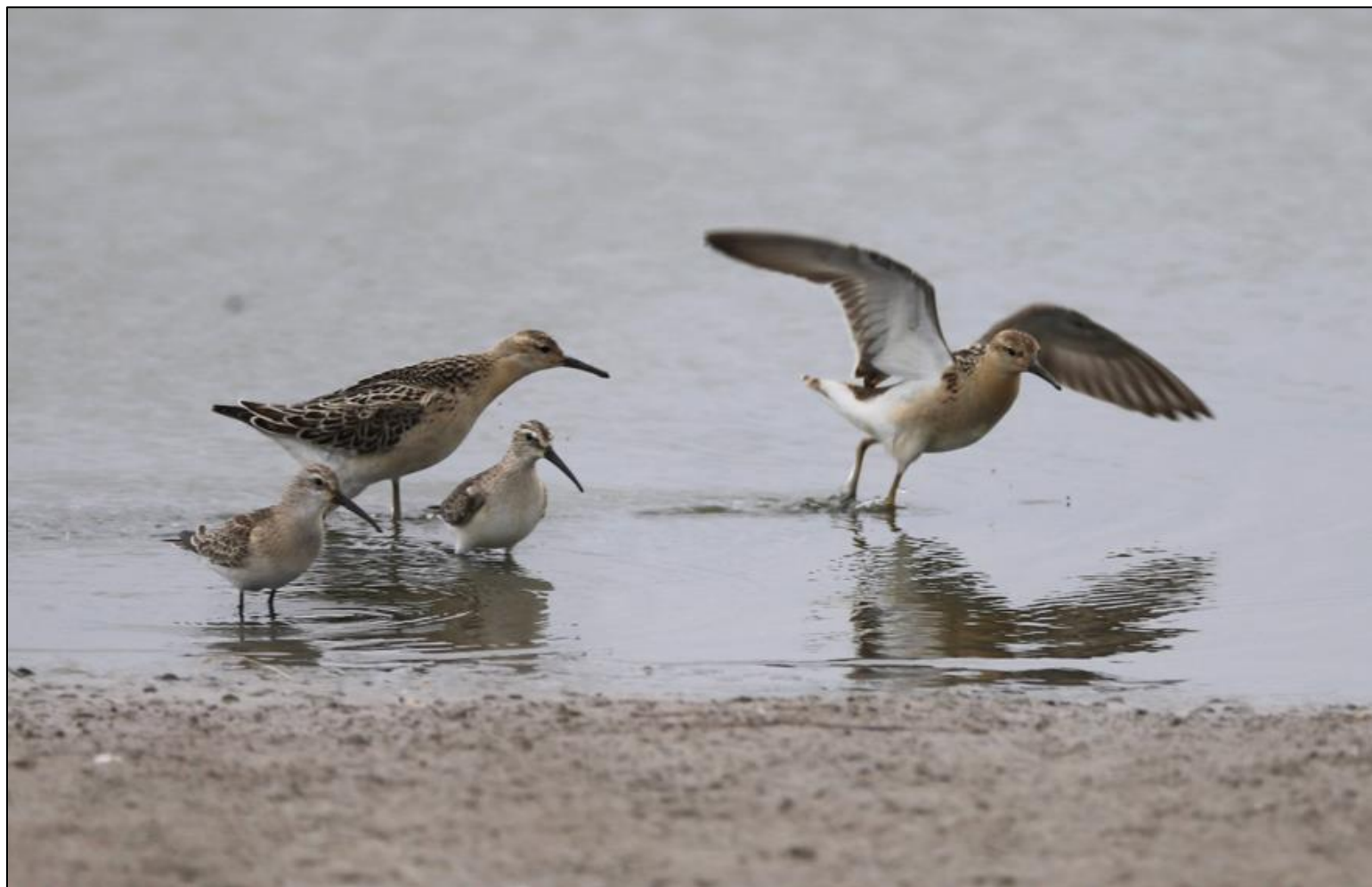
Curlew Sandpipers and Ruff at Frampton Marsh 19 th Sept 2023