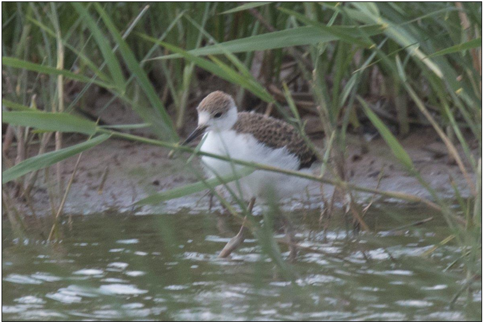
One of the chicks born to the first pair of Black-winged Stilts that raised a brood at Frampton Marsh

c48 Avocet, c52 Black-tailed Godwit, 2 Shelduck, Swift