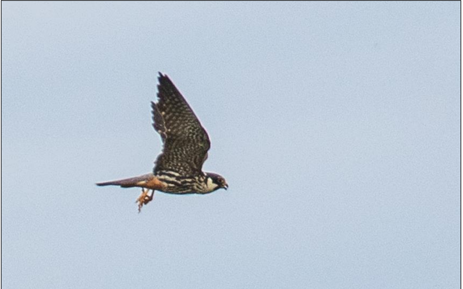
A distant hobby at Messingham (heavily cropped) = Image © Chris Grimshaw

c3 Hobby, 100+ Lapwing, House Martin, Sand Martin, Swallow, Redshank, 2 Ruff, 3 Green Sandpiper