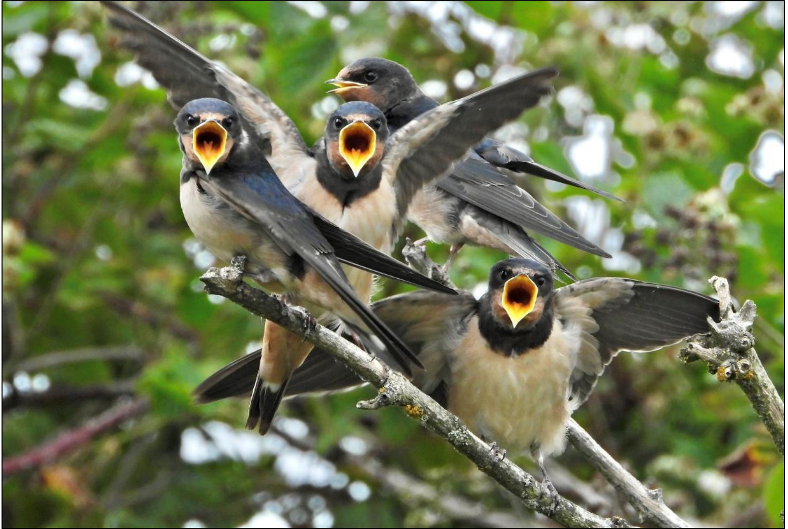
Young Swallow awaiting food, Swanpool cow-fields