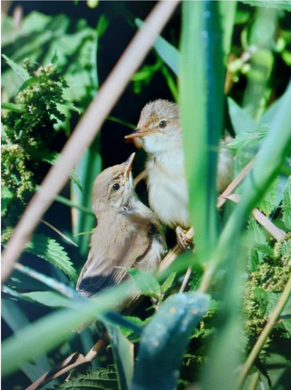
Marsh Warblers on the Lincs Coast

.....hopefully we will have a full account in a future newsletter!