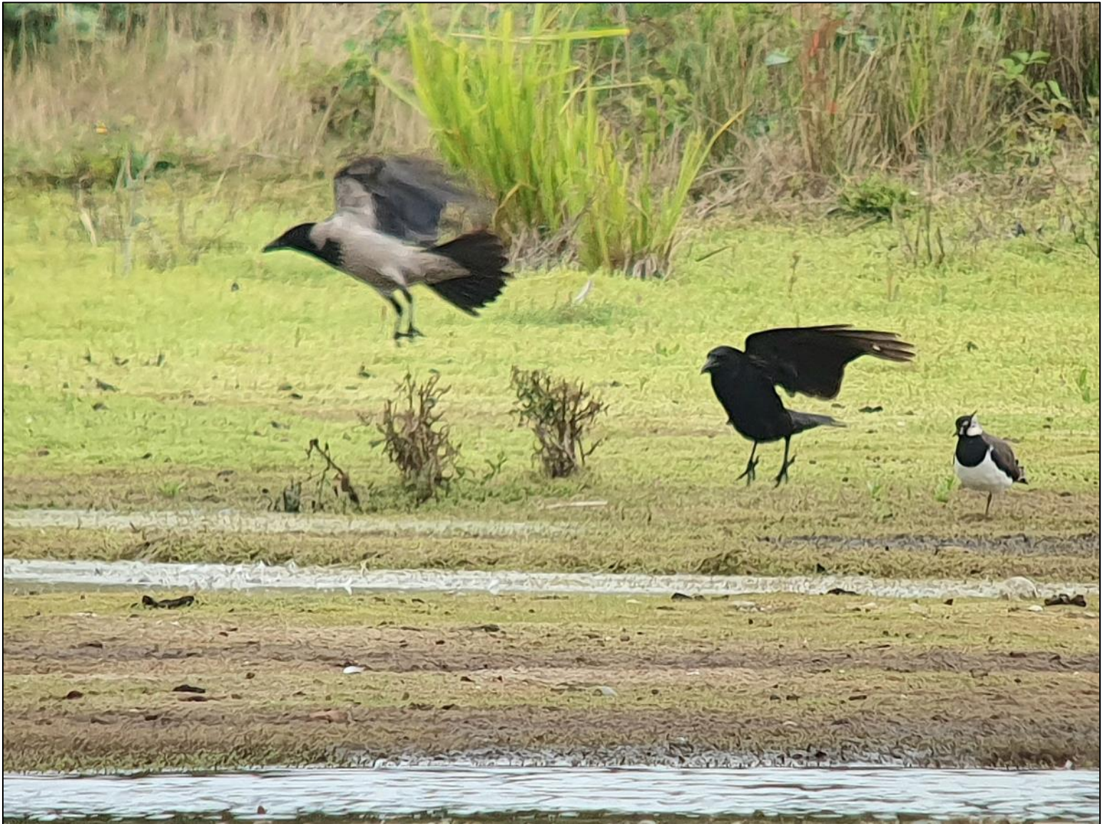
Hooded Crow that was briefly present on Teal Lake