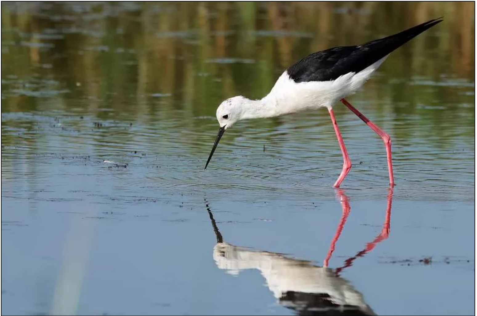
Black-winged Stilt at Frampton Marsh

Corn Bunting, Great White Egret, 16 Greenshank, 3 Red Knot, 10 Black-winged Stilt, Whimbrel