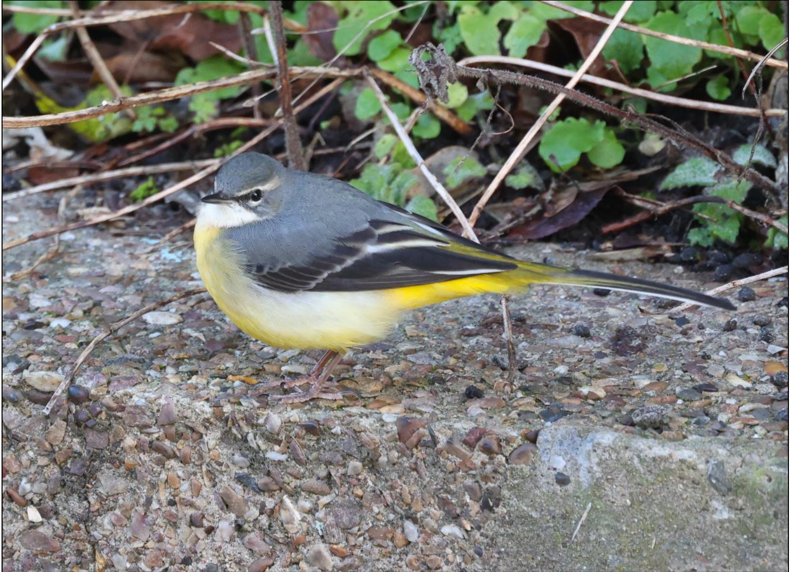
A Grey Wagtail adjacent to the Louth Canal - Image © John Clarkson