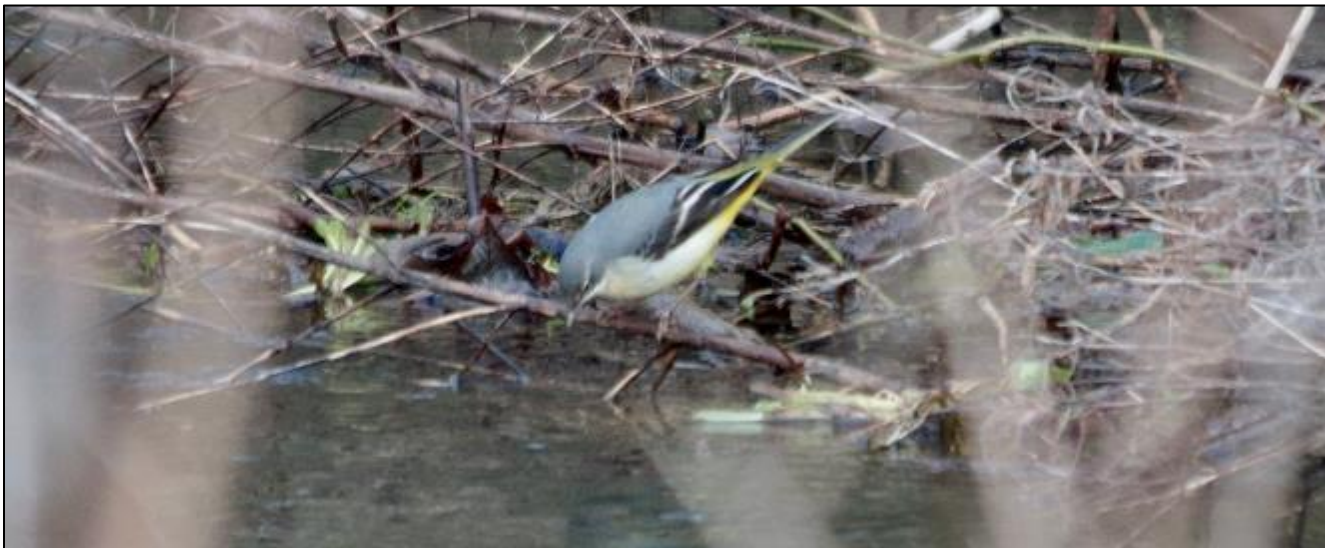
A Grey Wagtail in the Beck in Branson - Image © TheOtherJanet