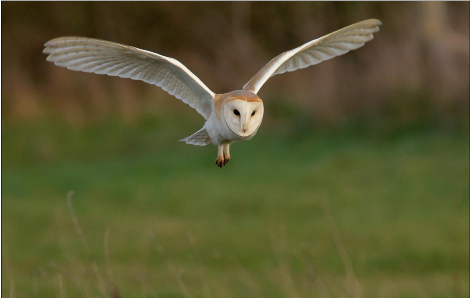
A splendid shot of a Barn Owl near Baston - Image © Mike Weedon