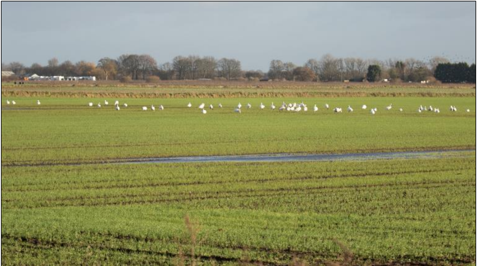
Around 53, Winter Swans, Bewick's, c10 and Whooper c43 at Sanderson's Bank, Westwoodside

c10 Bewick's Swan, 43 Whooper Swan, Pink-footed Goose