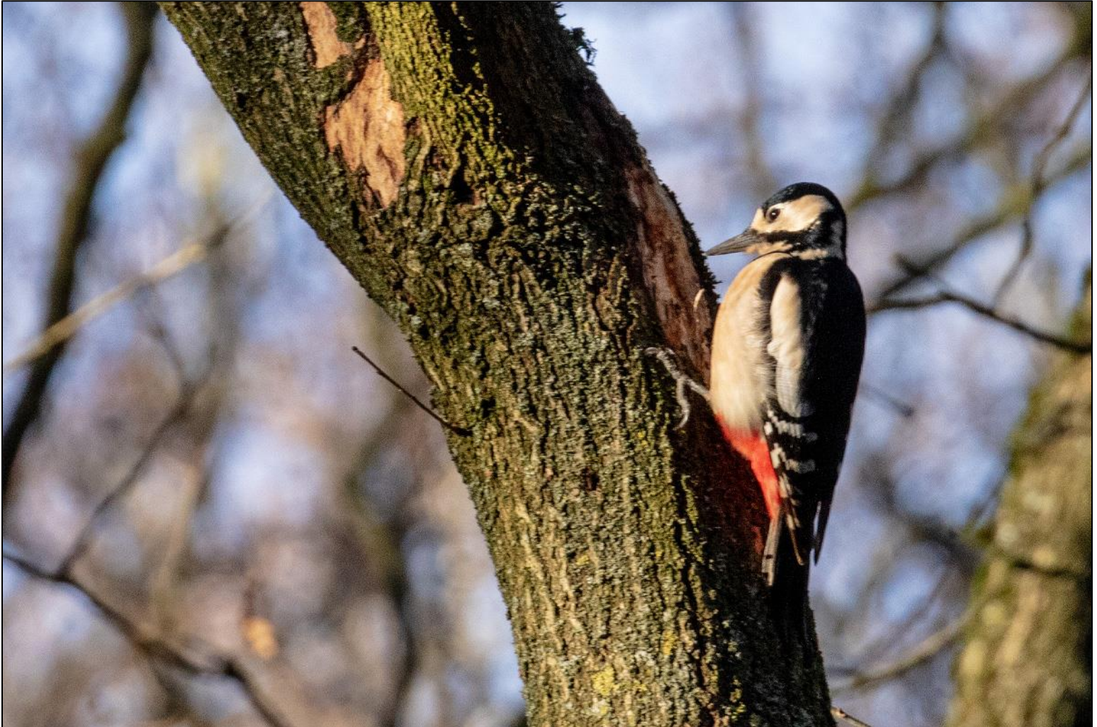
A Great Spotted Woodpecker on the edge of Swanholme Lakes

Goldcrest, 7 Goosander, 4 Great Spotted Woodpecker, 6 Grey Heron, 2 Kingfisher, Nuthatch, 6 Shoveler, 25 Siskin, Treecreeper