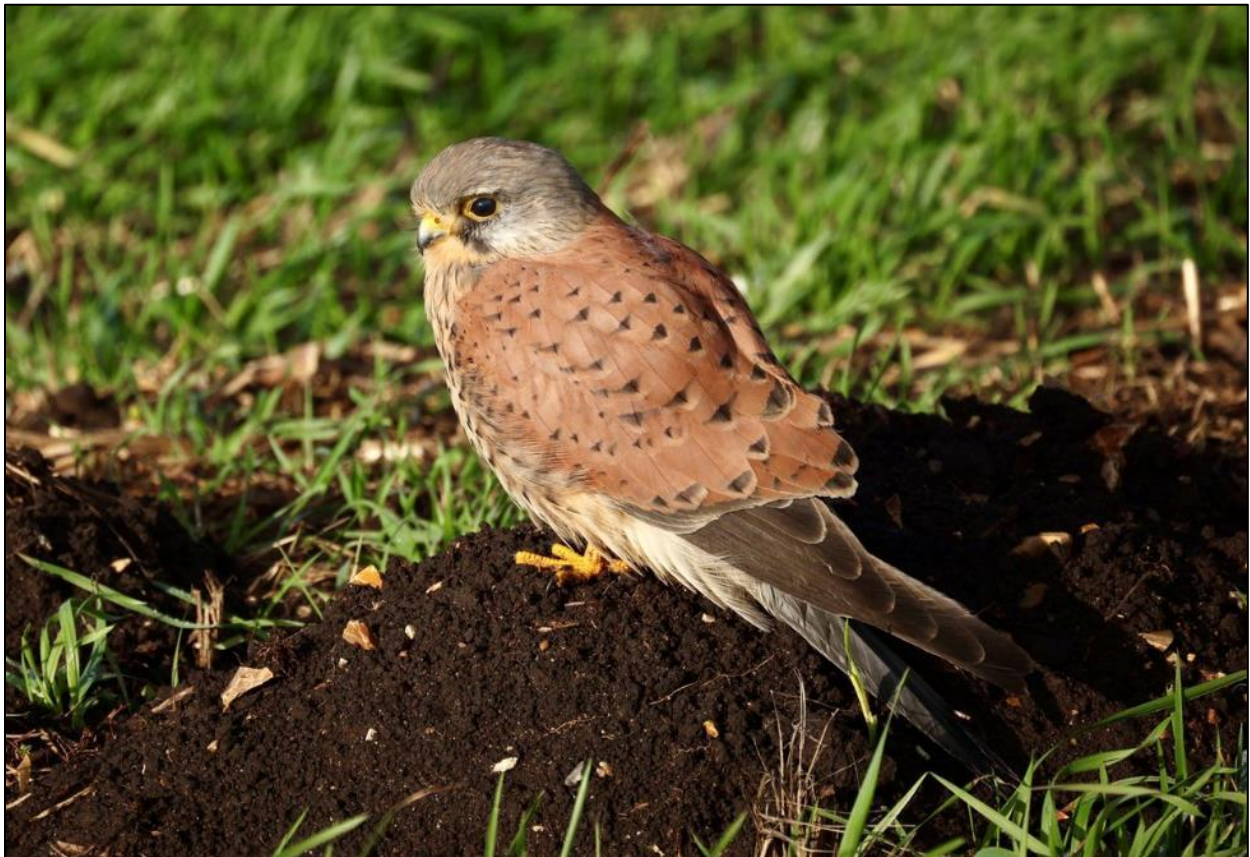
A Kestrel at Short Ferry