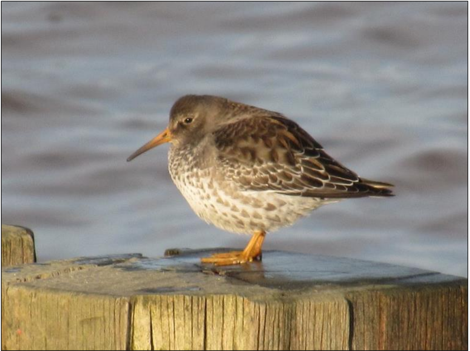
An attractive shot of Cleethorpes Purple Sandpiper

6 Russian White-fronted Geese, 8 Bewick' Swan