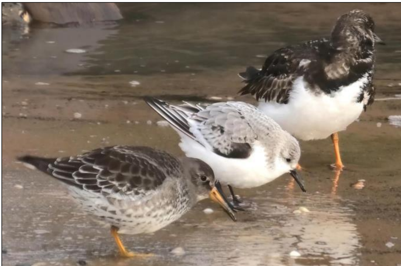
Purple Sandpiper on the beach at Cleethorpes