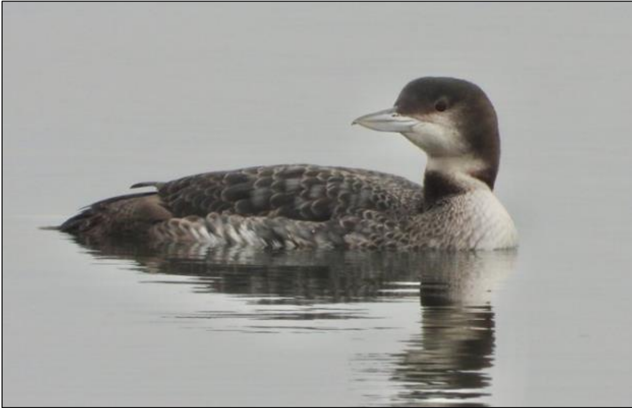
The Great Northern Diver at Covenham Reservoir

Brambling, Hen Harrier, Marsh Harrier, Merlin, 6 Pintail, Water Rail, Whooper Swan