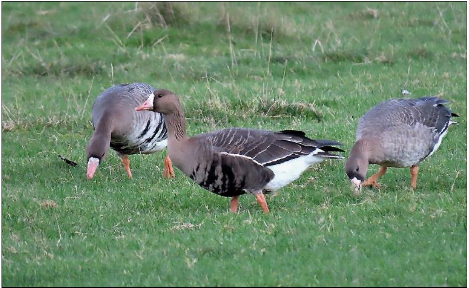
A good close up of the Russian White-fronted Geese that have frequented East Halton for a while