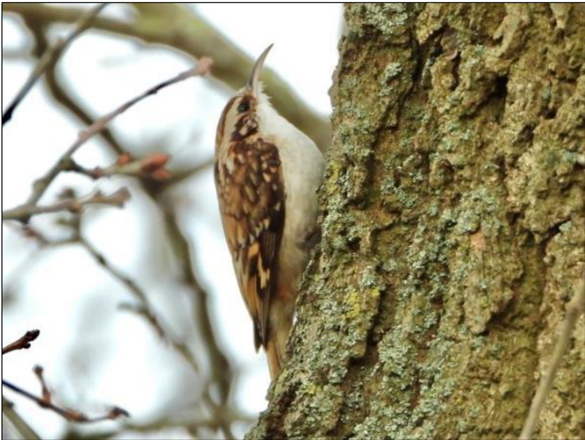
Treecreeper in the Swanpool cow-fields area - Image © Andy Sims