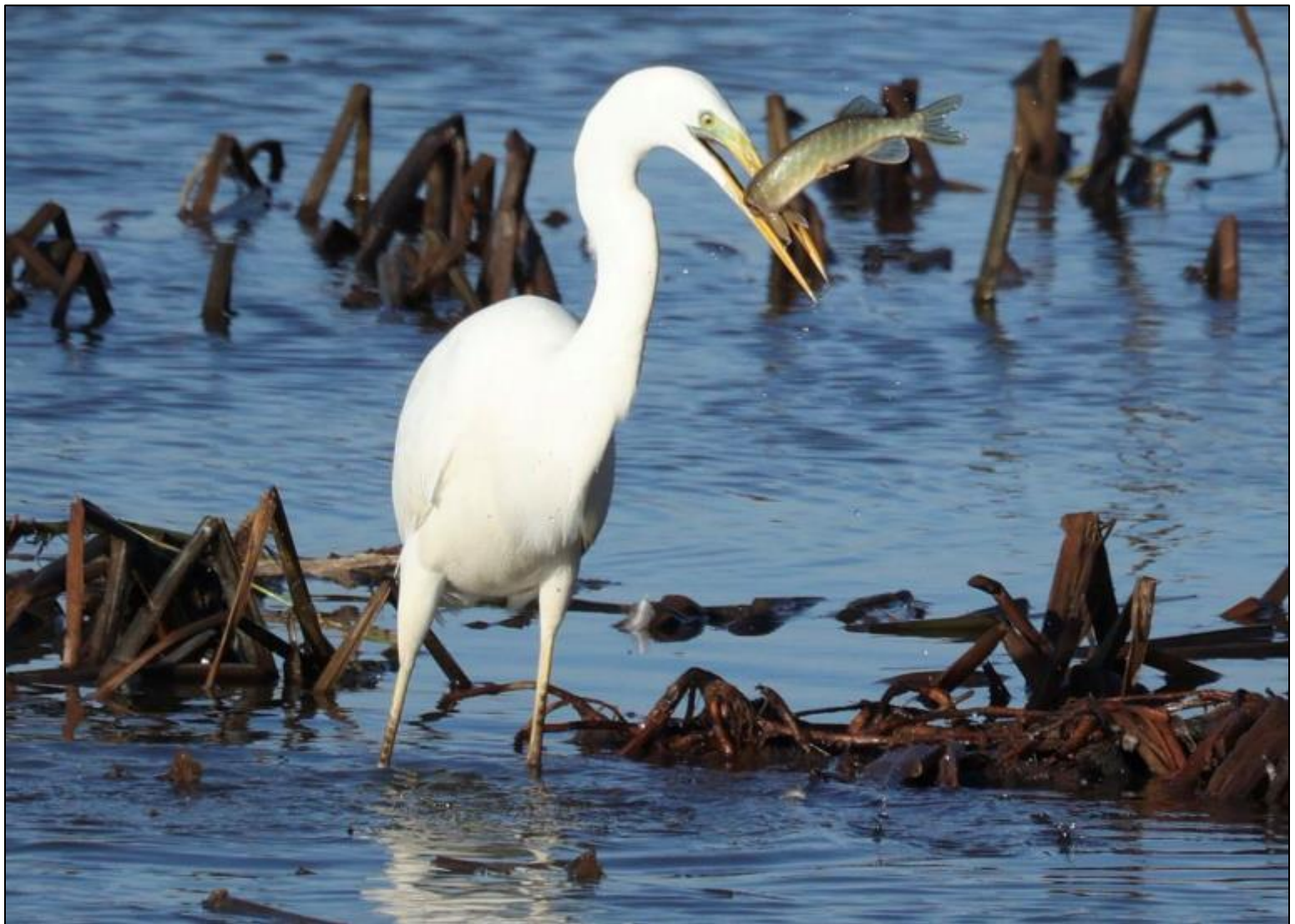
Great White Egret feeding well