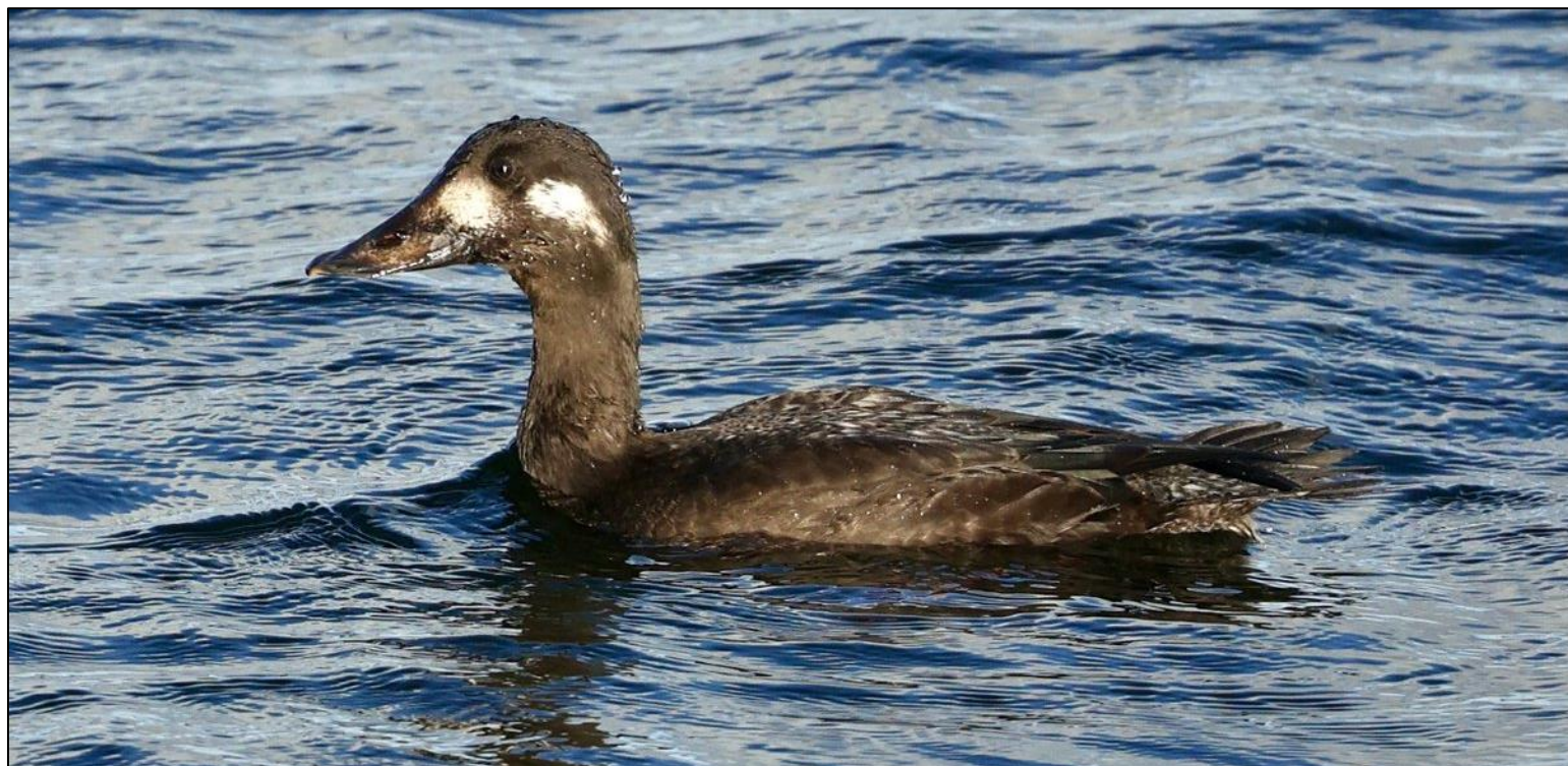
Velvet Scoter at Covenham Reservoir