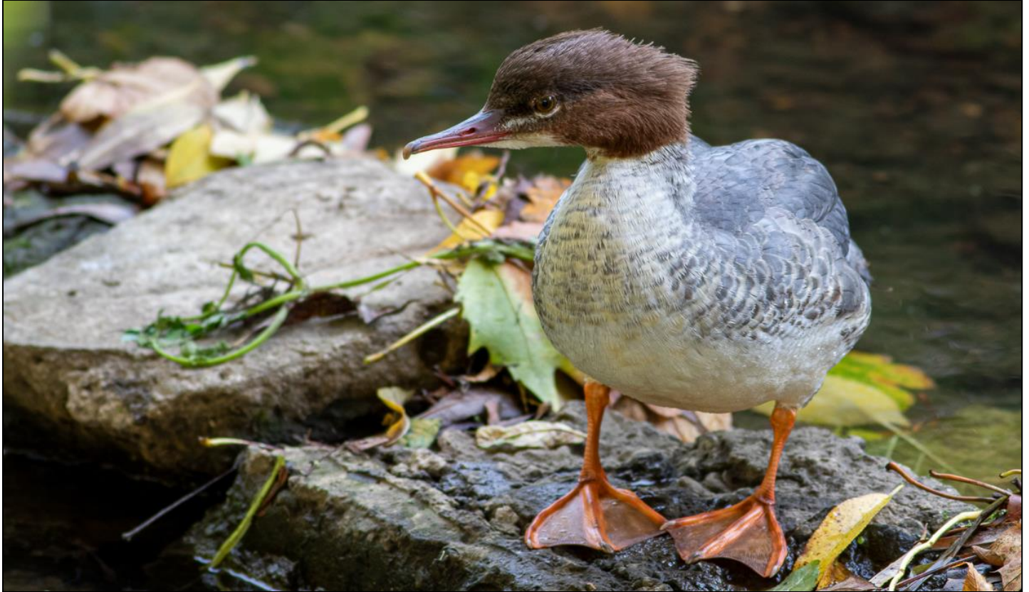
Goosander in Queen Elizabeth Park, Grantham