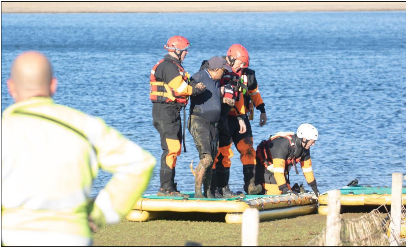
The man after I got out of the mud. He had to endure another 30 minutes before he was rescued...