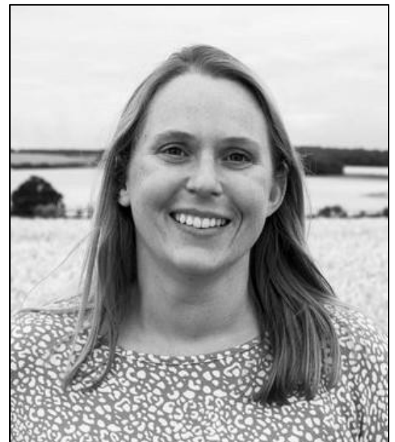
definitely no pop concerts!

Inserted photos: from the online Savills sales brochure.