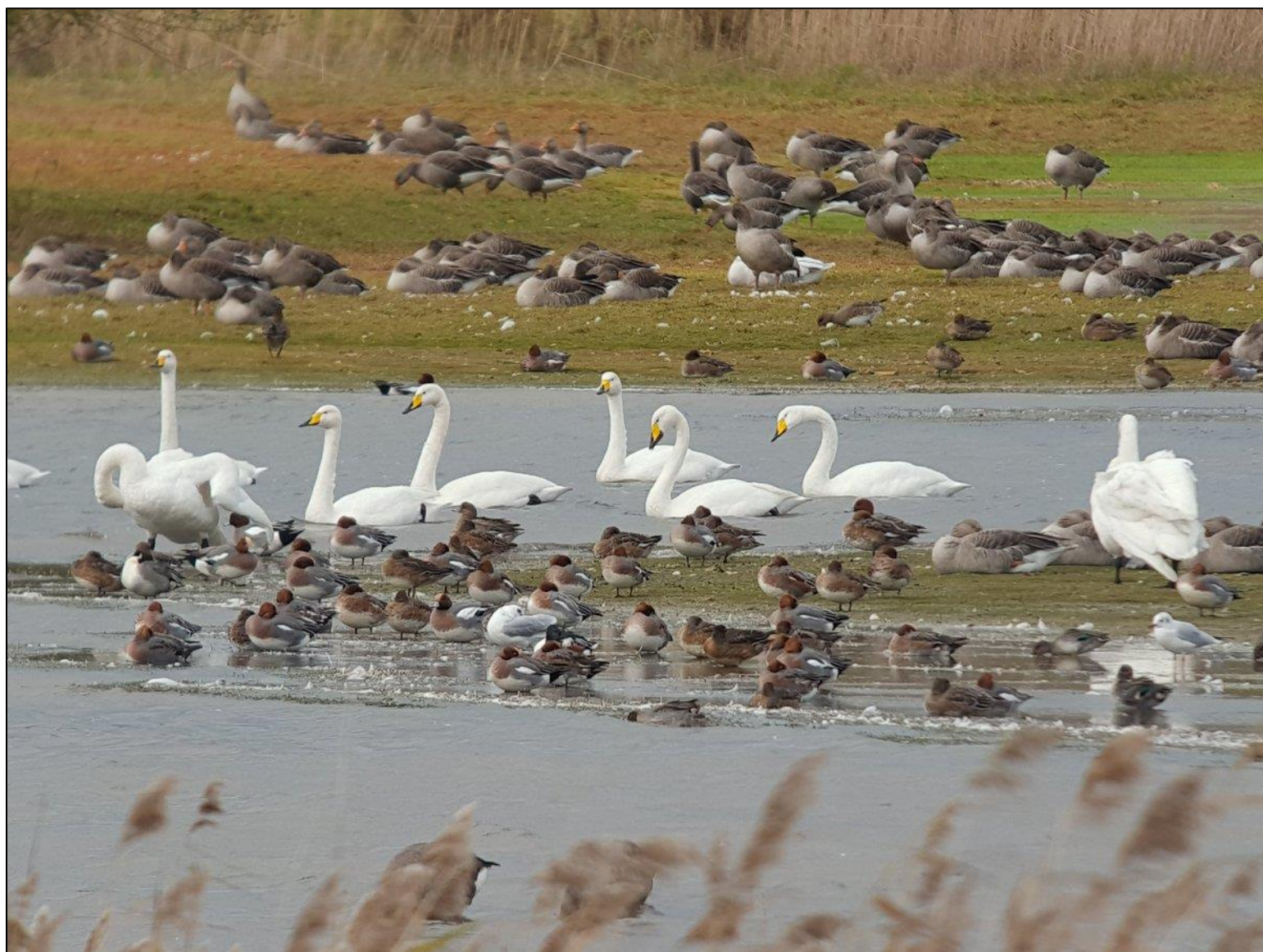
Owt about? RAF Woodhall Spa