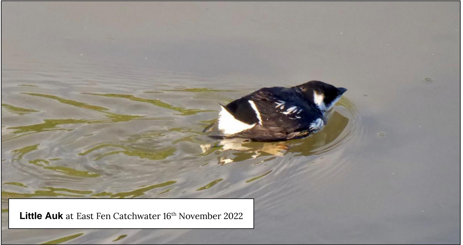
Little Auk at East Fen Catchwater 16 th November 2022