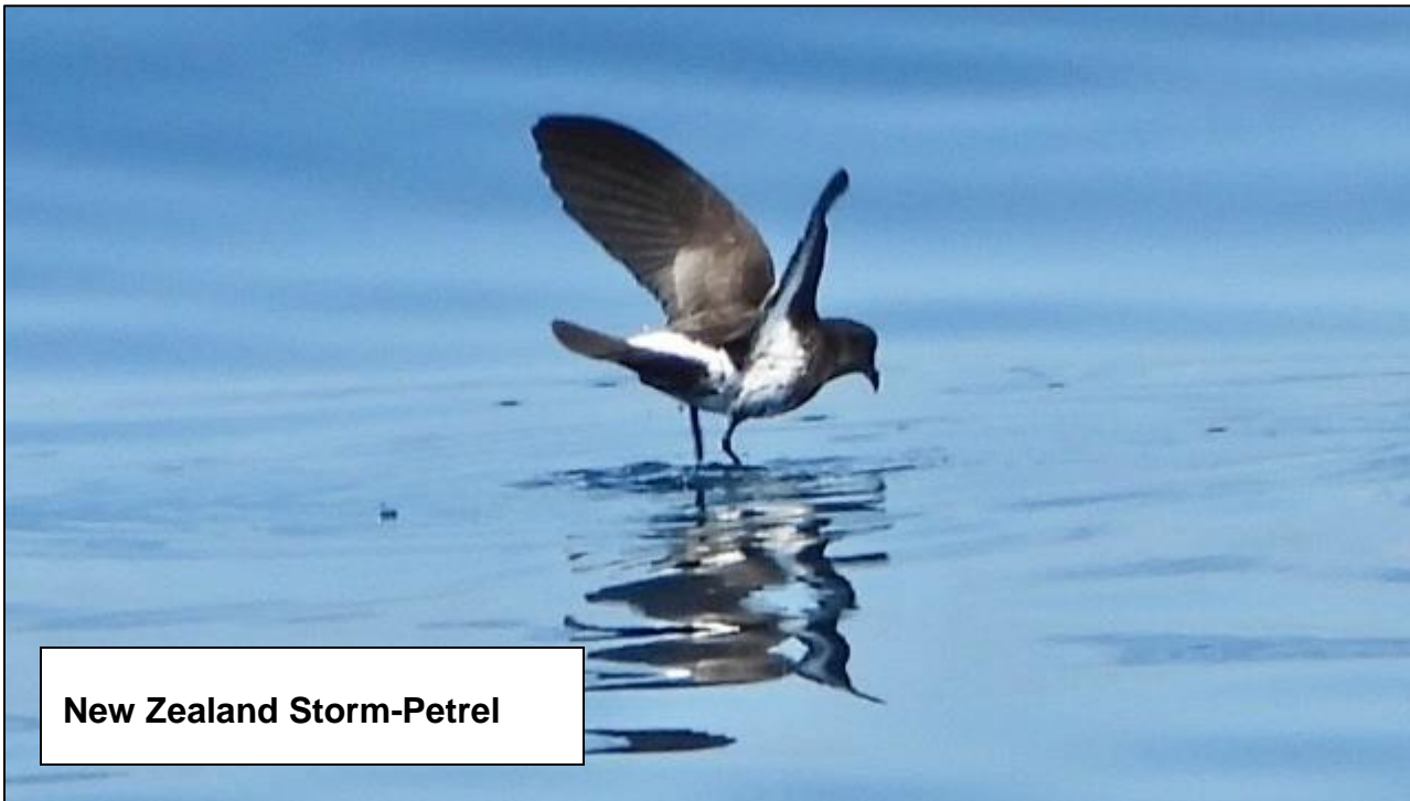
New Zealand Storm-Petrel