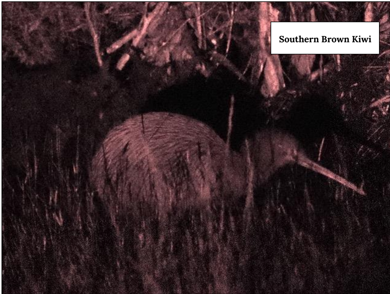
Southern Brown Kiwi