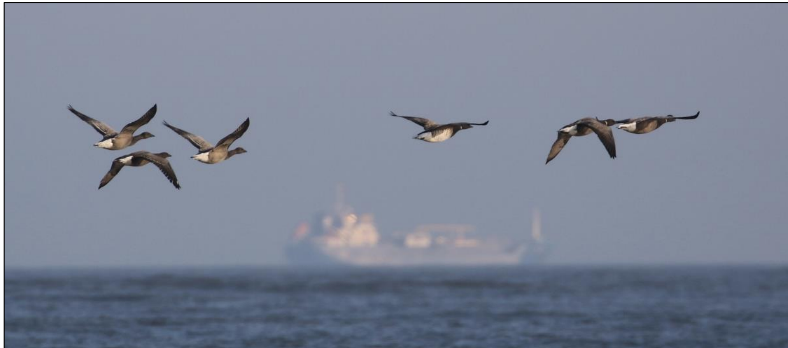
Dark and Pale-bellied Brent Geese, NE Mablethorpe

Red-throated Diver, 40 Eider, 6 Dark-bellied Brent Goose, 1 Dark-bellied Brent Goose, 60 Linnet, Red-breasted Merganser, 120 Cannon Scoter