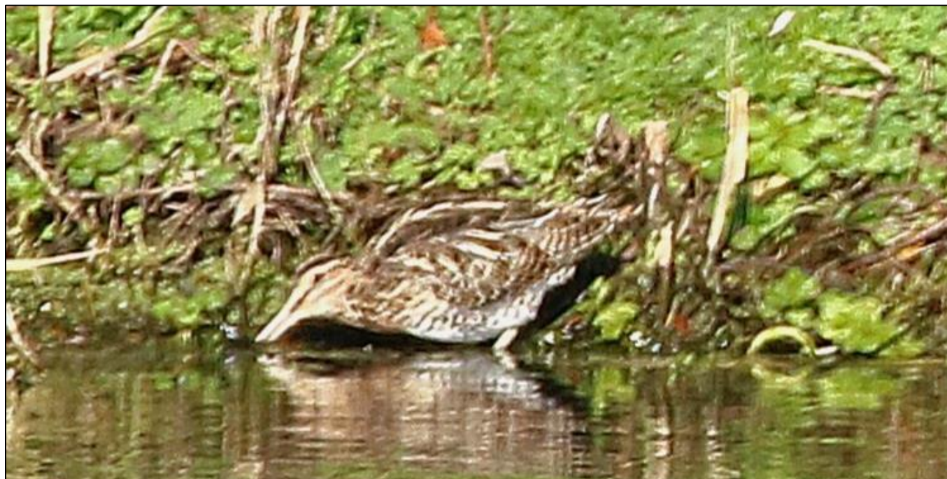
Jack Snipe at Marston