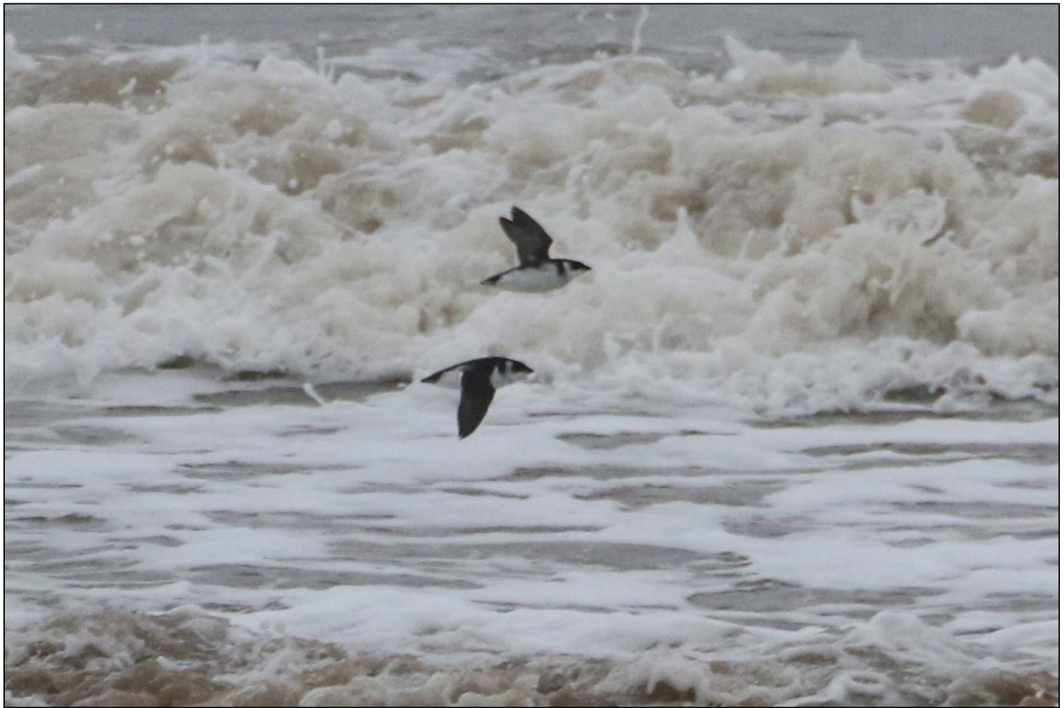
Little Auks off Mablethorpe