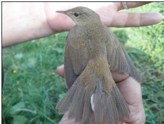
Juvenile Reed Warbler

Photos showing the dark centres to feathers, particularly the tertials