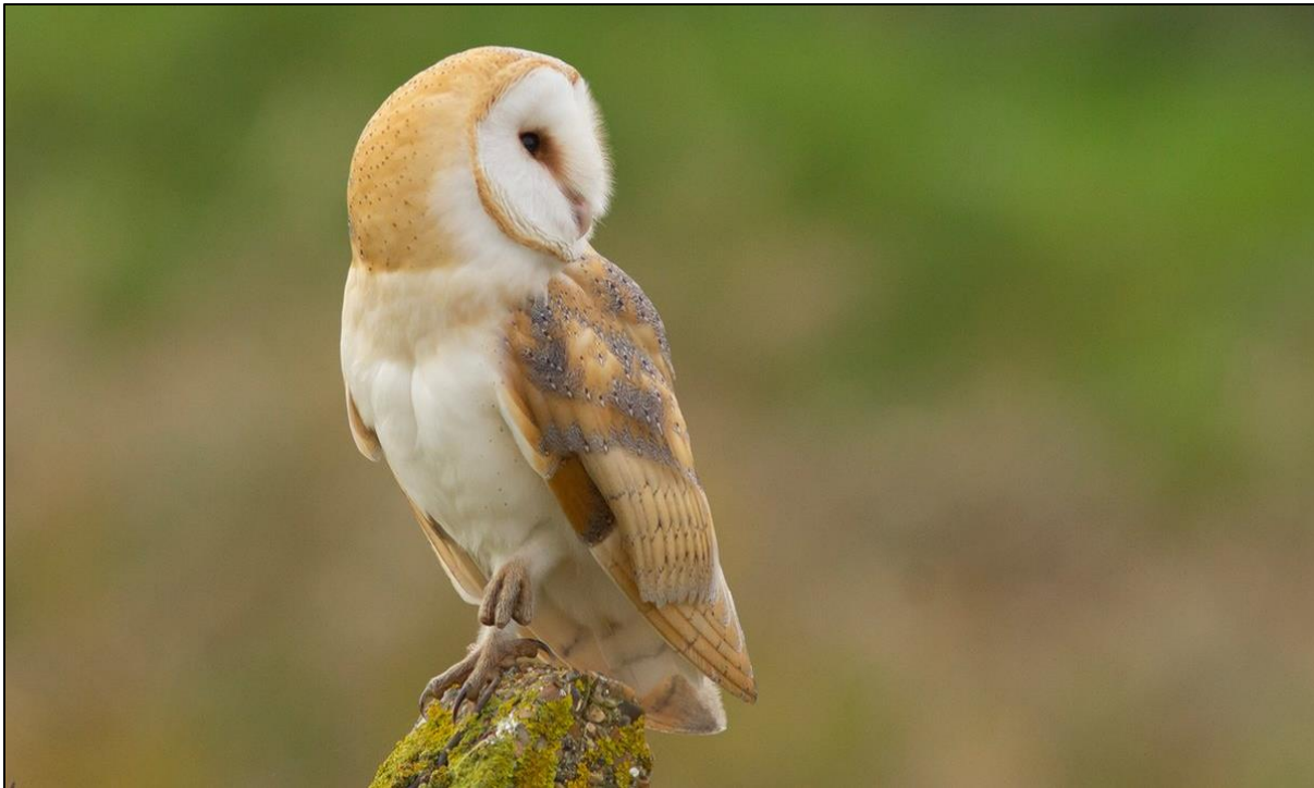
Barn Owl on the Welland near Crowland