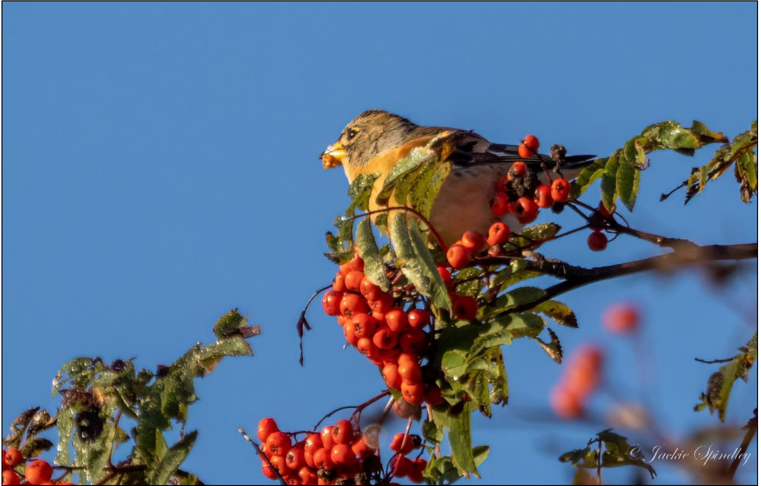
Brambling at Whisby