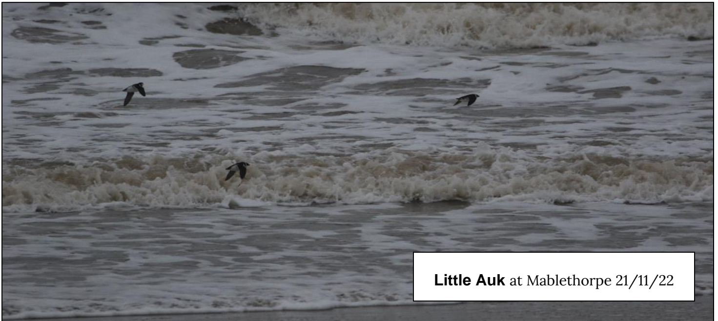
Little Auk at Mablethorpe 21/11/22

These three birds were photographed on 21st November 2022 flying south at Mablethorpe by Andrew Chick