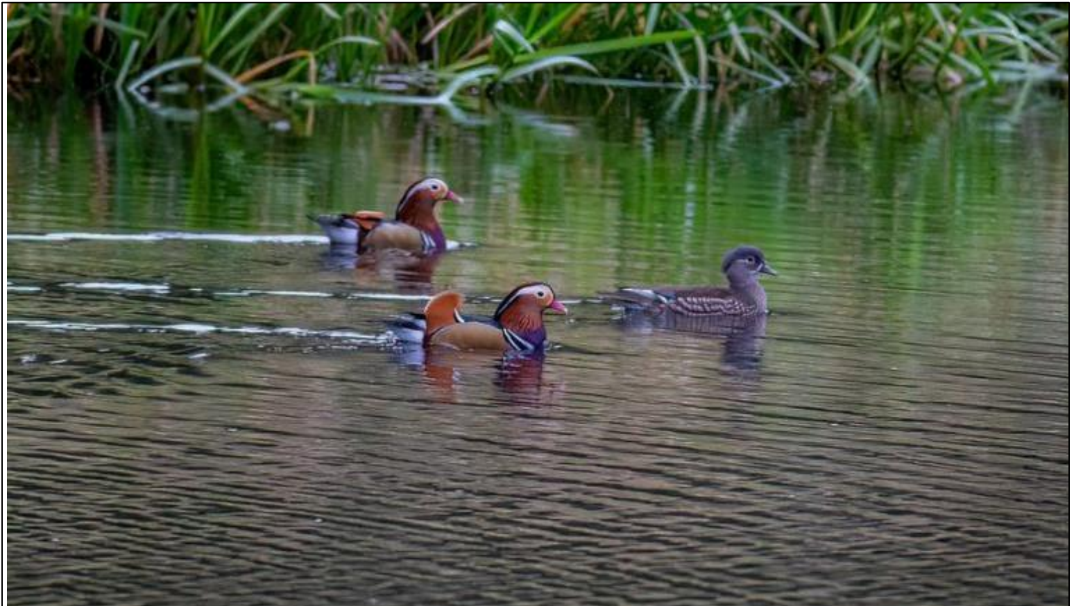
Mandarin Ducks at the Towthorpe Lakes on the Belton Estate