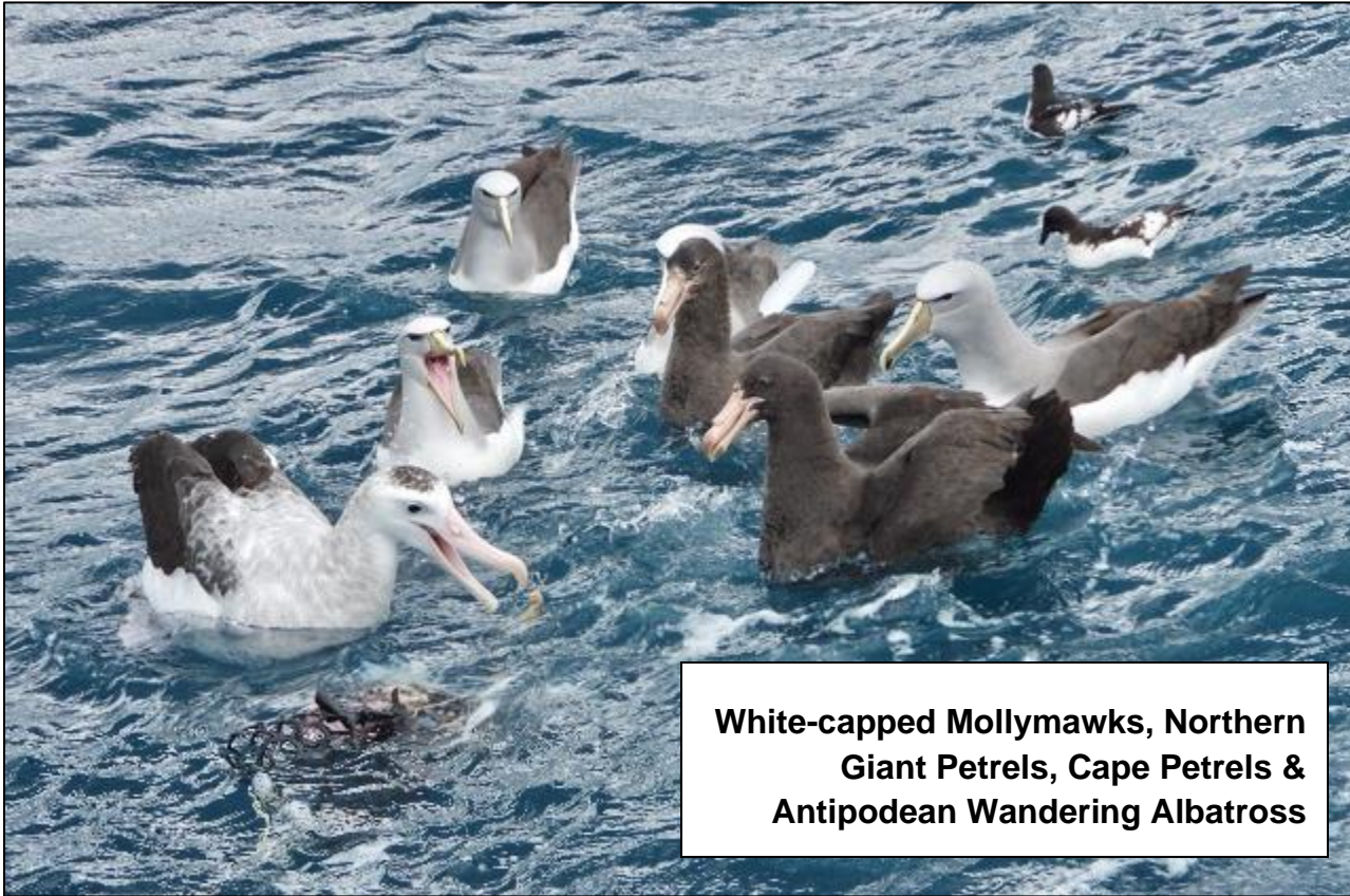
White-capped Mollymawks, Northern Giant Petrels, Cape Petrels & Antipodean Wandering Albatross