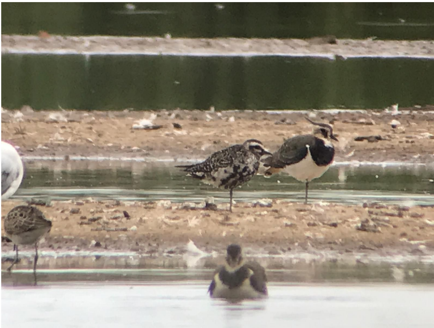
American Golden Plover at Frampton Marsh - Image © John Badley

Garganey, 2 Egyptian Goose, 10 Pink-footed Goose, 5 Greenshank, Merlin, Short-eared Owl, Water Rail, 12 Spotted Redshank, 28 Pintail, American Golden Plover (moulting adult on the reedbed), 15 Golden Plover, Curlew Sandpiper, (belated report of a Pectoral Sandpiper on twitter), 2 Spoonbill, 5 Yellow Wagtail, Cettis's Warbler, Wheatear,