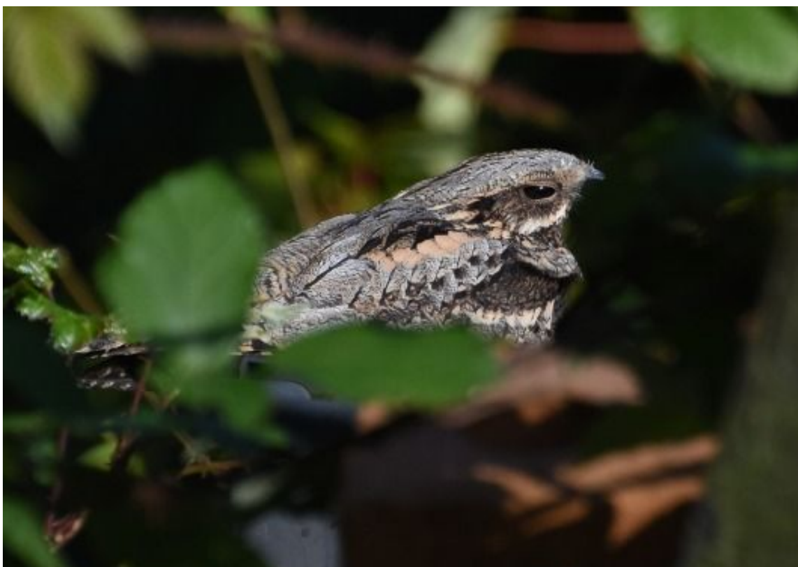
Eurasian Nightjar, Hundleby; photo © Christine Parker, September 2019