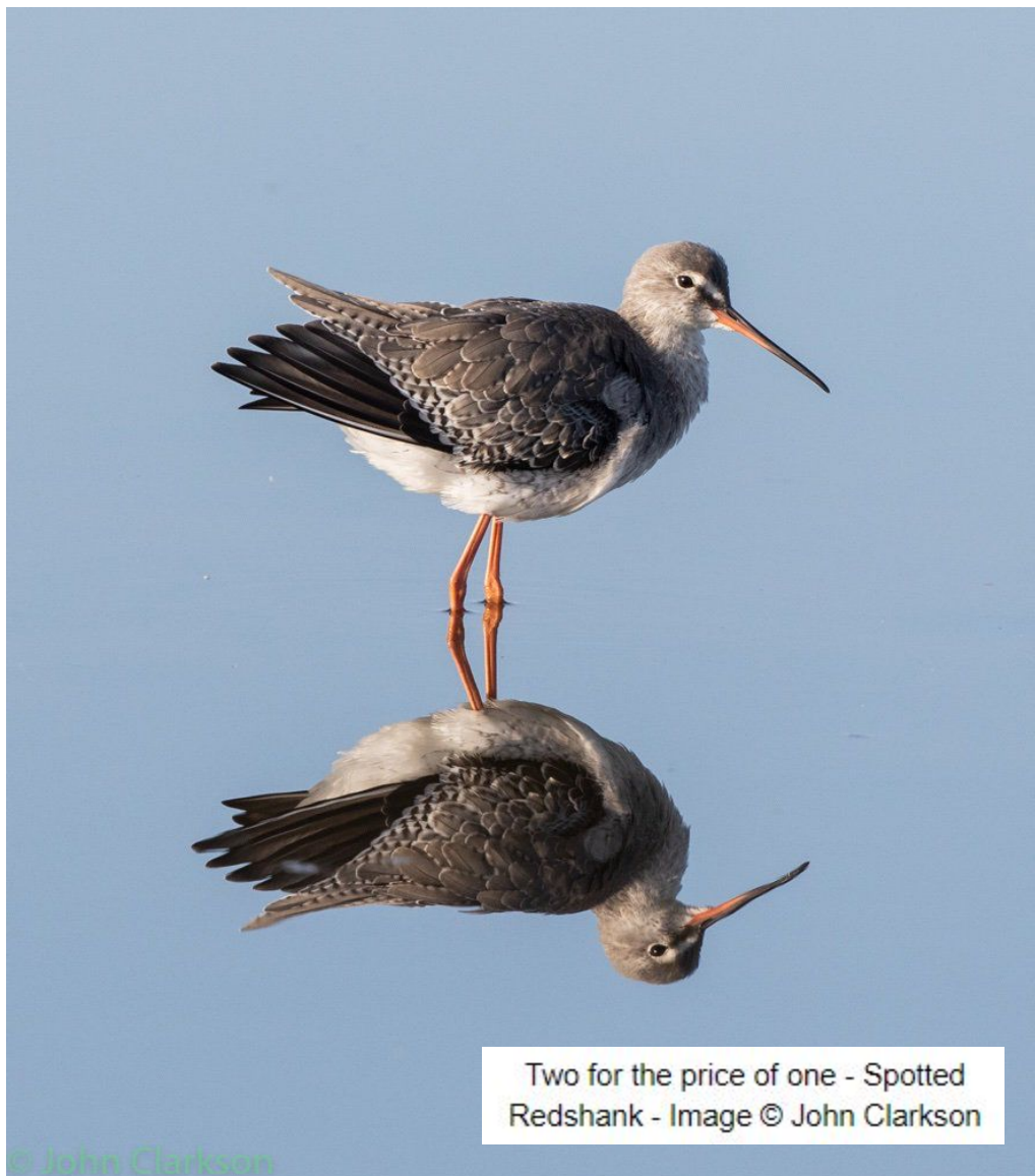
Two for the price of one - Spotted Redshank

5 Blackcap, Lapland Bunting, Chiffchaff, 27 Gannet (north), 21 Goldcrest, 104 Pink-footed Goose, Greenshank, Guillemot, Grey Heron, 3 Pintail, 2 Rock Pipit, 2 Water Rail, 7 Spotted Redshank, Common Redstart, 7 Common Scoter, 6 Siskin,