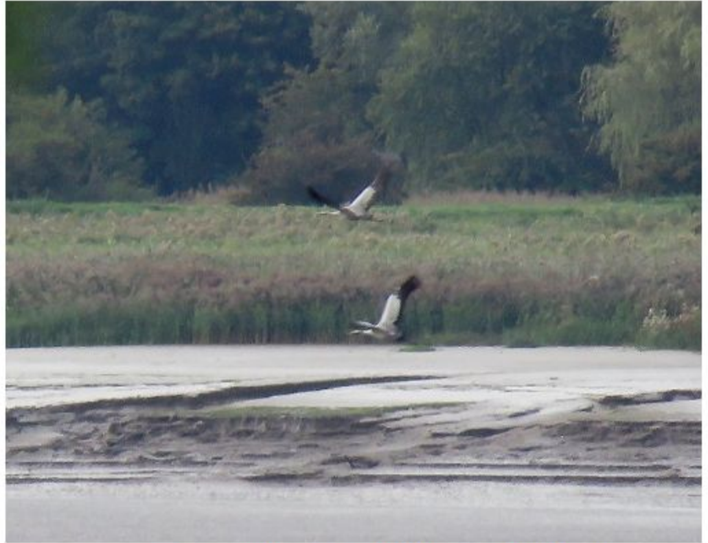
Common Crane at Alkborough Flats

Marsh Harrier, Hobby, 73 Pink-footed Goose (south), 3 Greenshank, 6 Goldcrest, Short-eared Owl, 2 Tawny Owl, Pintail, Common Redstart, Green Sandpiper, 2 Stonechat, 2 Treecreeper, Grey Wagtail, Yellow Wagtail