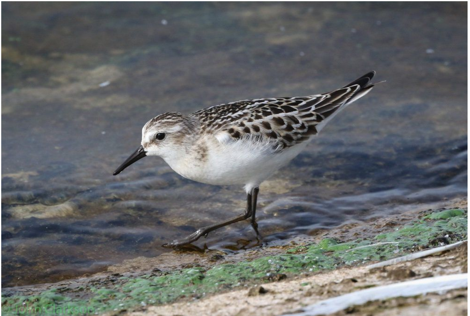
Little Stint, Covenham Reservoir