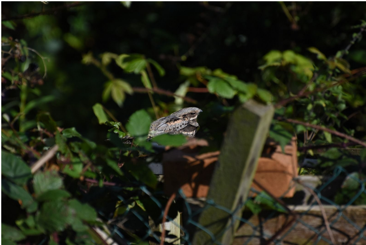
Eurasian Nightjar, Hundleby; photo © Christine Parker, September 2019