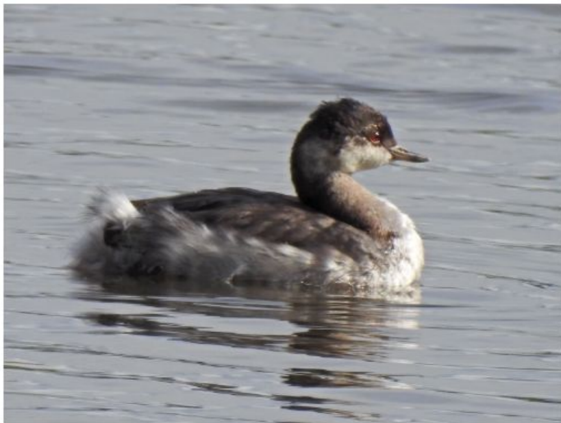
The Boultham Mere's long staying Black-necked Grebe

2 Greenshank, 6 Brent Goose, 20 Pink-footed Goose, Marsh Harrier, Hobby, Linnet, Sparrowhawk