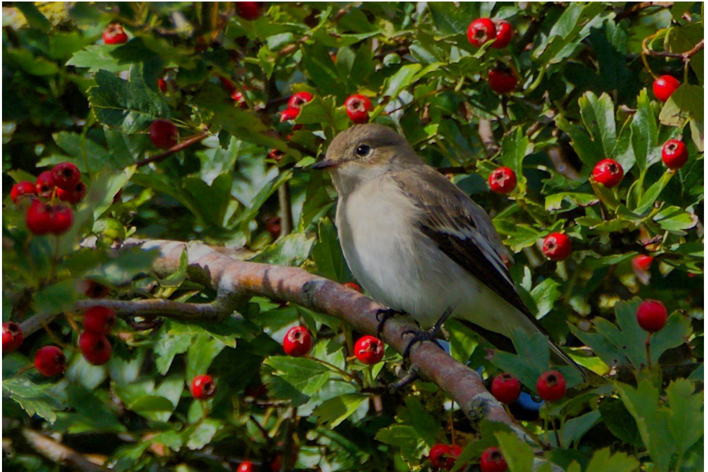
Pied Flycatcher at Frampton Marsh

3 Buzzard, Turtle Dove, Red Throated Diver (Witham Mouth), Eider(Witham Mouth), Pied Flycatcher, Greenshank, 3 Marsh Harrier, Hobby