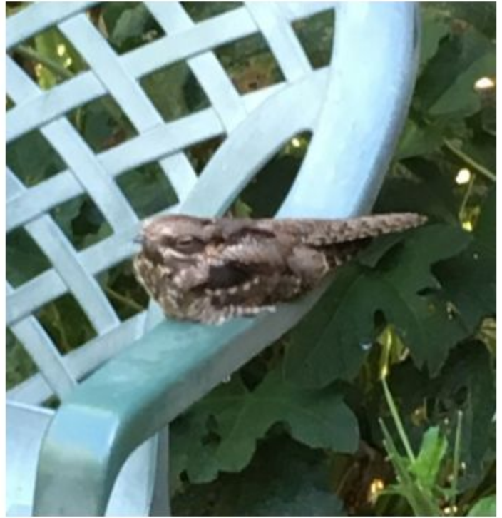
Eurasian Nightjar, Owmbly by Spital; photo © Kay Perry, September 2019

Western populations move south on a broad front across Europe, the Mediterranean and north Africa and winter mainly in east and south Africa, although small numbers may also winter in W Africa.