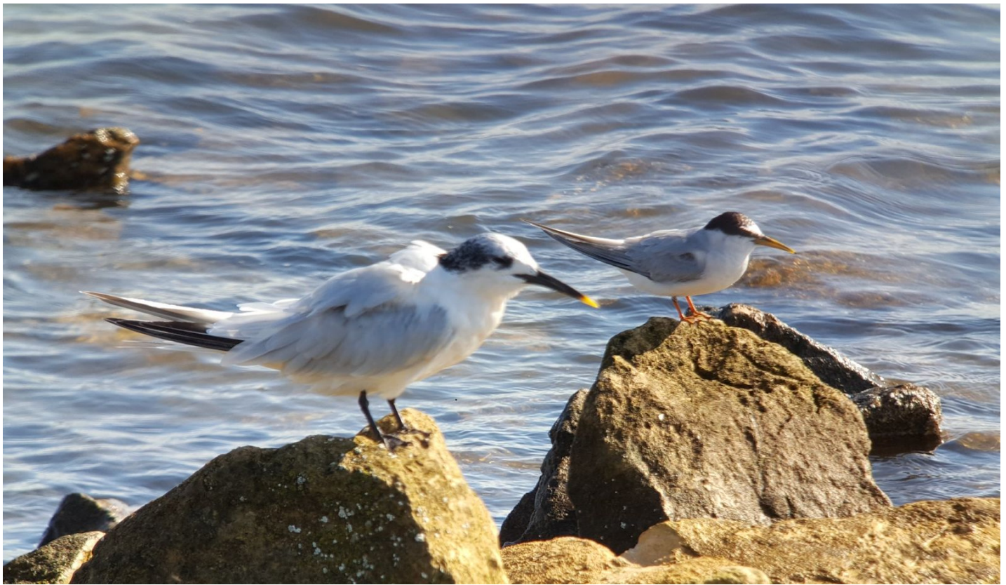
Sandwich and Little Terns side by side - Witham End

Corn Bunting, Peregrine Falcon, Gannet, Marsh Harrier, 2 Curlew Sandpiper, 6 Little Tern, 25 Sandwich Tern, 15 Whimbrel, 3 Whinchat