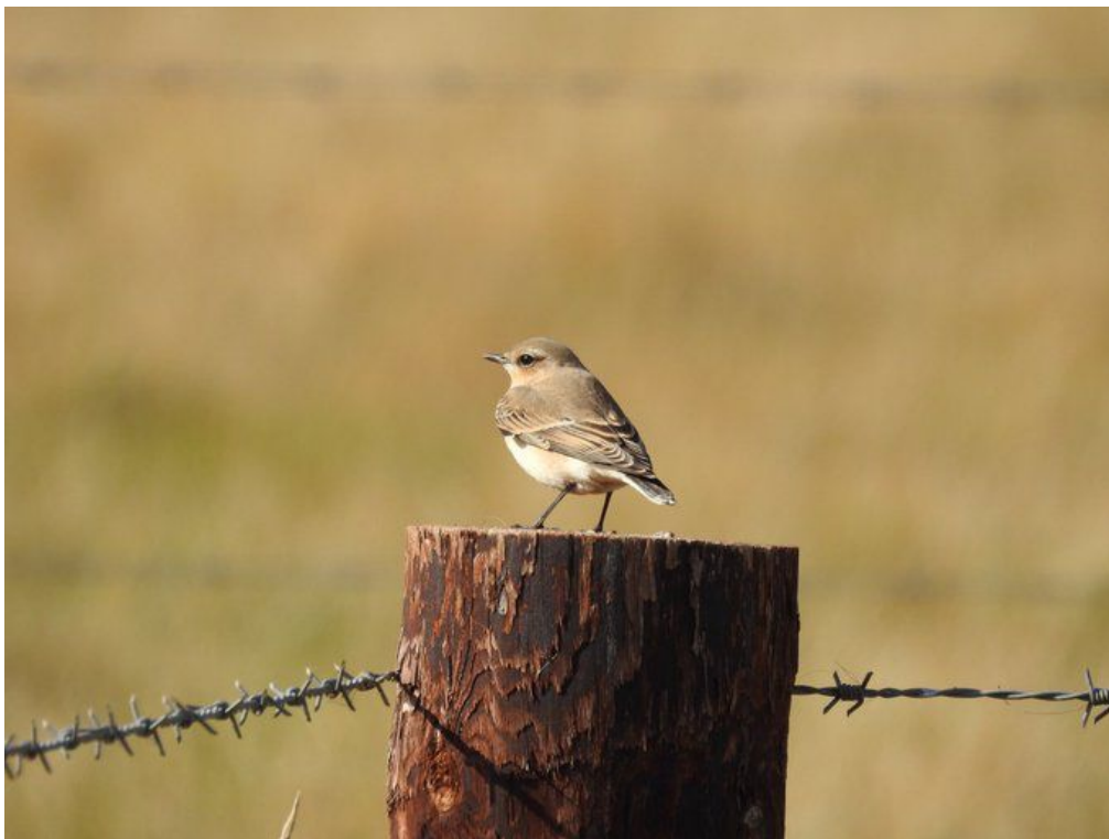
Northern Wheatear Huttoft Marsh

6 Reed Bunting, 4 Buzzard, 16 Curlew, Spotted Flycatcher, 38 Gadwall, Garganey, 2 Hobby, 2 Kestrel, Kingfisher, 4 Little Grebe, Marsh Harrier, Jay, Lapwing 60, 43 Mallard, 100 House Martin, 6 Sand Martin, Water Rail, 5 Green Sandpiper, 3 Shoveler 9 Snipe, 100 Swallow, 4 Mute Swan, 21 Teal, Yellow Wagtail, 2 Sedge Warbler