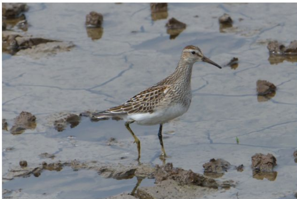
Pectoral Sandpiper by the seawall, Frampton Marsh

6 Arctic Skua, 6 Arctic Terns, 4 Brent Goose, Fulmar, 8 Gannet, Arctic Skua, Great Skua, Kittiwake, Razorbill, 125 Teal, Sandwich Tern, 2 Snipe,