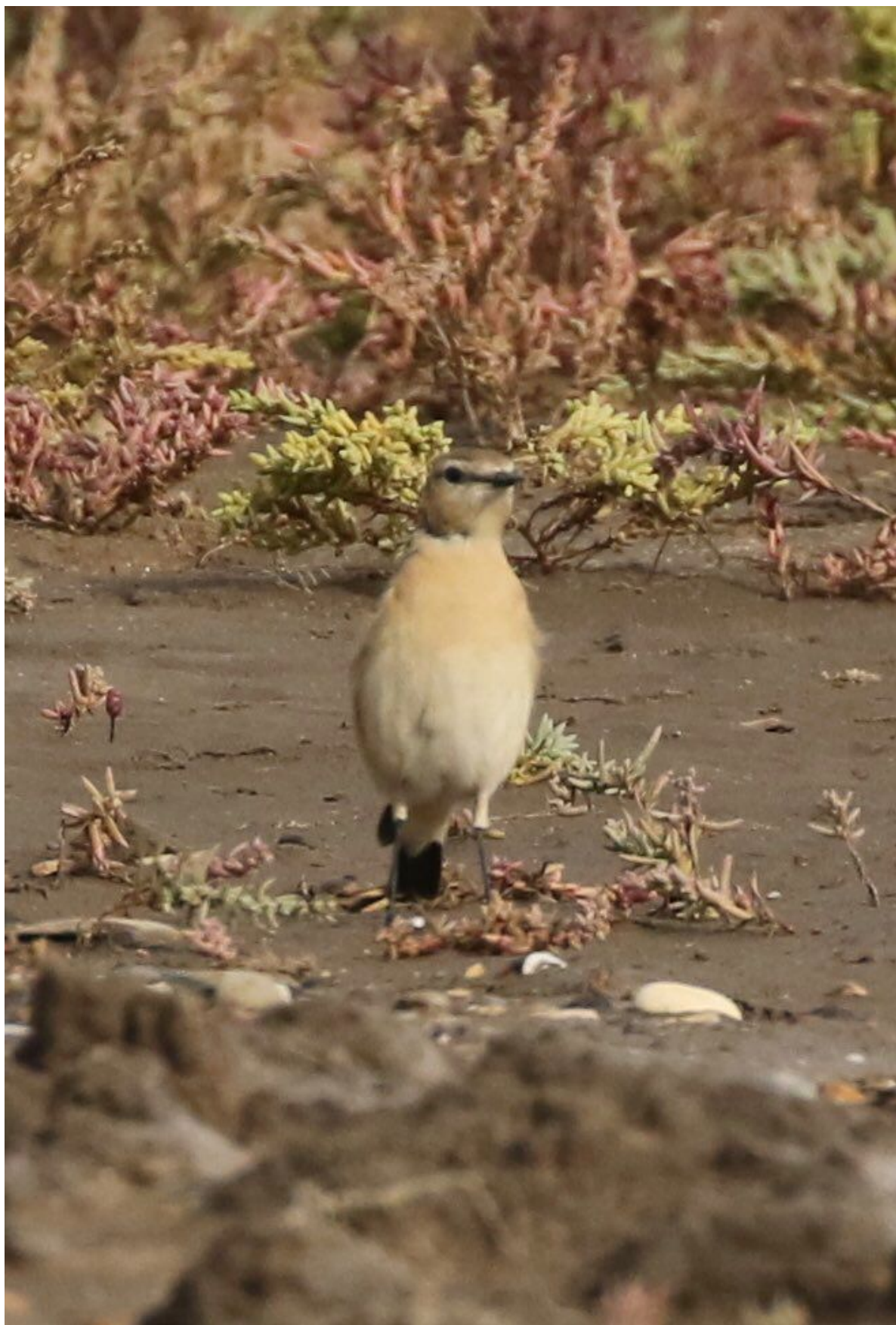
Isabelline Wheatear at Gibraltar Point