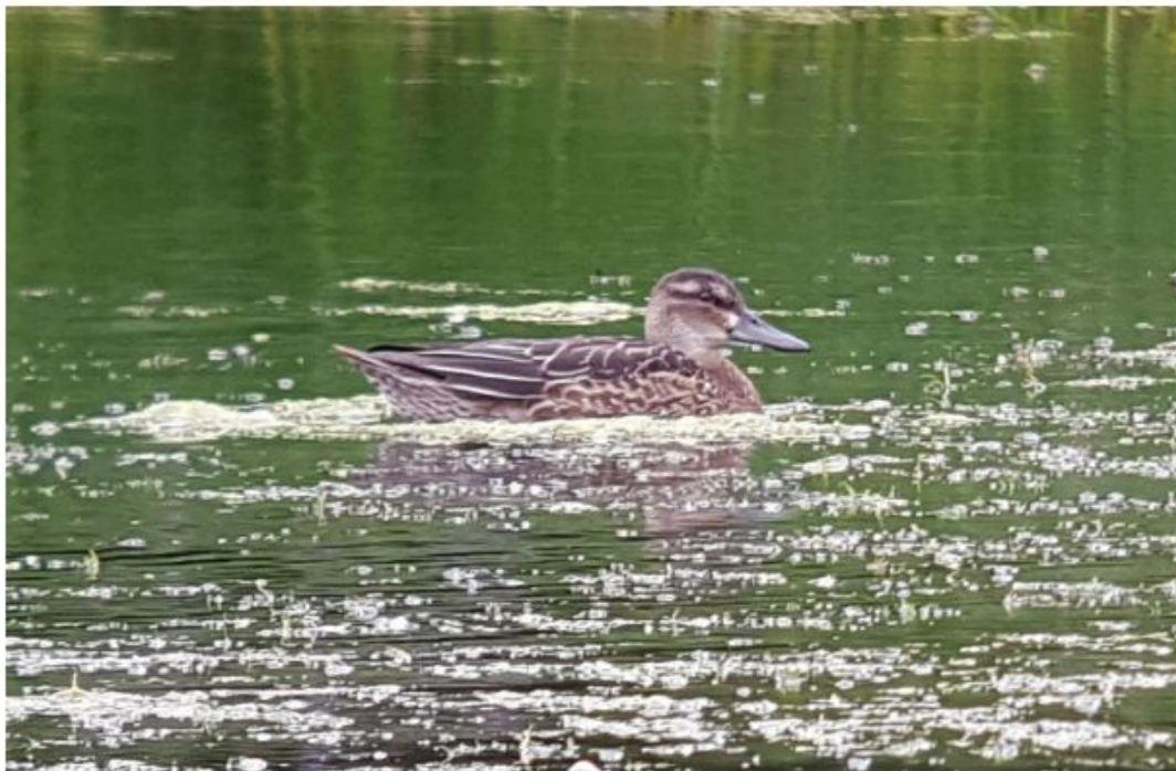
Garganey at Marston STW

Buzzard, Black-throated Diver , 2 Great White Egret (south), 2 Pied Flycatcher, 27 Pink-footed Geese, 20 Goldcrest, 5 Greenshank, Marsh Harrier, 37