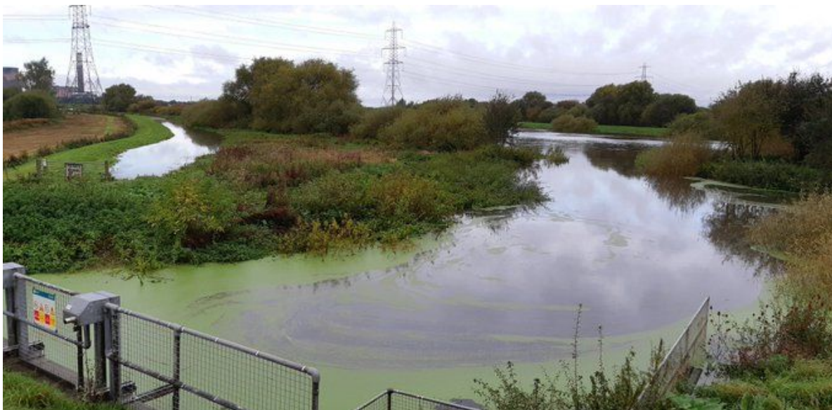
Trent Port Marton looking rather soggy