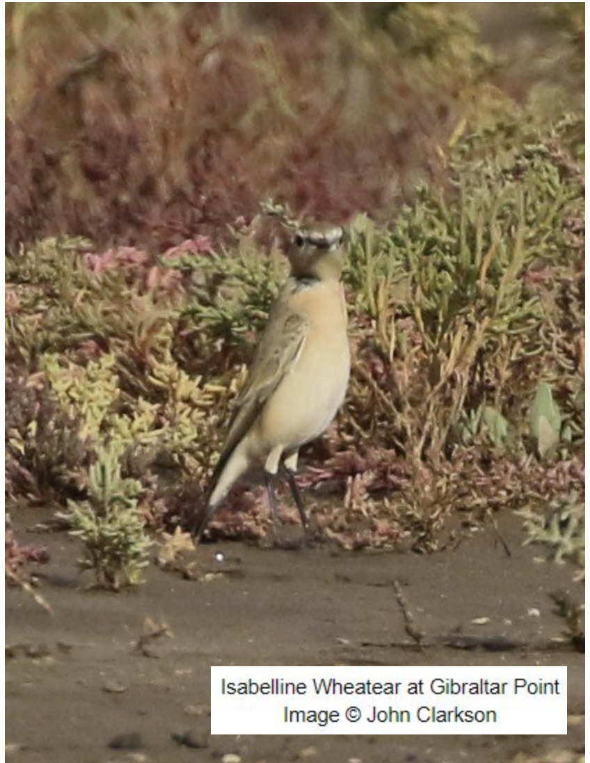
Isabelline Wheatear at Gibraltar Point

Even though it made for a very small image in less than ideal conditions, there was something