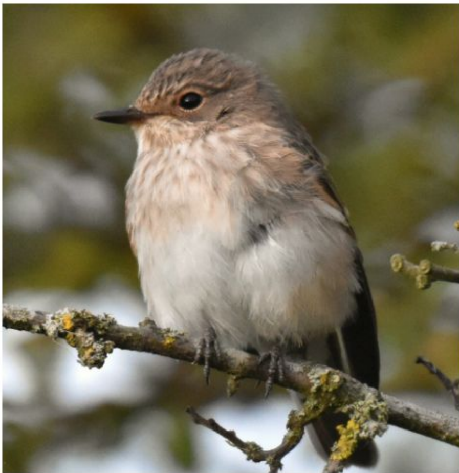
Spotted Flycatcher, Gibraltar Point

Probable Red-breasted Flycatcher (heard calling briefly?)