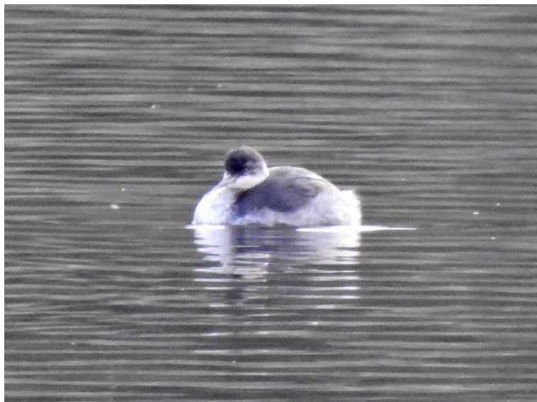
Stonechat Pig Lane and Black-necked Grebe, Boultham Mere