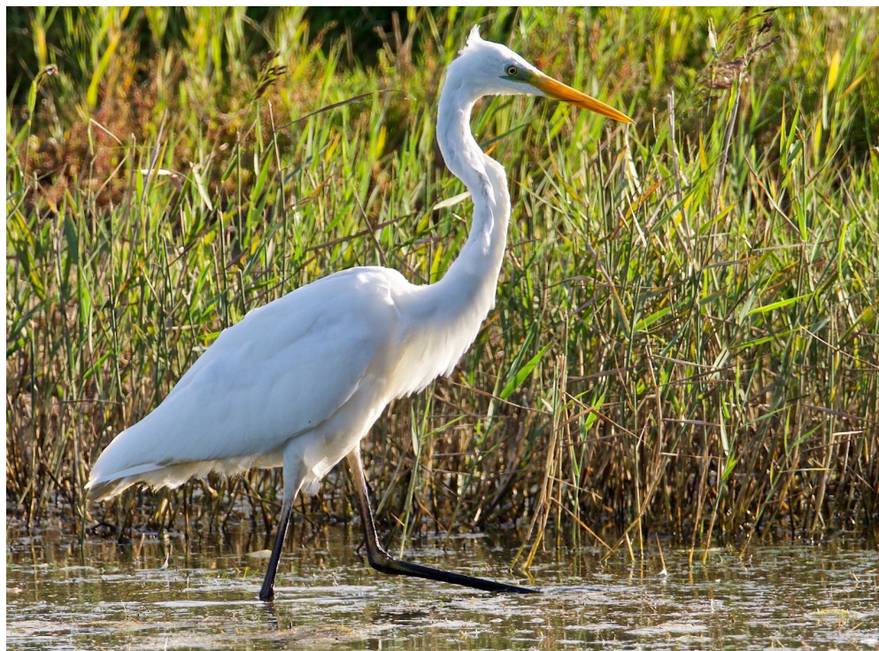
Great White Egret, Freiston Shore - Image © Paul Sullivan