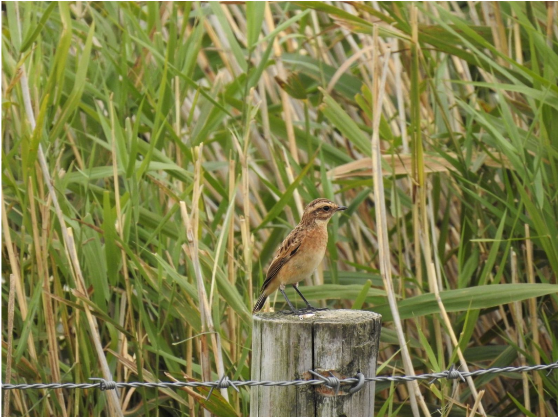
Whinchat Anderby Marsh