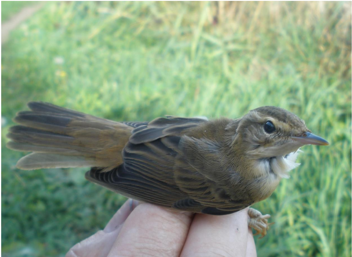
Presumed Marsh x Sedge Warbler hybrid – Marston STW, Lincolnshire. 06-09-2022