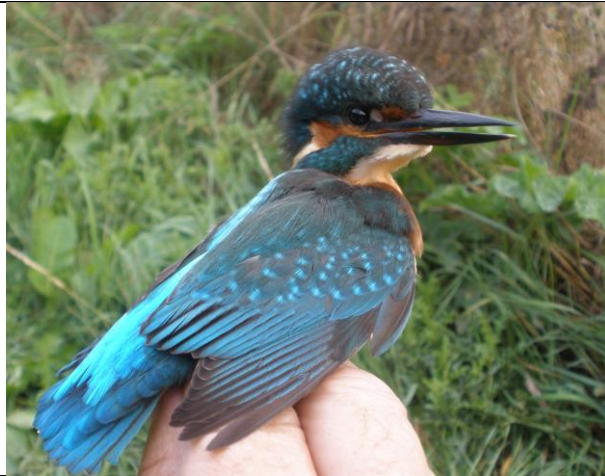
Kingfisher – Marston – 3 rd Sep 2022