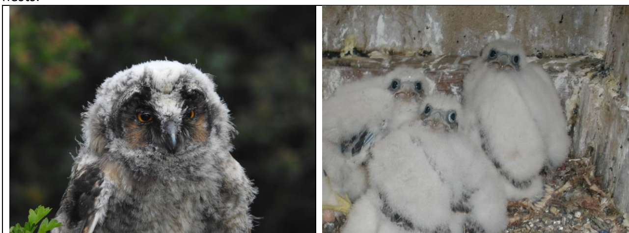
Long-eared Owl chick – Sleaford GC

As well as starting the main Barn Owl nestbox check we managed to ring a single Long-eared Owl chick – one of three that had ‘branched’ at Sleaford Golf Course and 11 Peregrine chicks in three nests.