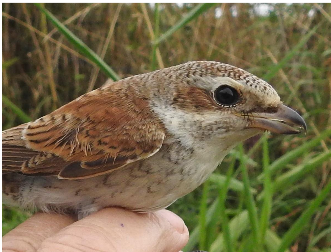
One of the most unexpected birds of 2022 was this Red-backed Shrike at Marston STW in September