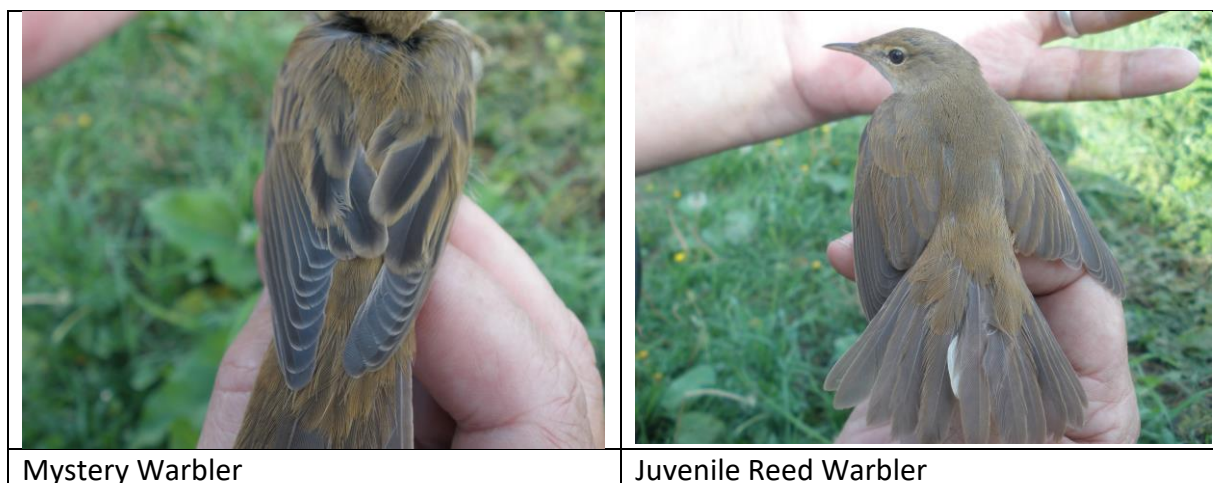
Photos showing the dark centres to feathers, particularly the tertials