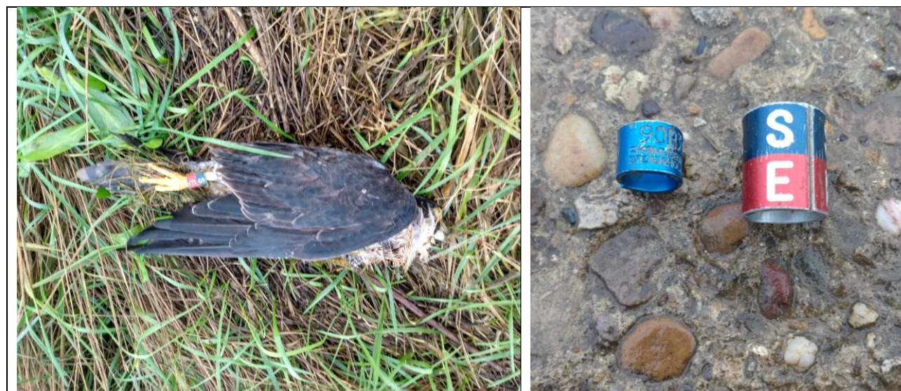
Dead Swedish-ringed Peregrine found under overhead wires at Fosdyke Marsh in November 2022