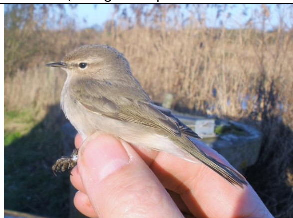
Siberian Chiffchaff – Marston STW – 05/01/2022

The highlights of the first fortnight of the year were at Marston STW with the best bird being a Chiffchaff of the race tristis , or “Siberian Chiffchaff”, which was caught on the 5th. Unfortunately the bird did not call during its stay of at least three weeks at Marston; call being one of the best distinguishing identification features of the tristis race from the nominate collybita . However this bird did react to a playback tristis call and seemingly ignored collybita call, and was one of two seen at Marston, along with up to five ‘normal’ collybita types.