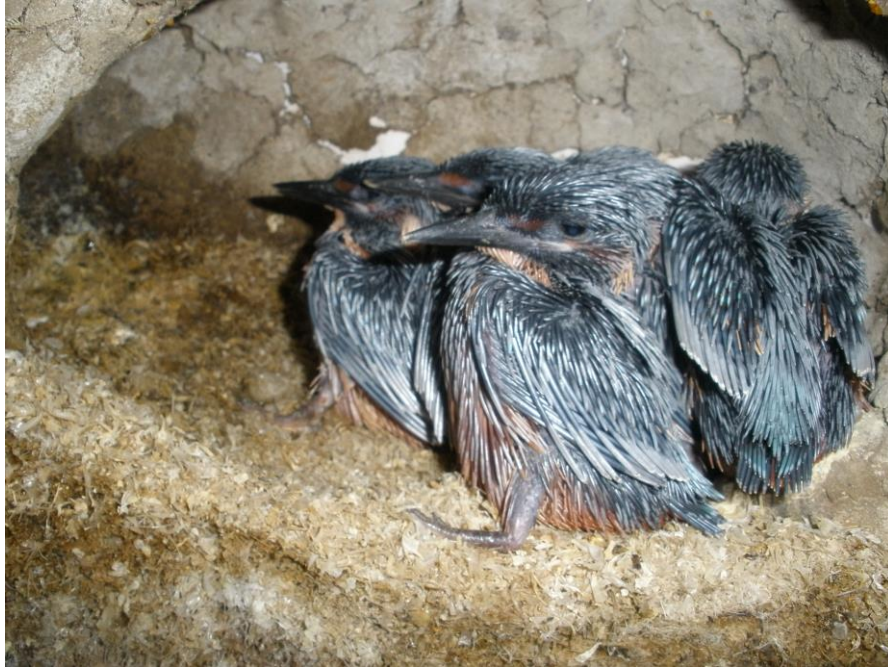
Kingfisher chicks at Essendine – July 2022