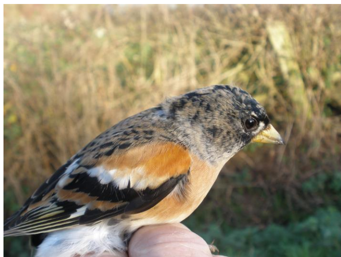
2022 was our best ever year for Brambling