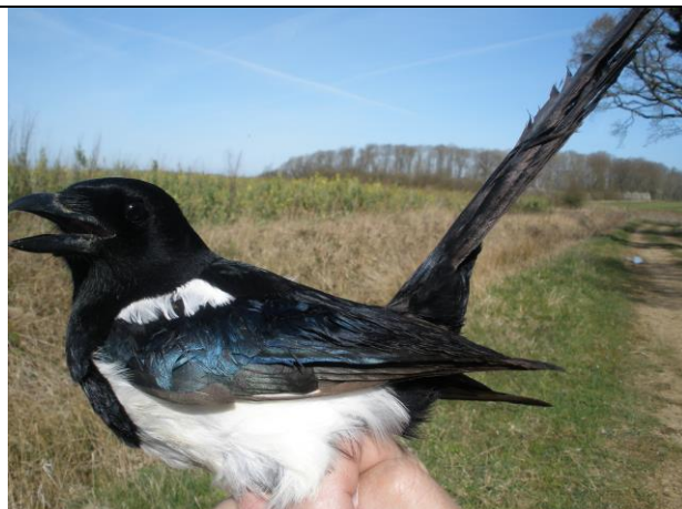
Brambling, coming into breeding plumage, and Magpie – Westfield Farm – April 2022