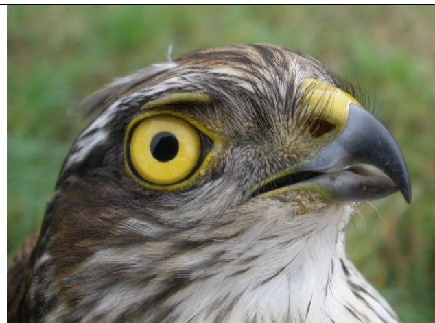
Sparrowhawk - Dunsby