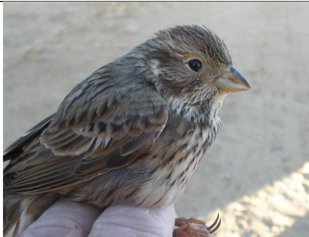
Corn Bunting at Westfield Farm, Cranwell

A total of 554 birds were ringed during March with 248 of these being Brambling. Individual site totals were 257 new birds at Westfield Farm, Cranwell with 112 of these being Brambling, 133 at Dunsby Fen including 61 Brambling and 104 at Dunsby village including 72 Brambling. The month also saw Brambling added to the Marston list with three caught. Other highlights included 63 Yellowhammers, another Sparrowhawk, Corn Bunting and our only Treecreeper of the year at Westfield Farm. After seeing a Little Owl at Westfield Farm, perched on an occupied Jackdaw box, Ian erected a Little Owl box lower down the pole and a Little Owl was caught in the box 48 hours later and they went on to breed successfully!