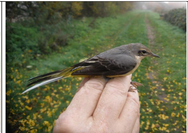
Cetti's Warbler and Grey Wagtail – Marston STW – Sep 2022