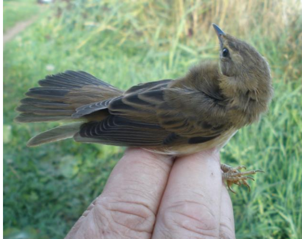
Marsh x Sedge Warbler – Marston 7 th Sep 2022