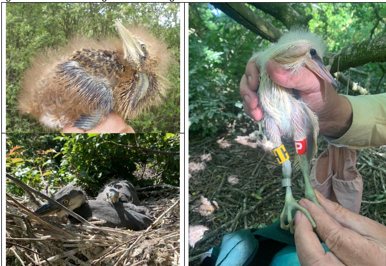
Bittern – Baston Fen. Grey Herons and Little Egret – Leadenhall Farm – May 2022

Exactly 400 birds were ringed in May with the usual emphasis on Barn Owl nestbox checking, with Bob checking the Tawn Owl boxes in the Forestry Commission woods, and Brian doing the ones in Temple Wood. The weather continued very warm and dry, but Little Owls seemed to manage reasonably well. Highlights of the month were a Bittern chick, 2 Grey Heron chicks and 13 Little Egrets of which we managed to colour-ring 12 of them.