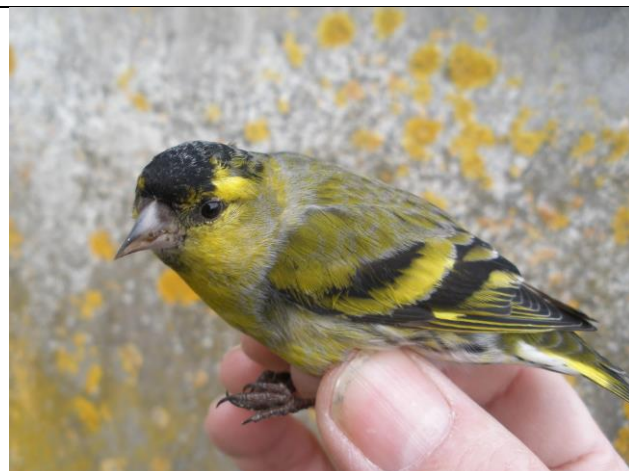
'Unexpected' Siskin - new for Marston STW

Just over 500 birds were ringed in February with the 'top spot' going to Brambling with 157 ringed. Late in the month, two Sparrowhawks at Dunsby was a welcome addition for the year, having ringed none at all in 2021.