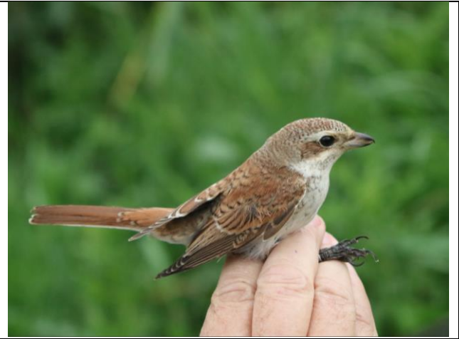
Red-backed Shrike – Marston – 4 th Sept 2022