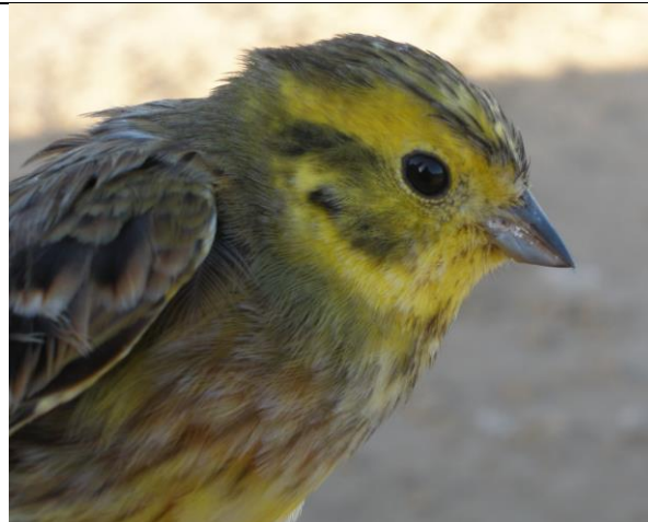
Yellowhammer at Westfield Farm, Cranwell