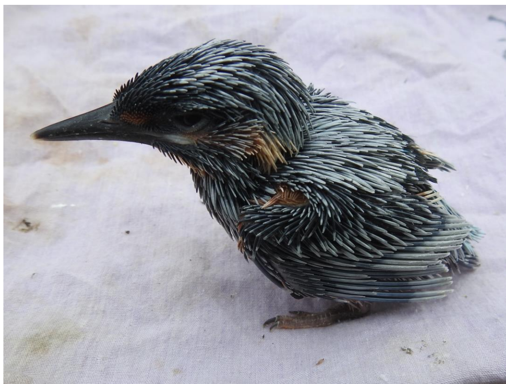
Kingfisher chick at ringing stage – Essendine – July 2022

Note ** High number of 'other' sites is due to isolated nest-boxes spread throughout Lincolnshire and adjacent counties, where just a few chicks and/or up to two adults are normally ringed.