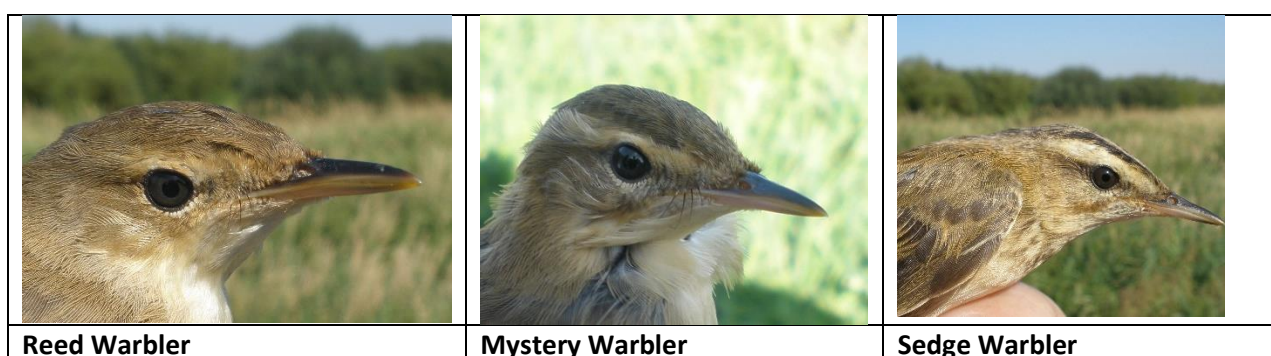
Comparison 'head shots' of the mystery warbler with Reed and Sedge Warblers

As is standard practice with identifying warblers, a wing formula measurements as well as standard wing-length were taken and were:-