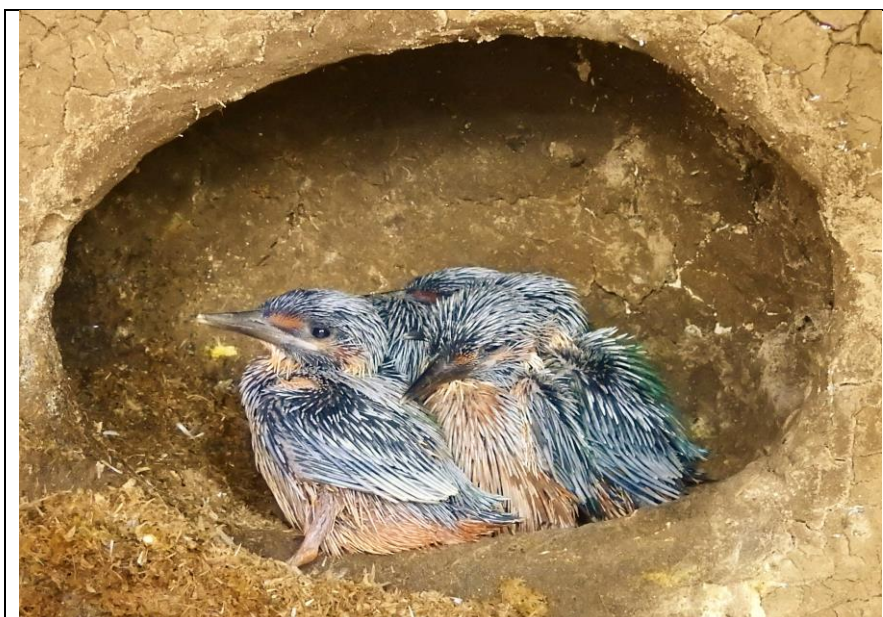
Tom Robinson's Kingfisher nest-box has raised 23 young in 3 years

Another highlight during the month was another opportunity to ring a brood of Kingfishers at Tom Robinsons artificial nest site on the River Glen. Tom had to rebuild it early in the year after adverse weather resulted in unprecedented flooding which washed the original artificial nest site away. The Kingfishers nested later than normal and only had the one brood. It is a real privilege to be able to ring pulli Kingfishers as it is impossible to access a natural nest without causing damage.