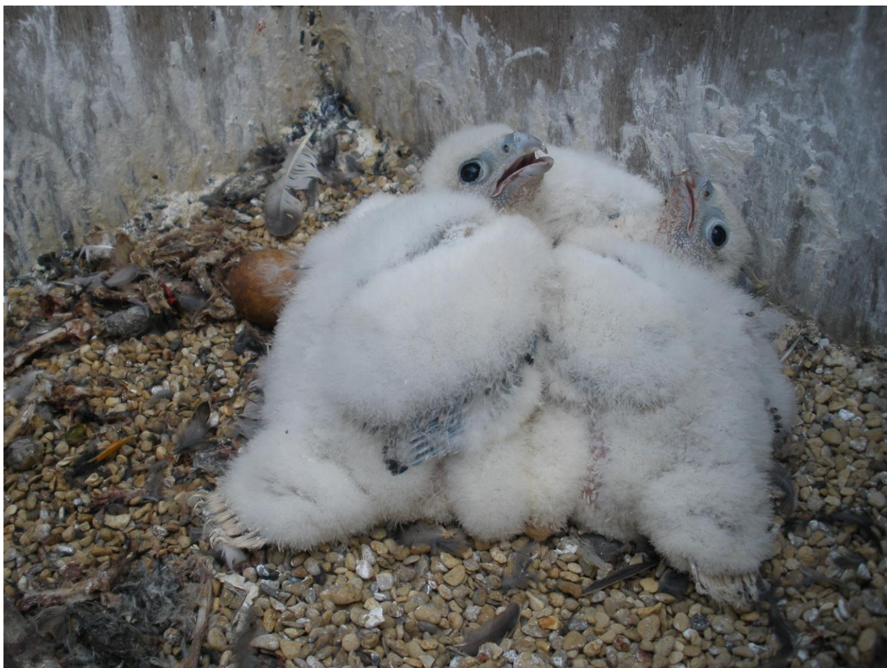
St Wulfram's 2012 – chicks are 16 – 18 days old.

The use of cameras allows a single perfectly timed visit to ring the chicks. The chicks are big enough to ring at 16 days old and leave the nest tray and are more mobile at around 21 days, so we aim for this five-day window.