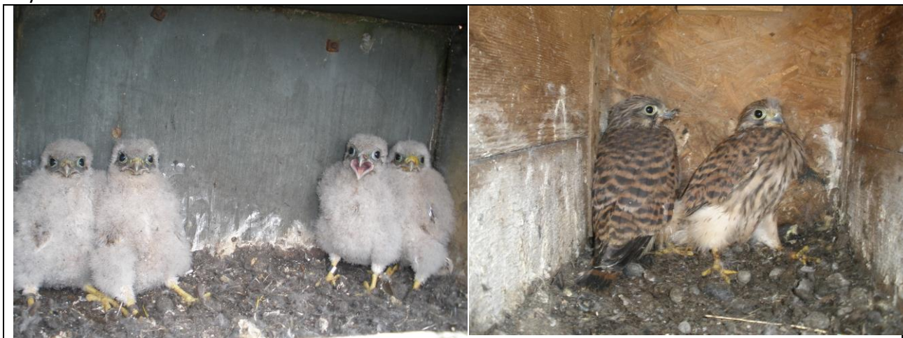
Kestrel chicks – photographed on same date in 2021 illustrating range of ages

Again this year, perhaps due to the weather our Kestrel season was quite spread. Normally Kestrels fledge around the end of June, but this year some had fledged mid-month with later ones at end of July.