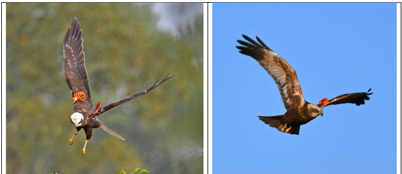
This male Marsh Harrier remains at Marston, changing colour from Oct 20 to Dec 21.