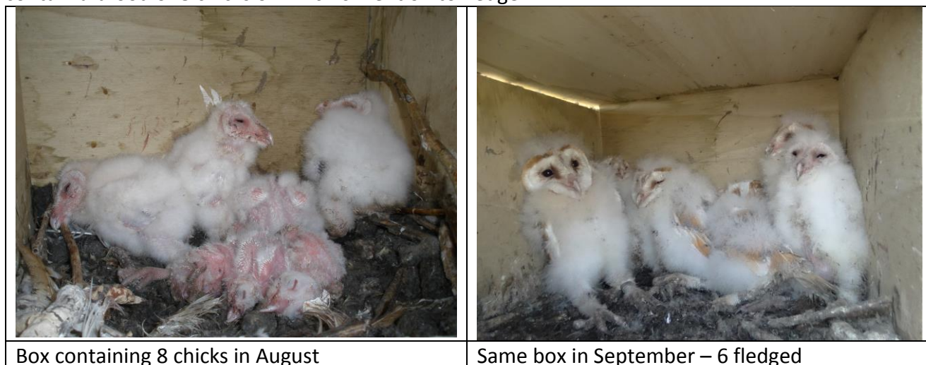
Box containing 8 chicks in August

A few pairs of Barn Owls had late broods with some big brood sizes. One box was found to contain a brood of 8 chicks of which 6 went on to fledge.