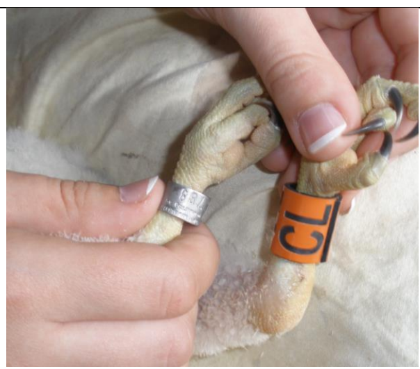
St Wulfram's 2012 - close-up of colour ring