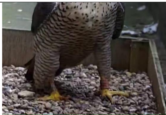
St Wulfram's 2021 – colour-ringed female interloper appeared in the nest tray on 5 th March

Another female appeared on 5 th March that was colour-ringed. It was frustrating that we were not able to zoom in on time to confirm the colour ring lettering. We are 95% sure it is "T7C" which if correct, was ringed as a female chick at Leeds in May 2019. This bird was present for a few days, following which 'our' female inspected the nest tray again. However, it is possible that this new bird 'spooked' our original pair as they both disappeared just prior to egg laying.