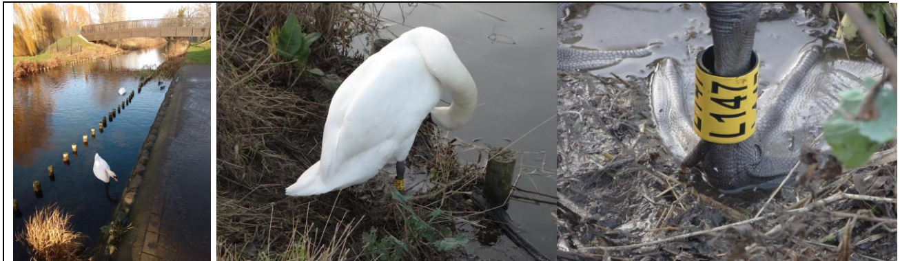
Pair of Mute Swans, which arrived in Sleaford on New Year's Eve, included this colour-ringed bird.