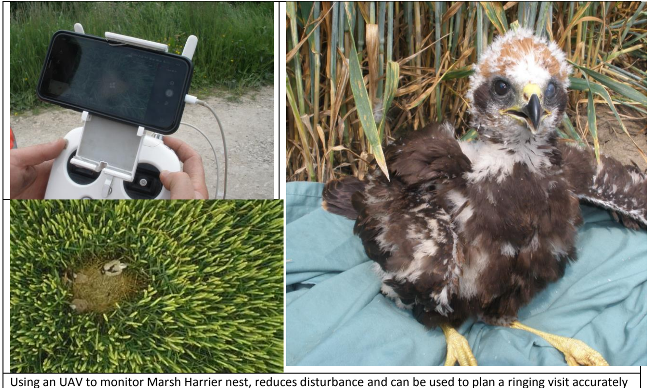
Using an UAV to monitor Marsh Harrier nest, reduces disturbance and can be used to plan a ringing visit accurately

The emphasis during July was carrying out follow up visits to ring the last of the Kestrel broods and Barn Owl first broods. The undoubted highlight was the chance to ring a brood of Marsh Harriers that Ian had been monitoring by drone to safeguard the nest from farming activities. We have the use of an 'Unmanned Aerial Vehicle' (UAV) added to our Schedule 1 Licence and is a really useful method of monitoring Marsh Harrier nests without disturbance or leaving a trail to the nest that other predators, such as foxes, could follow. It also enables a single nest visit to ring the chicks to be as late as practicable...and is very useful to walk to the location of the hovering drone, making the chick finding very simple in a large featureless wheat crop.