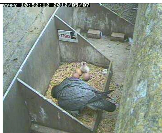
St. Wulfram's 2012 – first chick hatched

The cameras provide useful information regarding laying dates and hatching dates without any disturbance to the breeding birds. It also allows to plan the most suitable date for a single nest visit, under licence, to ring the chicks.