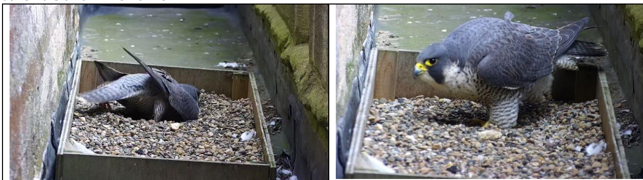
St Wulfram's 2021 – female on the nest tray and 'scraping' to make a scrape in which she would lay eggs

We were looking forward to be able to watch the Peregrines nesting this year on the new cameras. Unfortunately, despite promising signs in March with the birds visiting the nest tray and even 'scraping' in the tray, both birds disappeared just prior to expected egg-laying. They returned to the church in late June, but with no fledged youngsters in tow, so we know that they did not breed successfully elsewhere locally. It is possible that another female that turned up on 13 th March caused disruption and put our birds off. This new female was seen to be colour-ringed (both our regular birds were not). Unfortunately we could not quite confirm the black lettering on the orange ring. We are 95% convinced it was "T7C" which was ringed as female chick in Yorkshire.