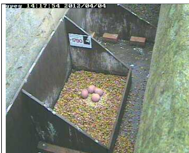
St. Wulfram's 2012 – full clutch of four eggs

Like many sites in the UK, we have installed cameras at a couple of church sites (Grantham, Bottesford, Louth and Boston) relaying images down to a TV in the church where the public can view them. At St Wulfram's church the TV feed was intercepted and the images then made viewable online. This gave a fascinating insight into the birds' behaviour and revealed some interesting facts.