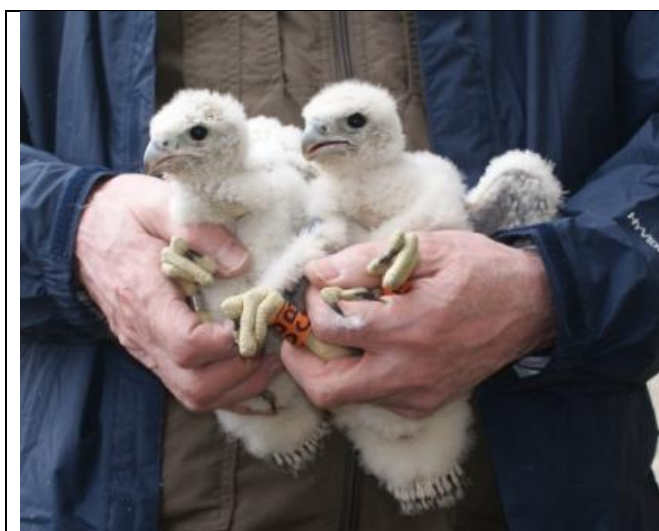
St Wulfram's 2010 – chicks at 16 days old

Our chicks have been colour-ringed using an orange colour ring with black lettering, so that they can be identified in the field. They can usually be sexed at this age, with the females significantly bigger with thicker legs than the males.