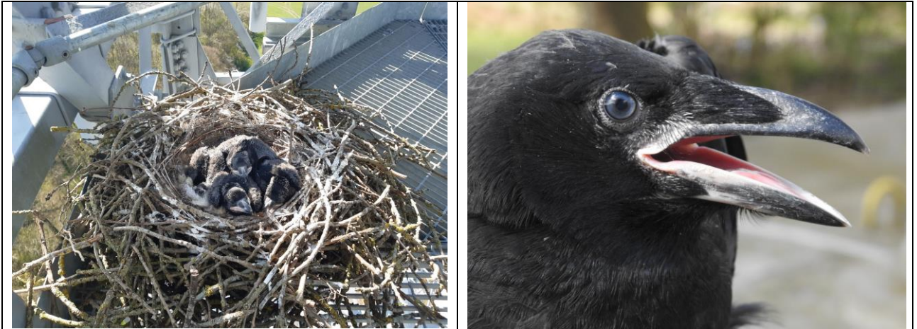
Raven chicks at different ages – three broods of four were ringed in April

Just over 150 birds were ringed during April, mostly finches and a few tits. Towards the end of the month, Bob was able to start his Tawny Owl nest box checks, after being unable to check any in 2020 due to last year's Corona Virus "lockdown". The highlights of the month were twelve Raven chicks from three nests, and a single Grasshopper Warbler at Marston.