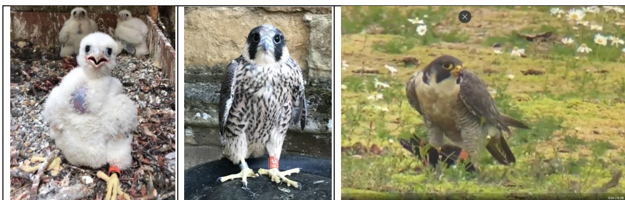
(a). "P6C" at ringing, (b) subsequent rescue during fledging by Keith Waterfall, (c) photo at Langford